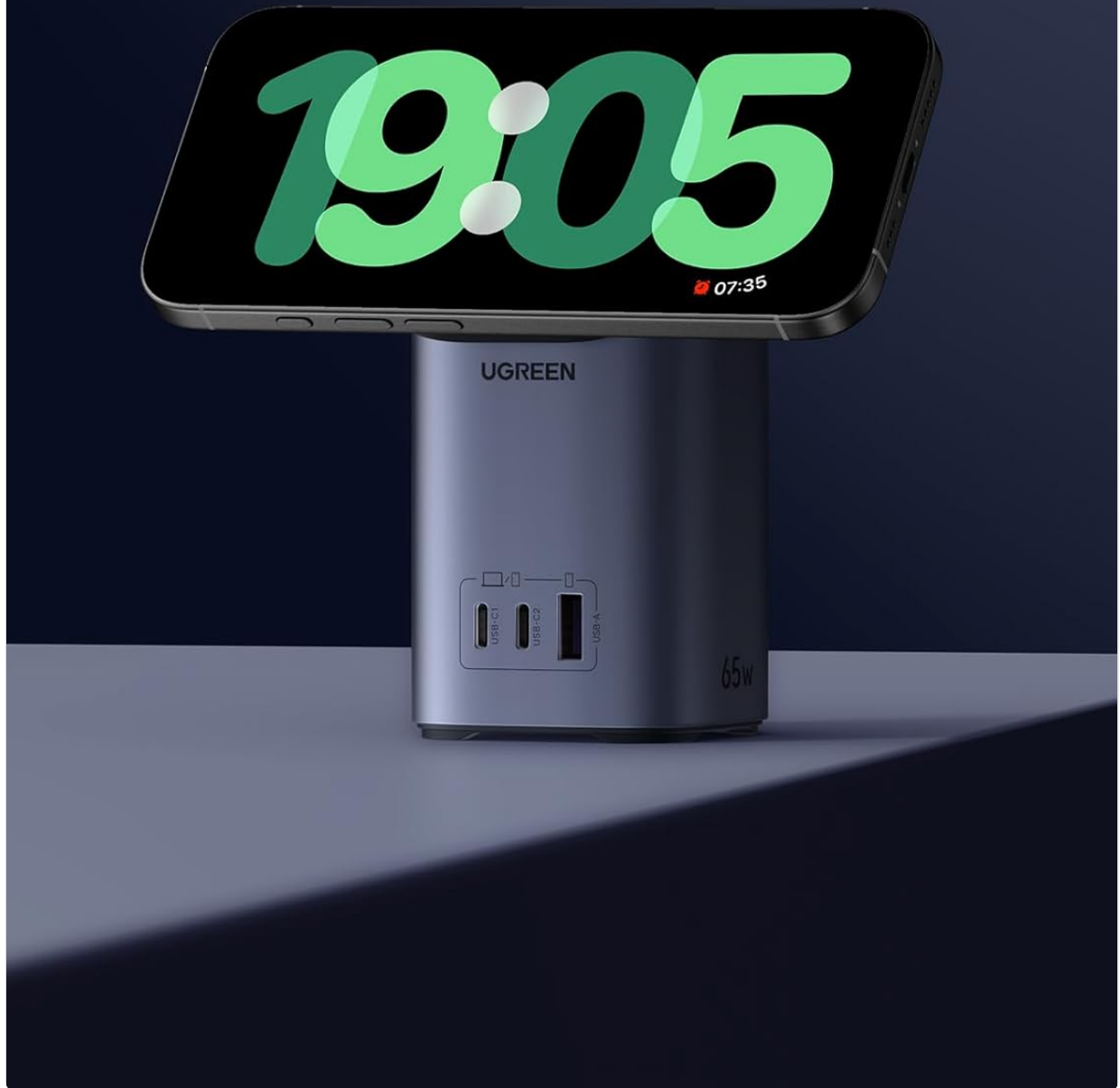
Image: An iPhone displaying standby mode while charging horizontally on the UGREEN Nexode 65W Charging Station.