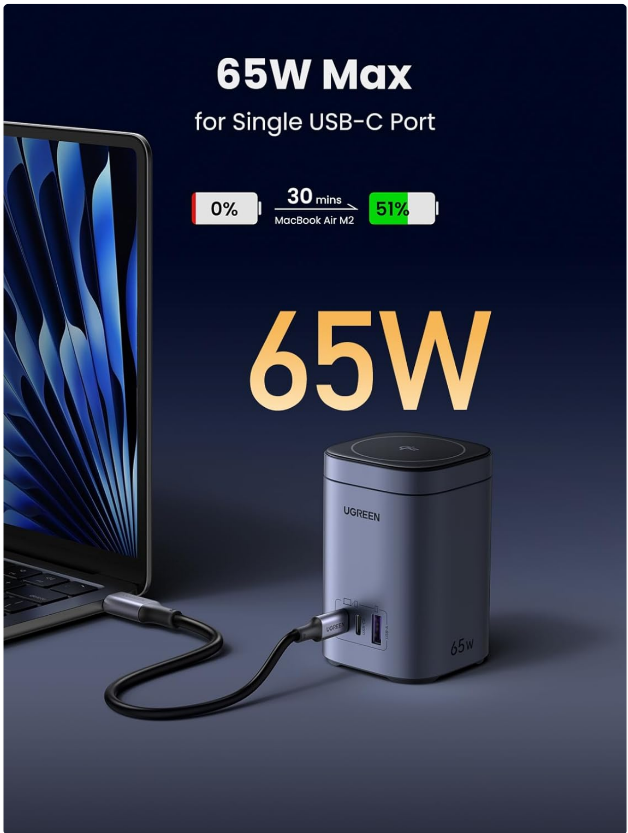
Image: The UGREEN Nexode 65W Charging Station providing 65W fast charging to a MacBook Air M2 via its USB-C port.