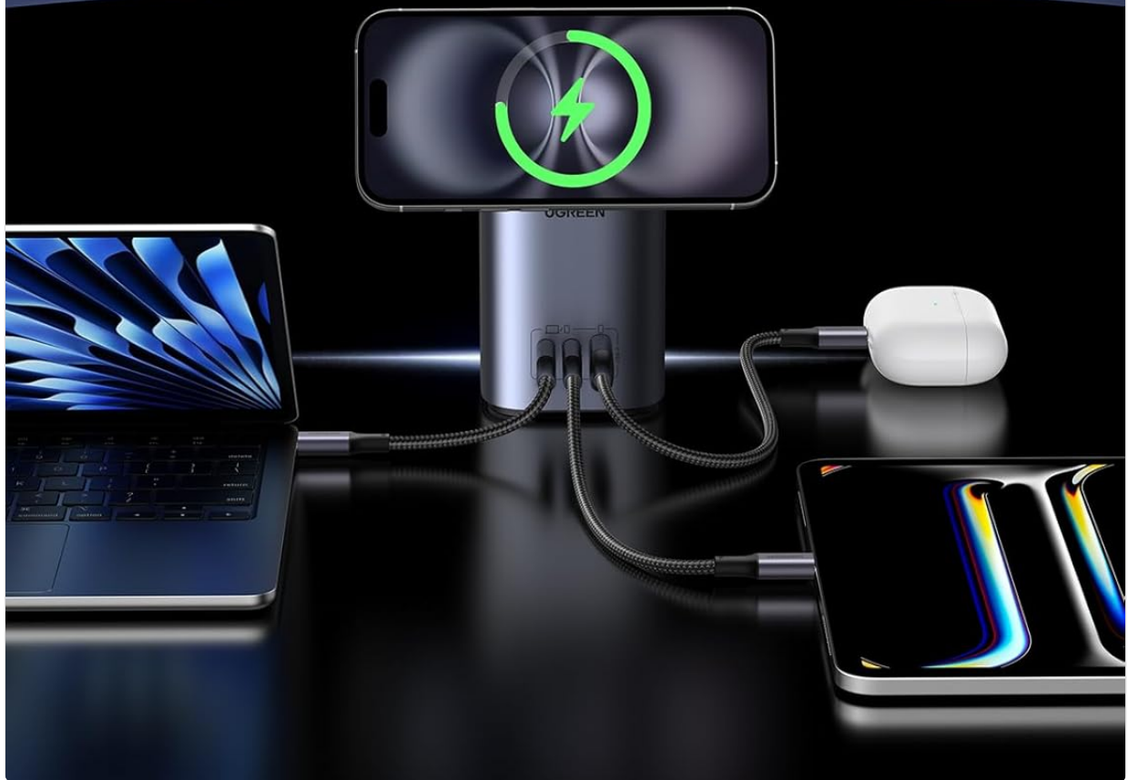
Image: The UGREEN Nexode 65W Charging Station simultaneously charging a laptop, smartphone, tablet, and wireless earbuds, demonstrating its 4-in-1 capability.