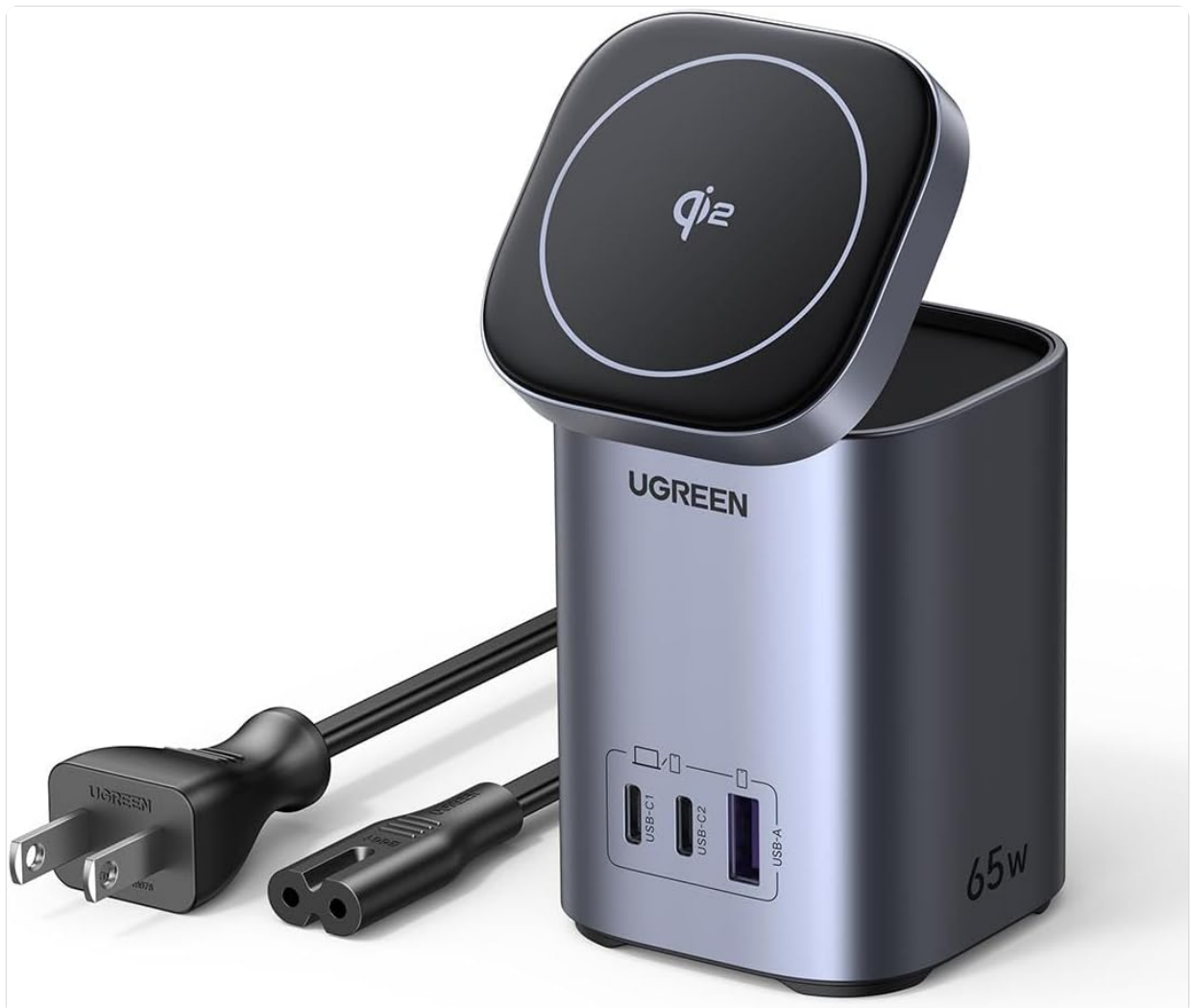
Image: UGREEN Nexode 65W GaN Charging Station, showcasing its compact design, multiple ports, and included power

The UGREEN Nexode 65W GaN Charging Station is a compact and powerful charging solution designed to efficiently power multiple devices. It integrates a 15W Qi2 wireless charging stand with two USB-C ports and one USB-A port, allowing for simultaneous charging of up to four devices. Built with advanced GaNFast II technology, it ensures optimized charging performance and enhanced safety features.