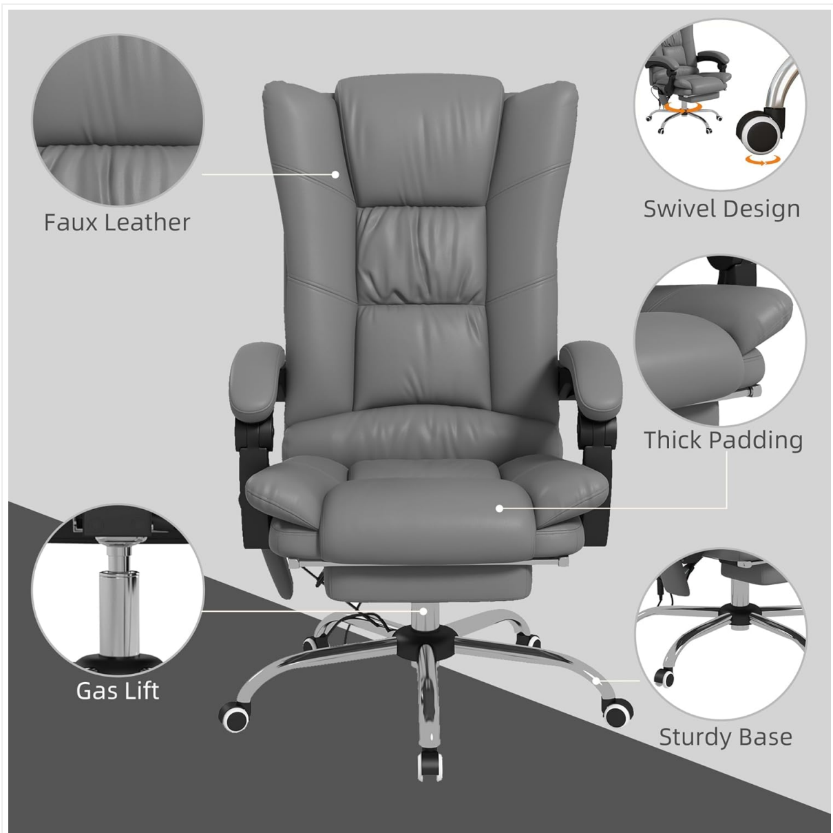
Image: Key features of the chair including faux leather upholstery, thick padding, gas lift, sturdy base, and swivel design.