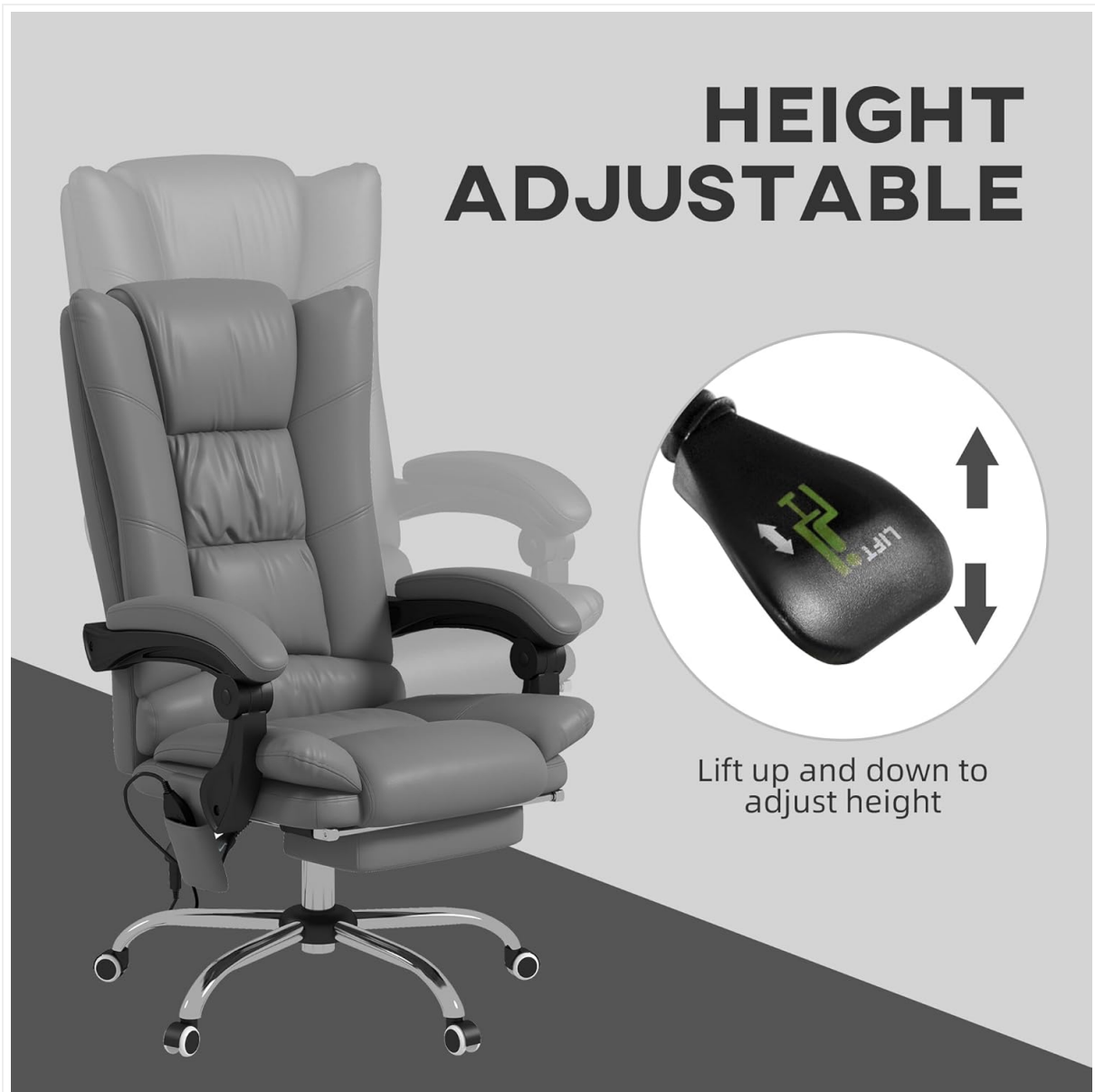
Image: Illustration of the height adjustment lever and its function.