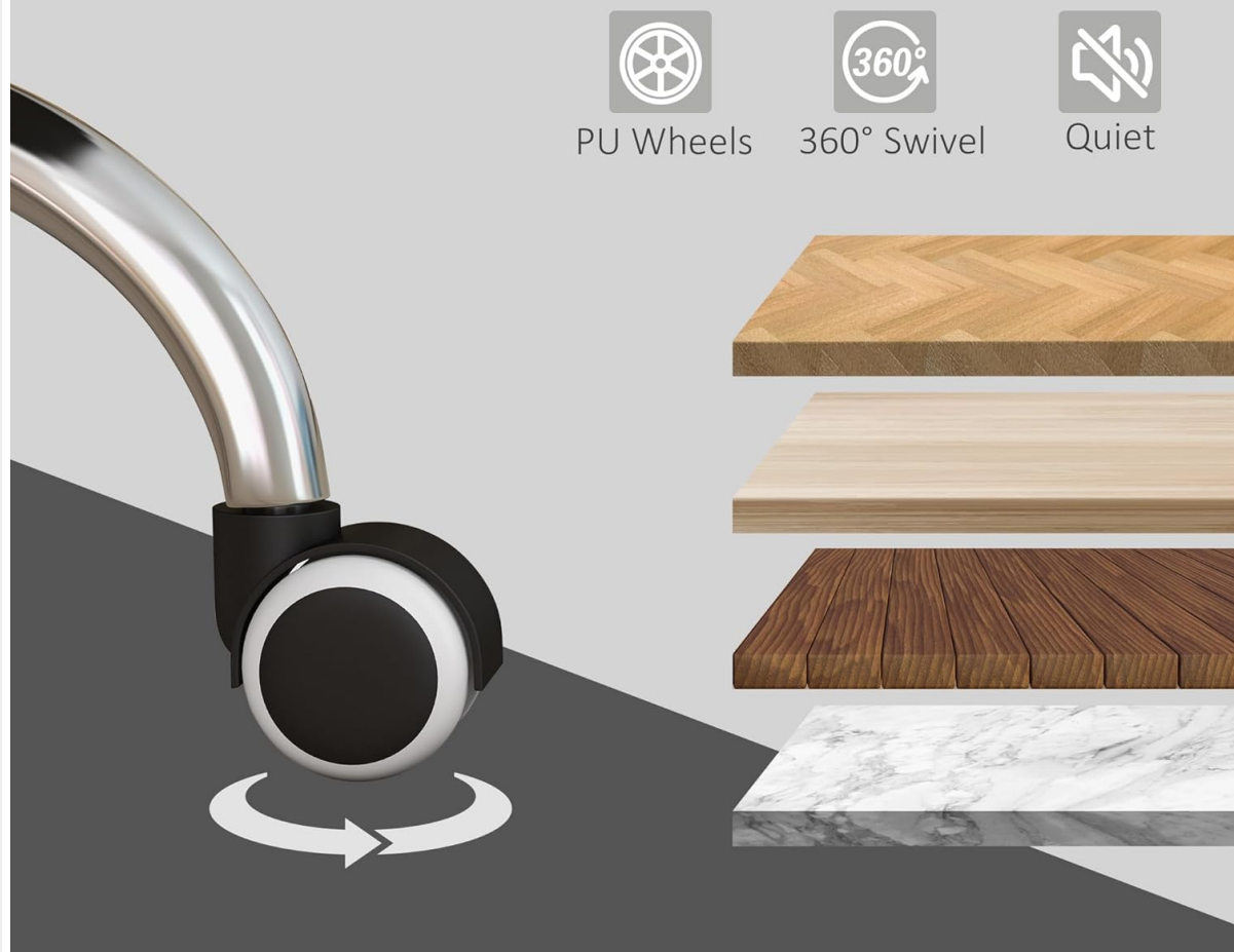
Image: Illustration highlighting the chair's PU wheels, suitable for various floor surfaces.