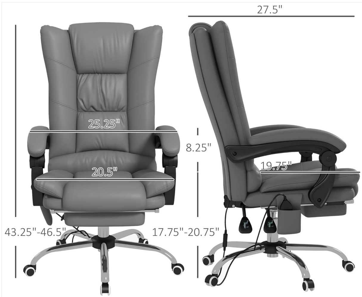
Image: Detailed dimensional drawing of the chair, showing overall and specific component measurements.