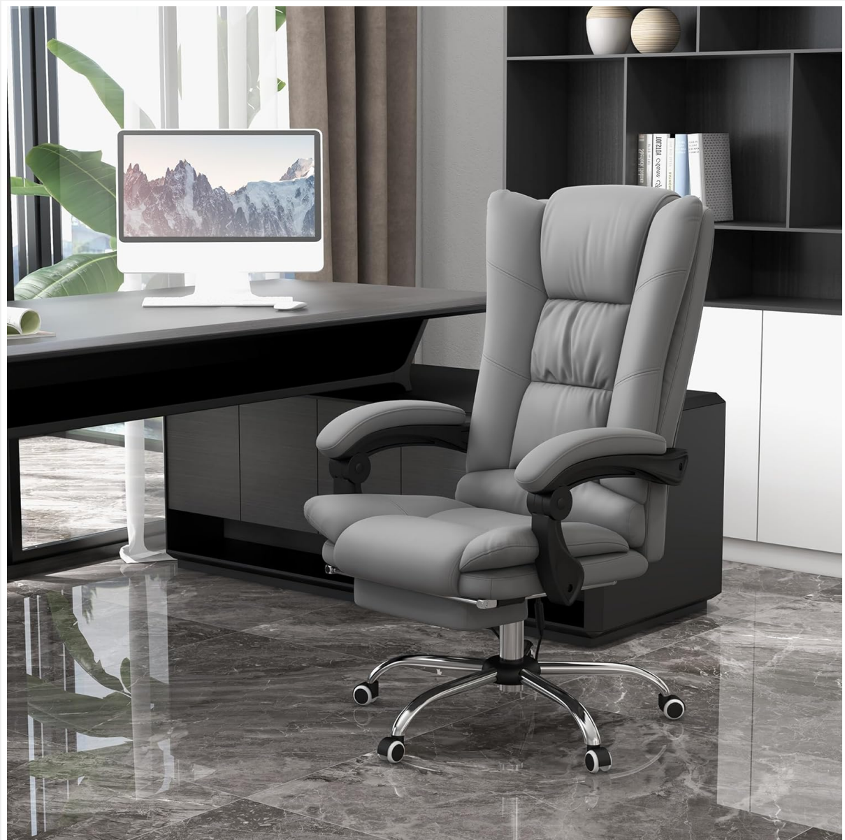
Image: A fully assembled Vinsetto Executive Massage Office Chair, ready for use.

Note: Some users find it helpful to tighten the footrest screws after initial assembly to ensure stability.