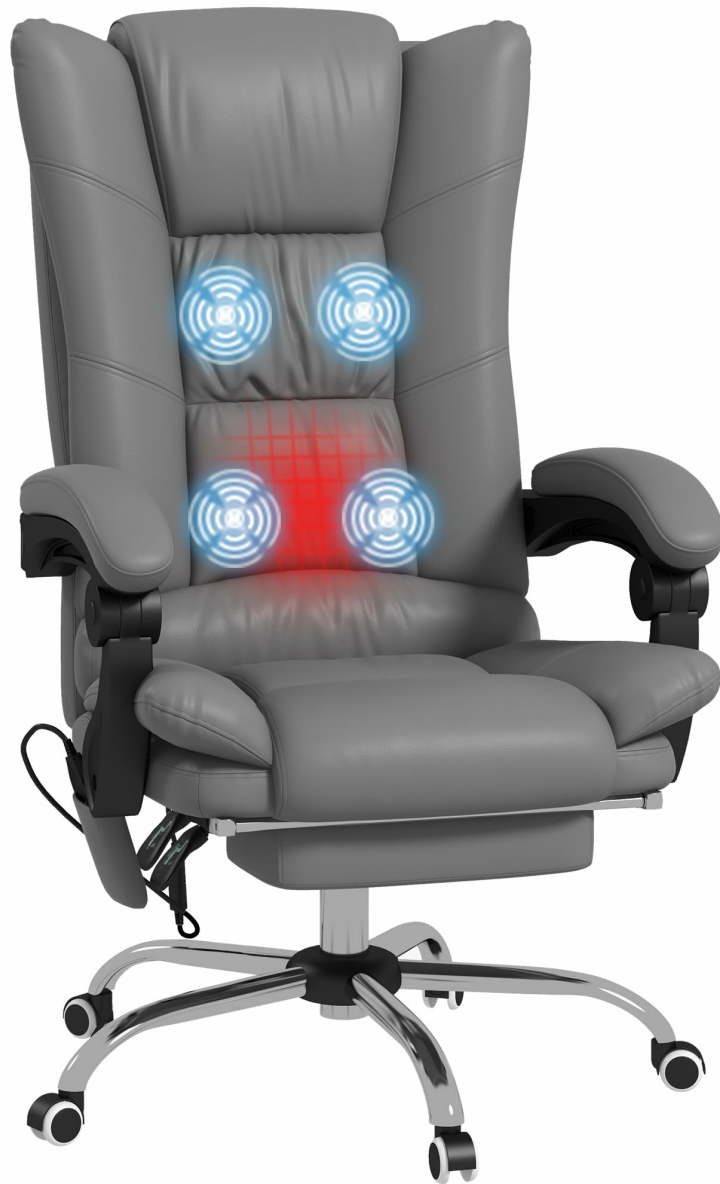
Image: The Vinsetto Executive Massage Office Chair in Grey, positioned in an office environment.