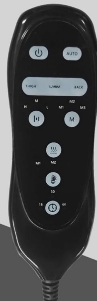
Image: Overview of the vibration massage points and the remote control for activating massage and heat.