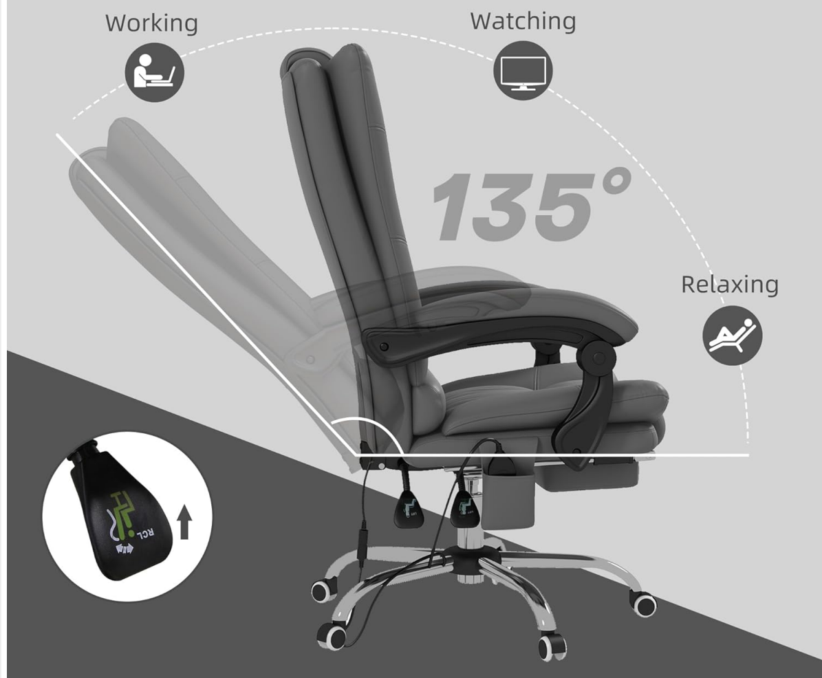
Image: Visual guide to the chair's reclining capabilities, from upright to a 135-degree recline.