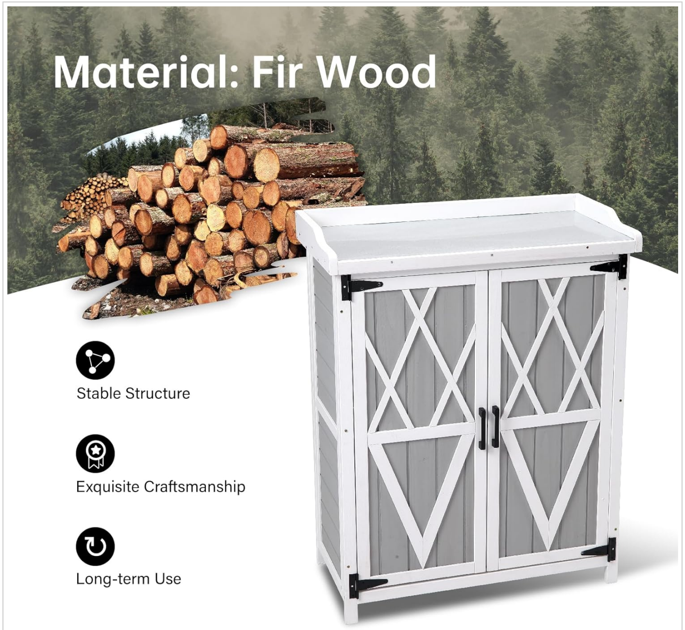
Image: Graphic illustrating the primary material as Fir Wood, emphasizing its stable structure, exquisite craftsmanship, and suitability for long-term outdoor use.