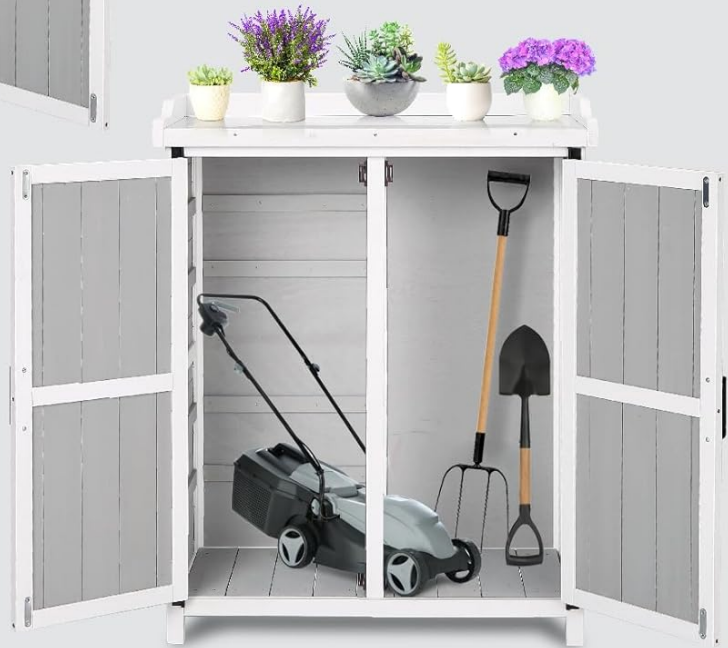
Image: Two views of the potting bench cabinet. One shows the interior with shelves installed, organizing small objects like boots and gardening tools. The other shows the interior with shelves removed, allowing for storage of large items such as a small lawnmower.