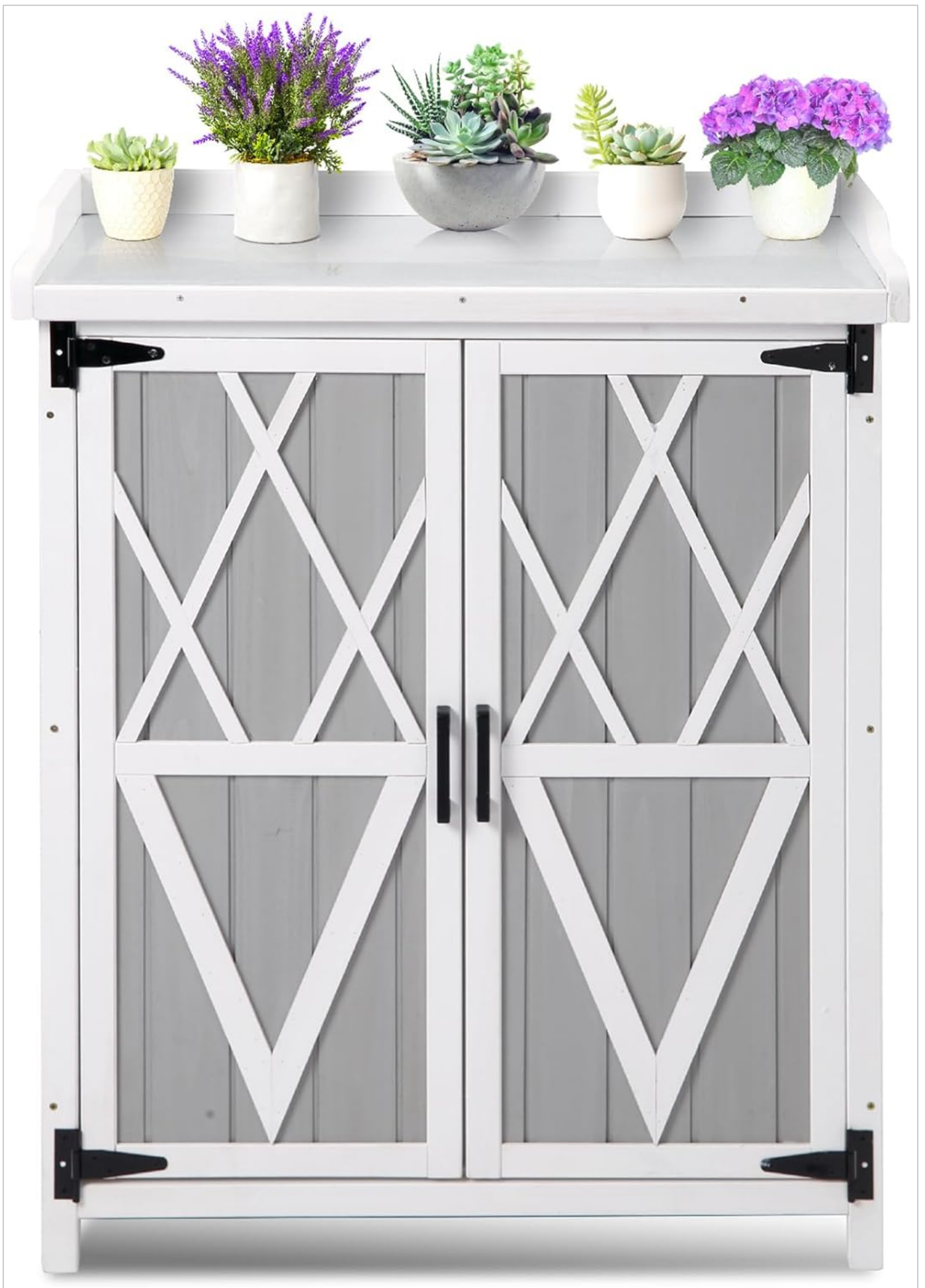
Image: Front view of the GarveeLife Potting Bench Outdoor Cabinet, featuring a white wooden frame, gray doors with decorative cross patterns, and several potted plants on its metal tabletop.