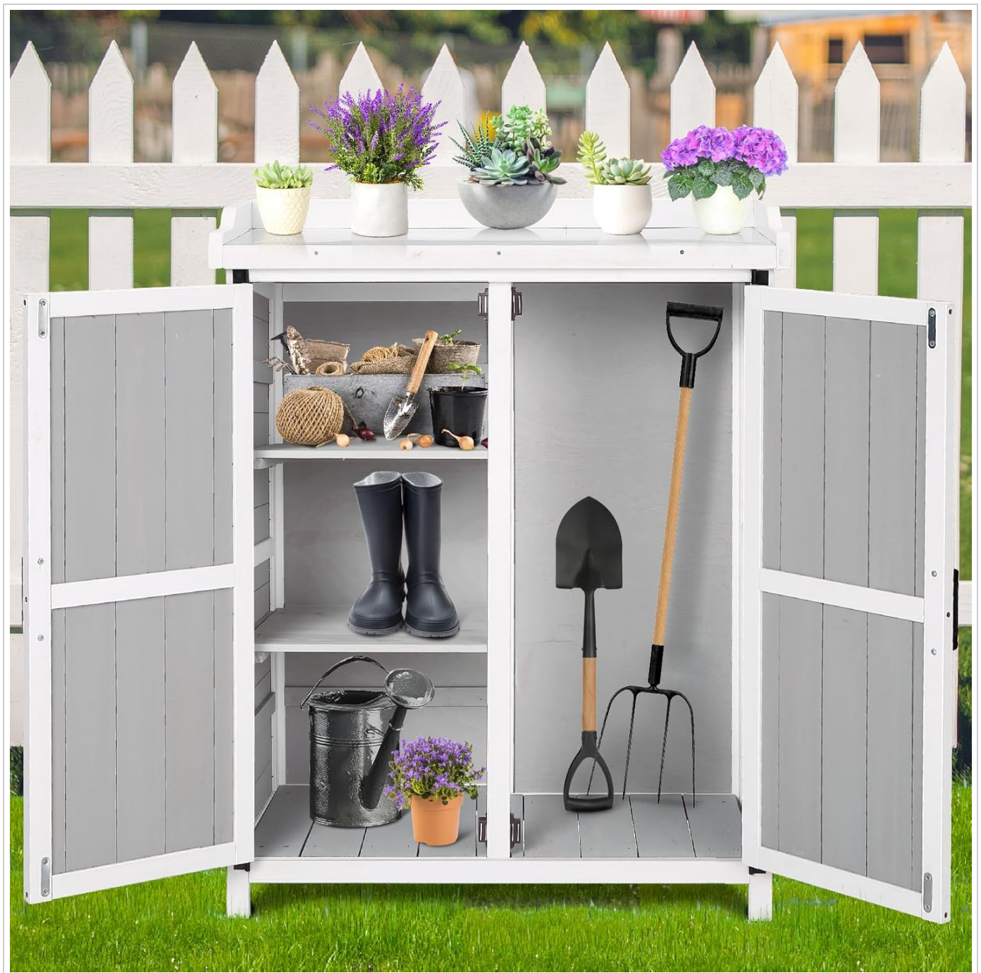
Image: The GarveeLife Potting Bench with its doors open, showcasing various gardening tools and supplies neatly stored on its shelves and floor, set against a white picket fence background.