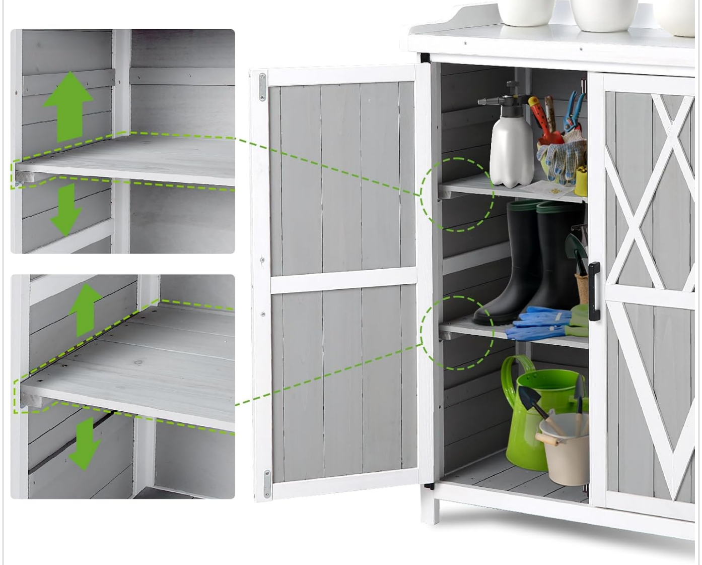
Image: Illustration demonstrating the flexible shelf adjustment feature, with arrows indicating how the shelf height can be moved up or down to accommodate different item sizes.

The installation height of the shelf can be adjusted freely