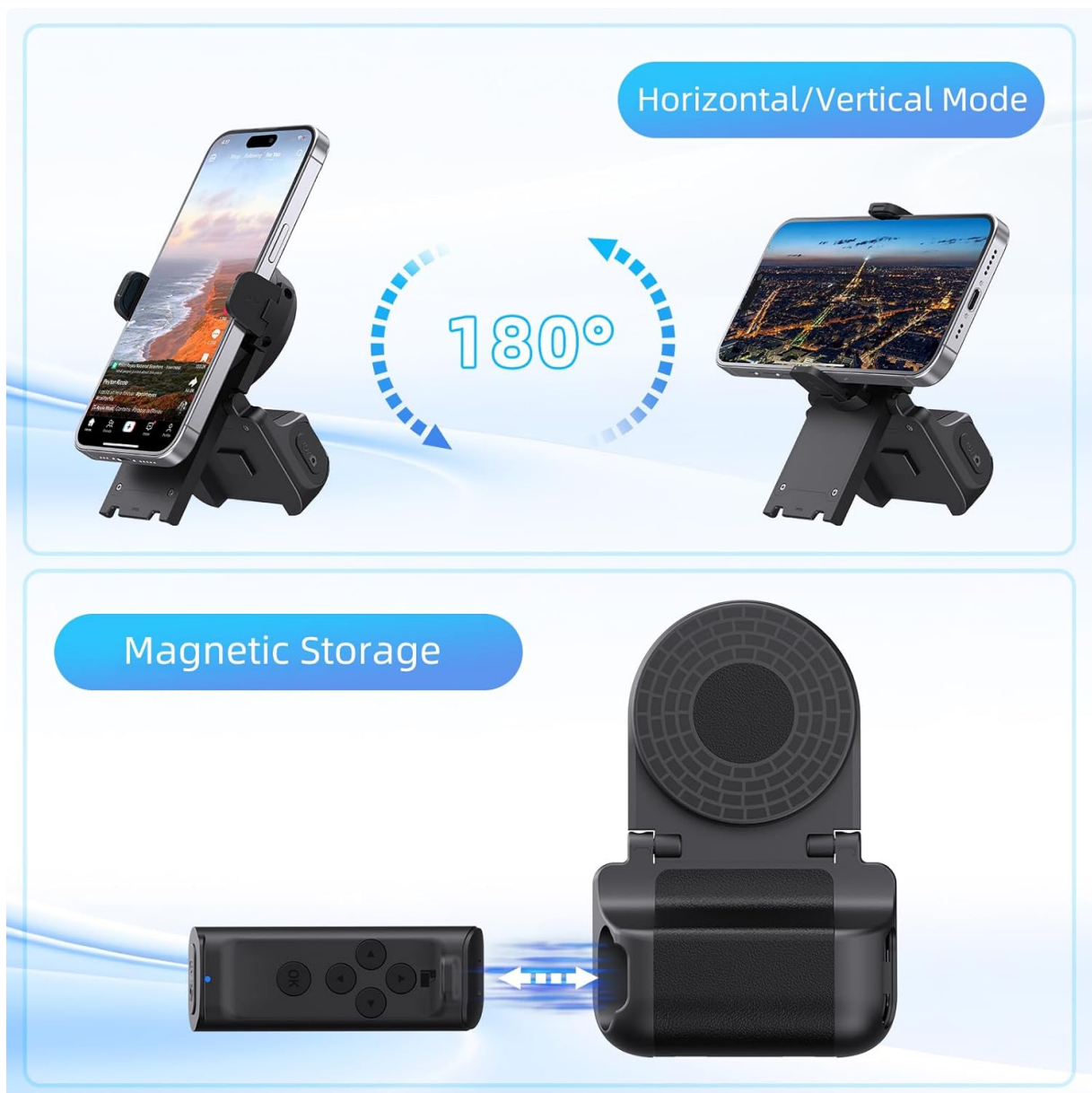
Image: The phone stand's 180-degree rotation for horizontal/vertical viewing and the magnetic storage feature for the remote.