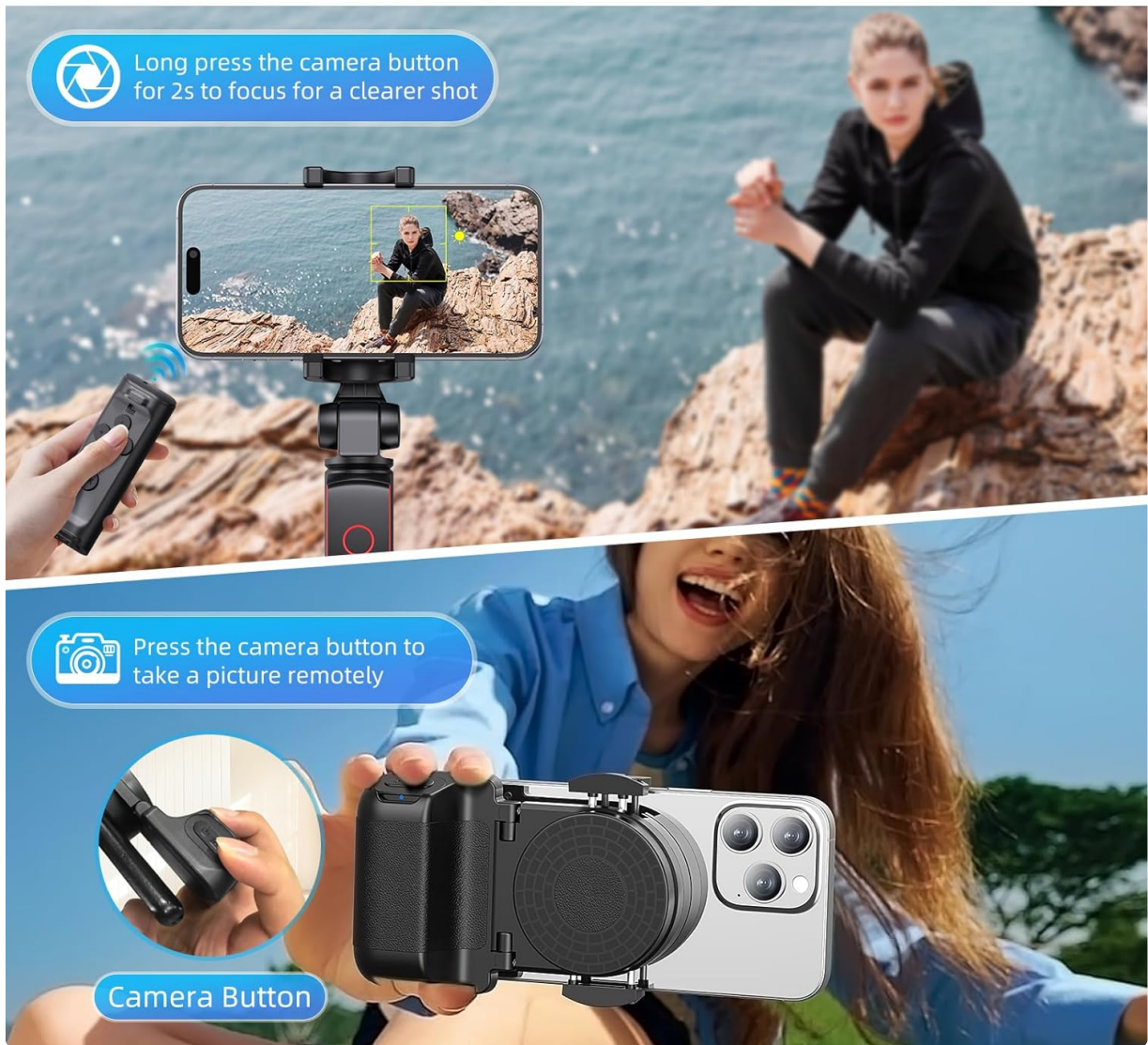
Image: Remote control functionality for taking photos and videos, including focusing for clearer shots.