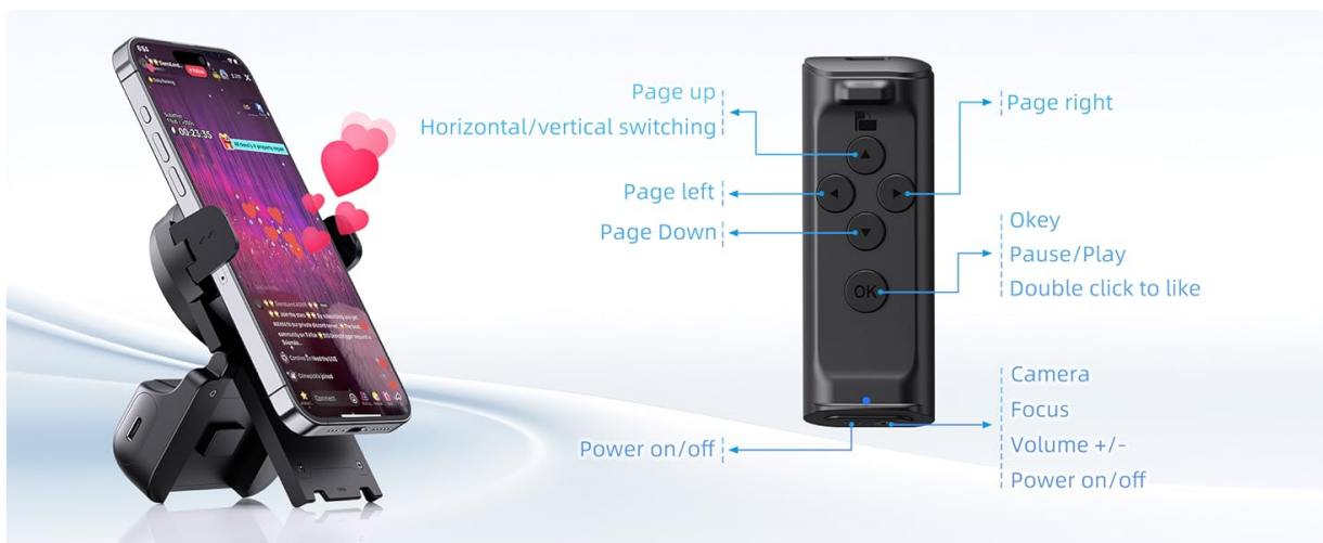
Image: Demonstrating the remote control's use for scrolling through e-books on a tablet.

Image: MILOUZ TK-Pro remote control used as an e-book page turner for various devices, highlighting incompatibility with Kindle devices.