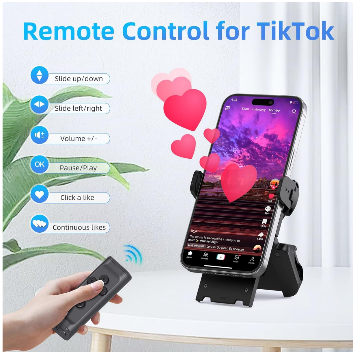
Image: Remote control functions for TikTok, including slide up/down, left/right, volume, pause/play, and liking.

pause/play or like videos. The remote allows for hands-free viewing and interaction.