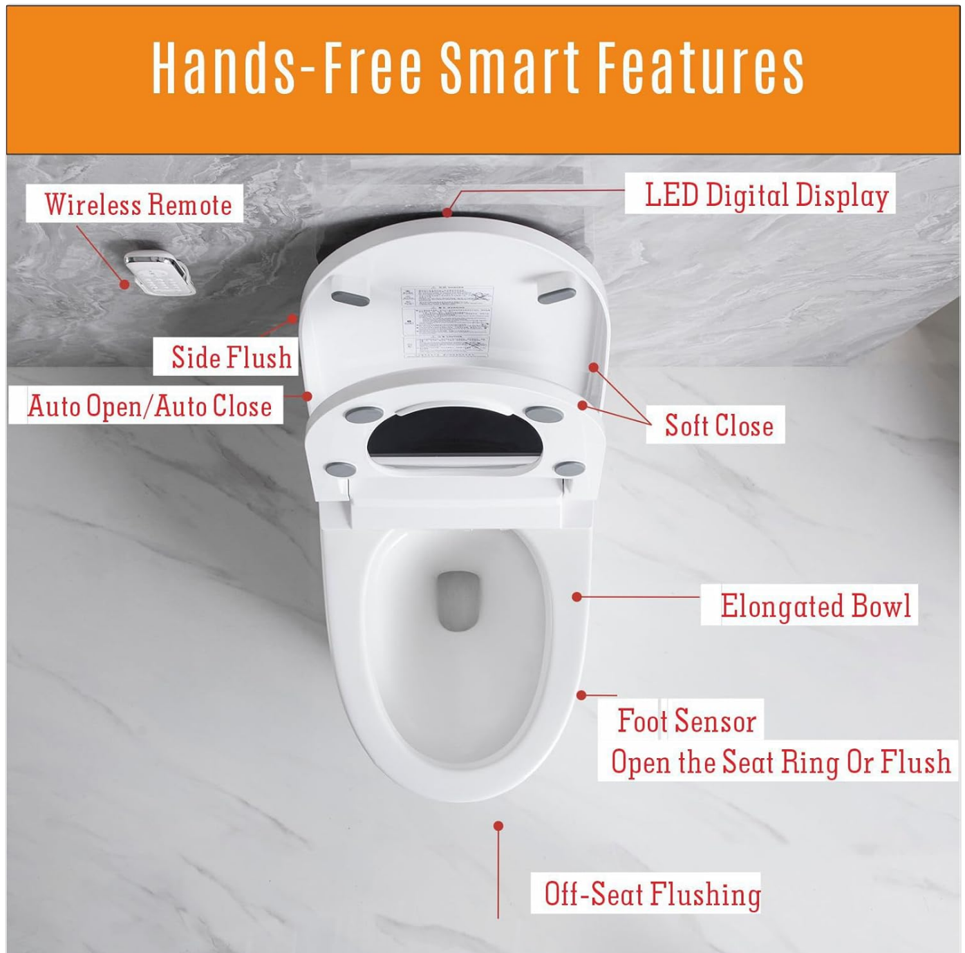
Image: Overview of hands-free smart features including remote, foot sensor, and auto-flush.