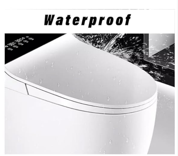
Image: Details on heated seat, instant warm water, and warm air dryer functionalities.

Your browser does not support the video tag.