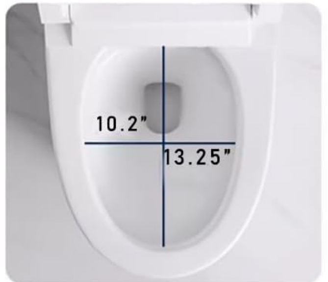
Image: Product dimensions and rough-in measurements for installation planning.

Your browser does not support the video tag.