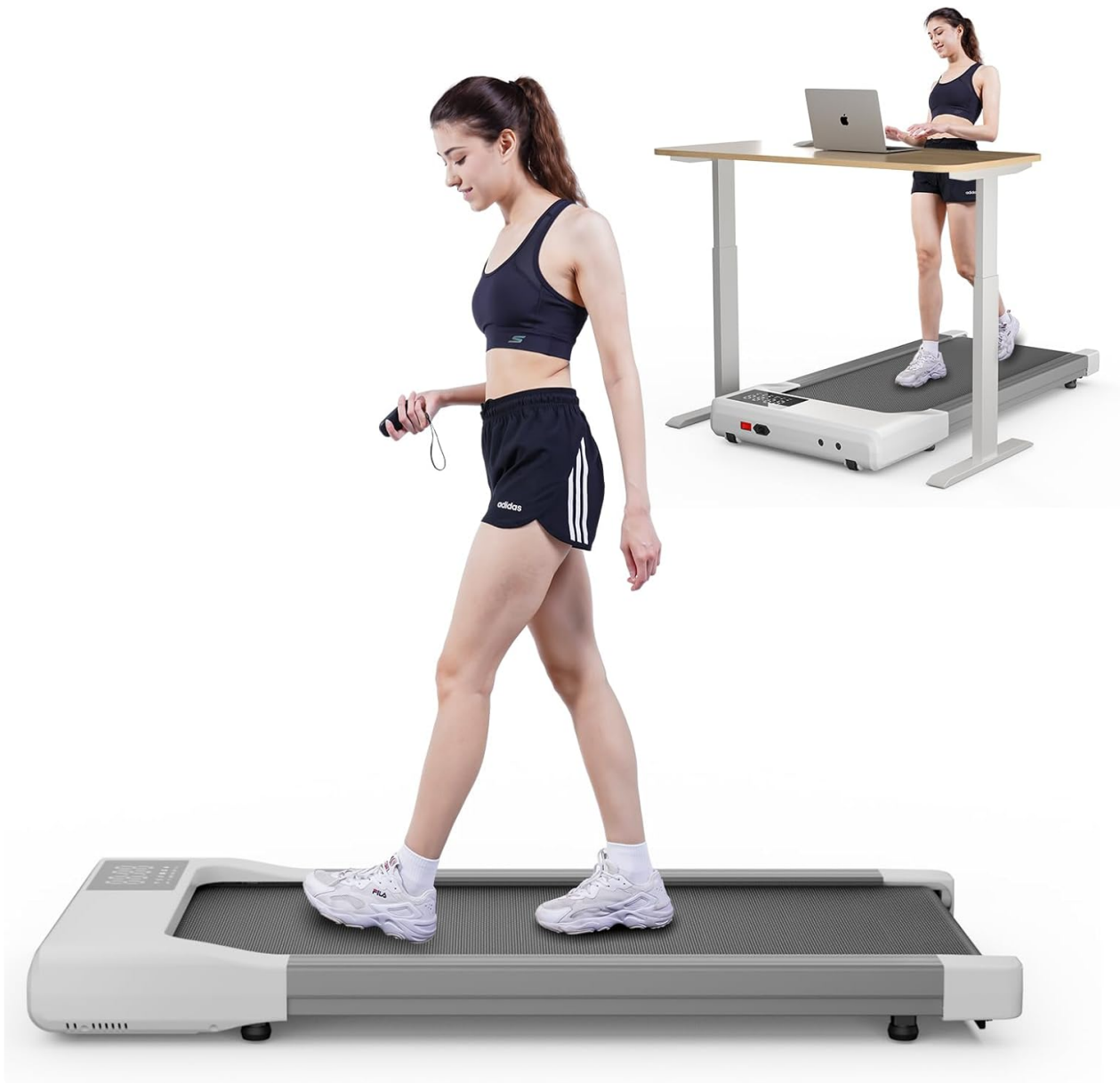
Image: The DeerRun Raceable Walking Pad shown in use, both as a standalone unit and integrated with a standing desk. This illustrates its compact design and versatility for various home environments.