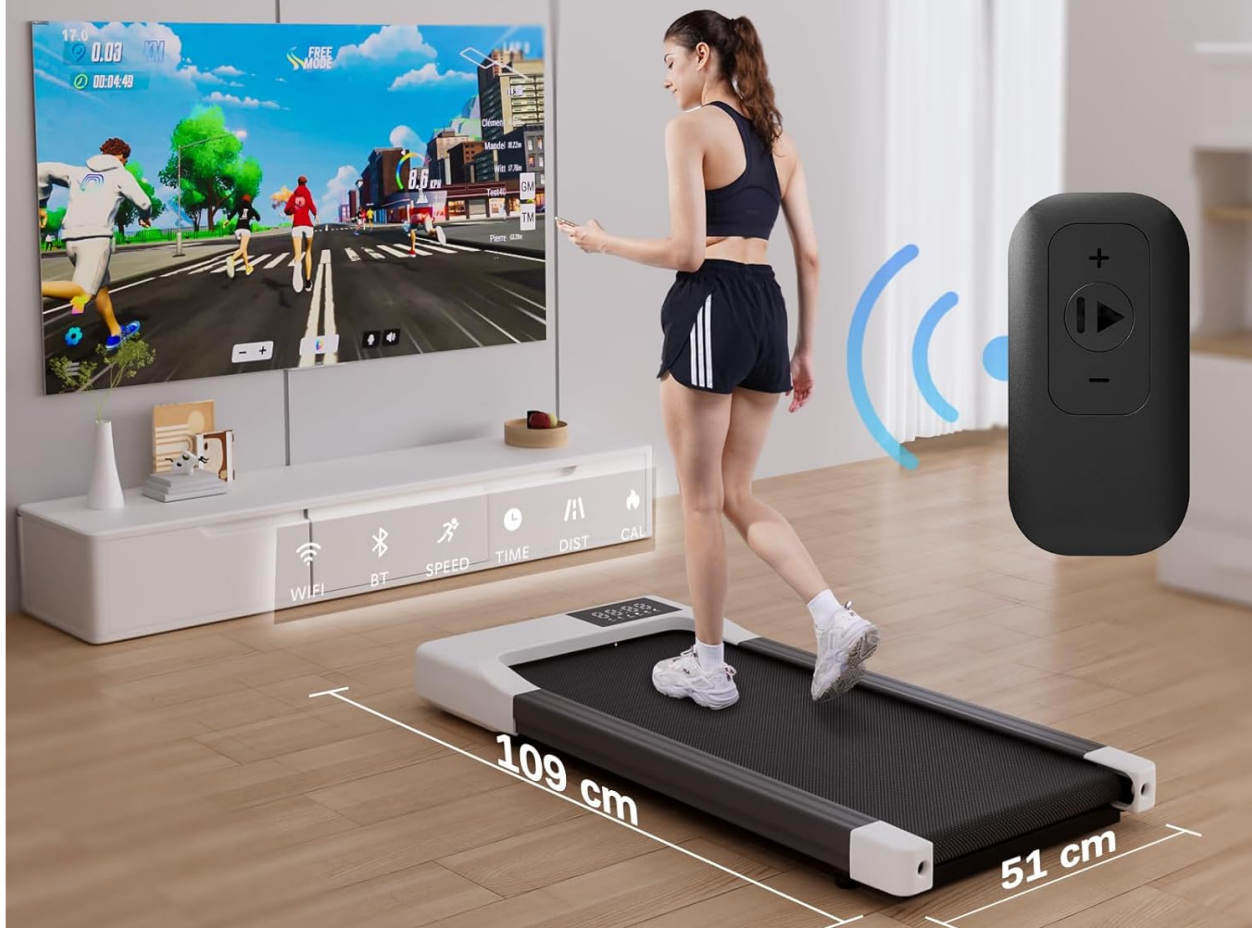
Image: A close-up of the walking pad's LED display, showing Wi-Fi, Bluetooth, speed, time, distance, and calorie indicators. The remote control with speed adjustment buttons is also visible.

Libérez votre potentiel de remise en forme avec un écran LED avancé et une télécommande pour un suivi transparent des données d'entraînement.