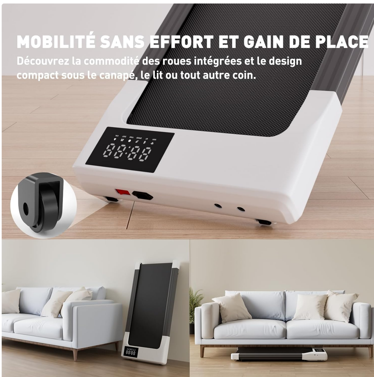
Image: The walking pad demonstrating its space-saving design, shown being slid under a sofa and stored upright against a wall, highlighting its portability and compact footprint.

The DeerRun Raceable Walking Pad is designed for easy storage. It can be folded or tilted and moved using its integrated wheels. Store it in a dry, safe place away from direct sunlight and extreme temperatures.