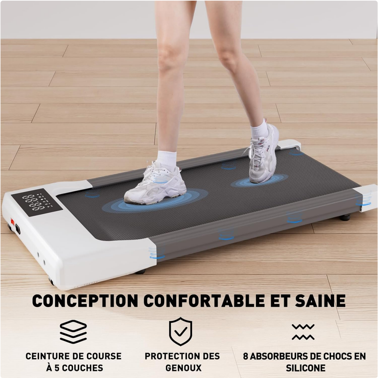
Image: An illustration highlighting the comfortable and healthy design of the walking pad, featuring a 5-layer running belt and 8 silicone shock absorbers for knee and ankle protection.

If the running belt becomes misaligned or too loose/tight, it may need adjustment. Consult the detailed instructions in the full product manual or contact customer support for guidance. Incorrect adjustment can damage the belt or motor.