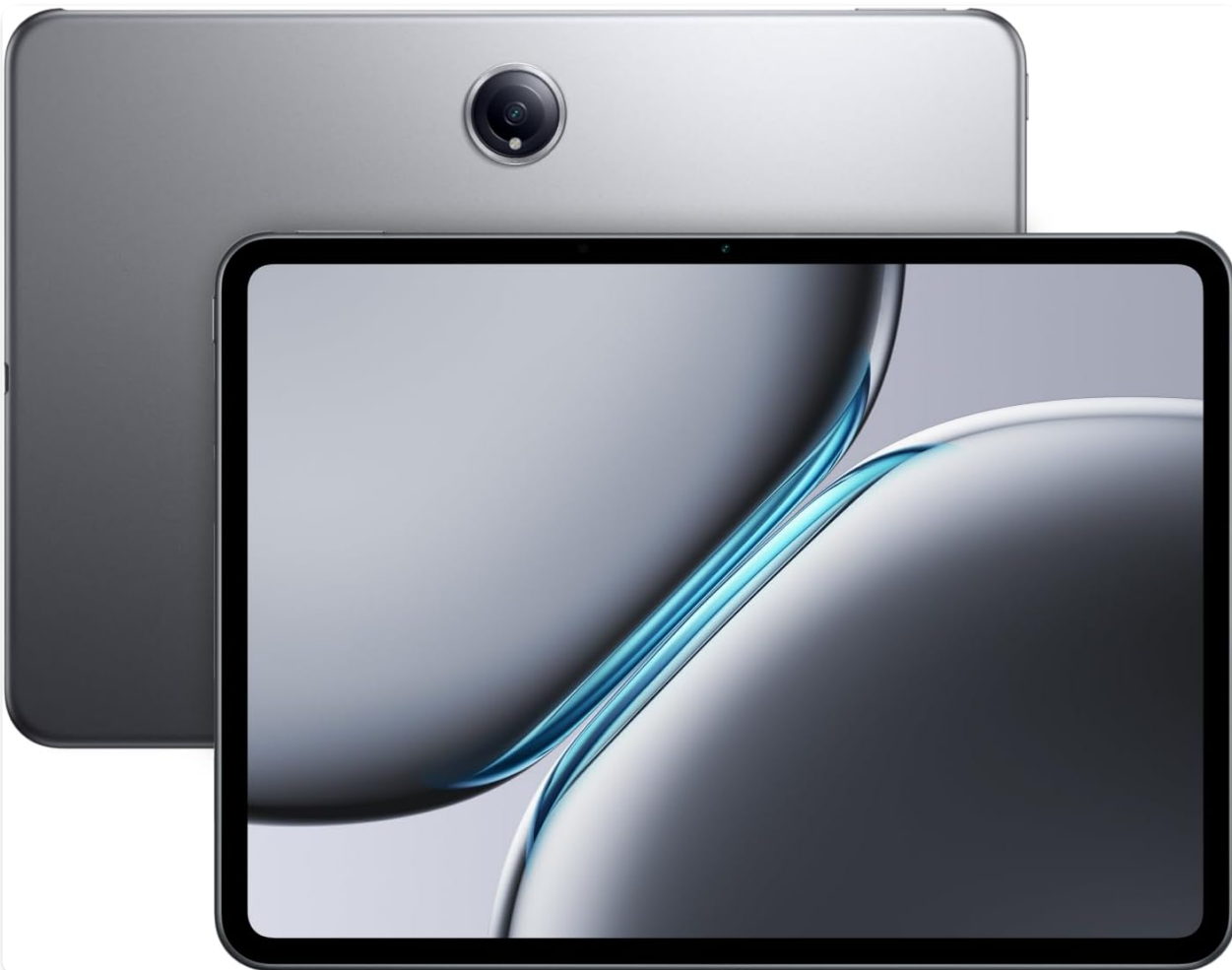
The OnePlus Pad 2, showcasing its sleek design and rear camera module.

The OnePlus Pad 2 is a high-performance Android tablet designed for both productivity and entertainment. Powered by the Snapdragon 8 Gen 3 SoC and Qualcomm Adreno GPU, it offers exceptional speed and efficiency. Featuring a large 12.1-inch display, advanced audio capabilities, and a suite of AI-enhanced features, the OnePlus Pad 2 is built to deliver a smooth and immersive user experience.