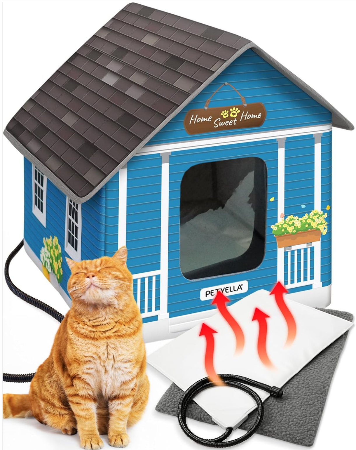
Image: The PETYELLA Deluxe Heated Cat House, illustrating its design and the heating pad's function, with a cat enjoying the warmth.

The clear removable door flaps help to retain heat and block drafts during colder months. In warmer weather, these flaps can be removed to improve airflow and allow for an all-season shelter.