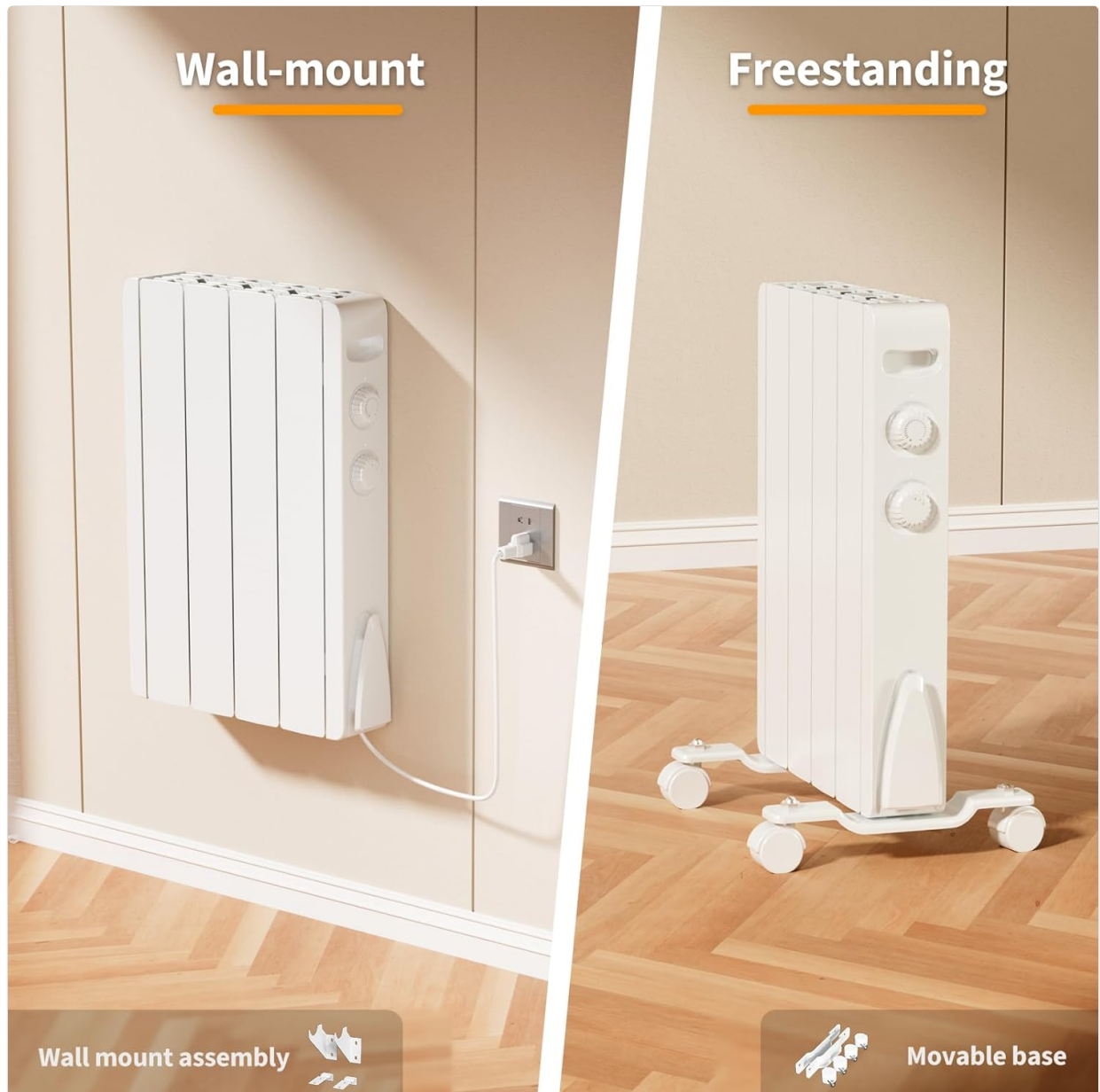
Image: The Fierscial 800W Electric Panel Wall Heater demonstrating its dual mounting options: wall-mount assembly and freestanding with universal wheels.