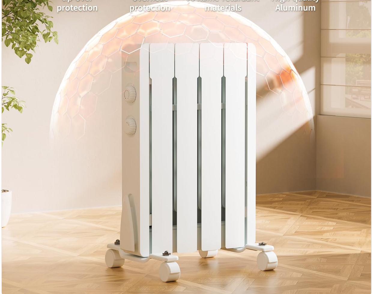
Image: The Fierscial 800W Electric Panel Wall Heater emphasizing its safety features, including tip-over protection, overheat protection, V0 flame-retardant materials, and high-quality aluminum construction.