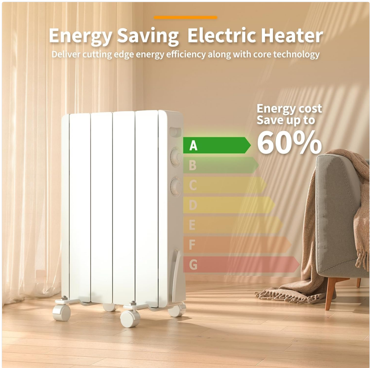
Image: The Fierscial 800W Electric Panel Wall Heater highlighting its energy-saving capabilities, with an energy cost saving up to 60%.