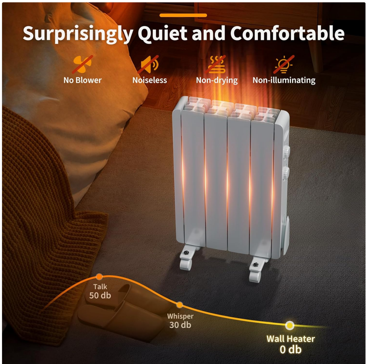
Image: The Fierscial 800W Electric Panel Wall Heater in a bedroom, illustrating its quiet and comfortable operation with no blower, noiseless, non-drying, and non-illuminating features.