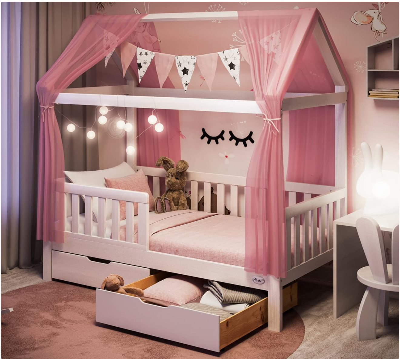
Image 1: Assembled Alcube HEIM Children's Bed with canopy and decorative elements.