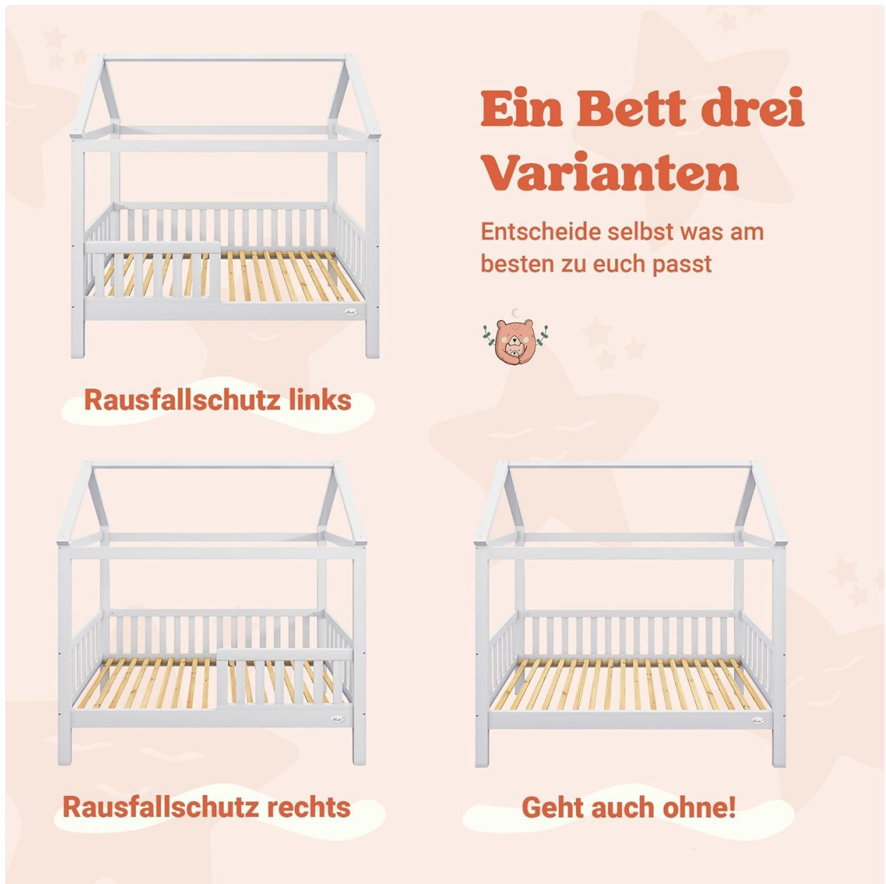
Image 4: Options for fall protection placement (left, right, or none).