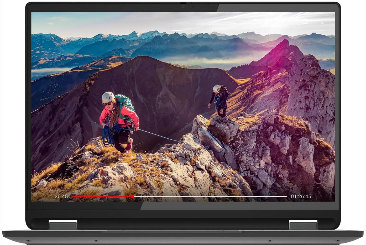
Figure 5: High-resolution display for media consumption

Click, zoom, and drag more intuitively with the touchscreen, while the backlit keyboard keeps you on track when the room is dark.