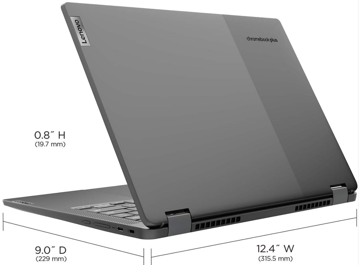
Figure 9: Product Dimensions