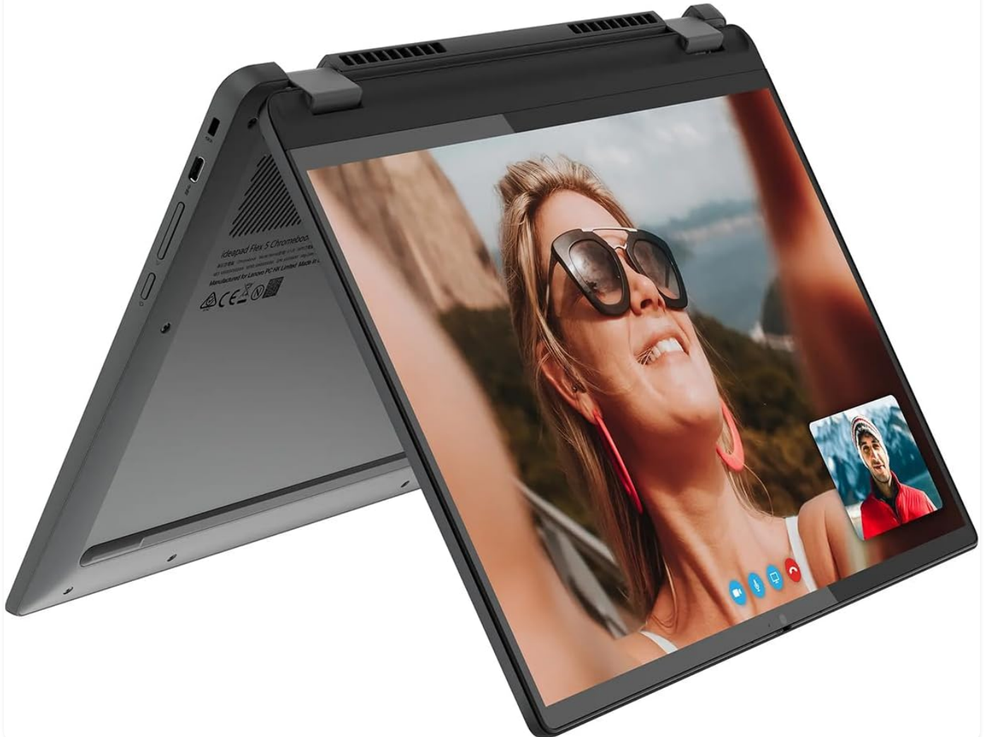
Figure 4: Chromebook in Tent Mode