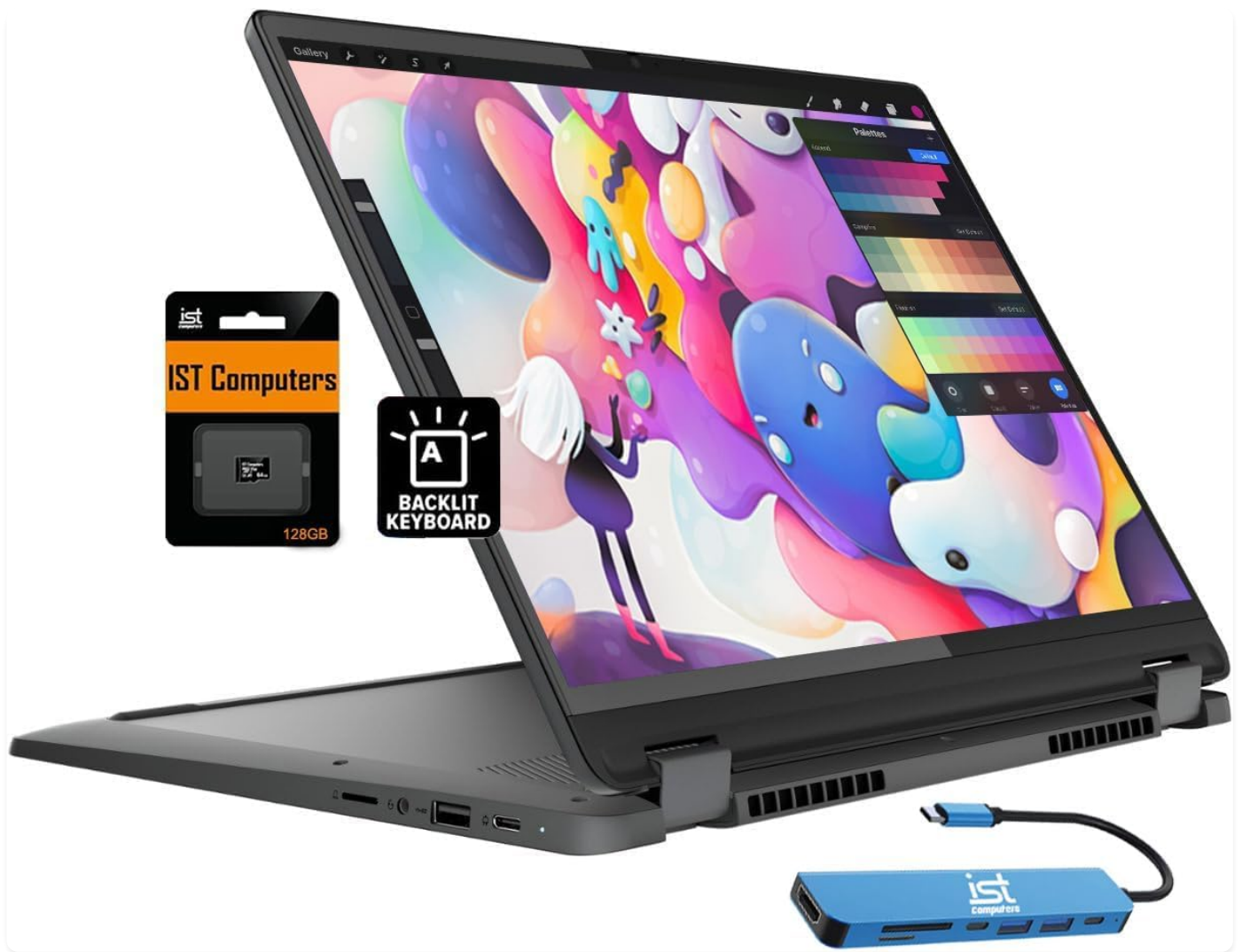
Figure 1: Lenovo IdeaPad Flex 5i Chromebook Plus