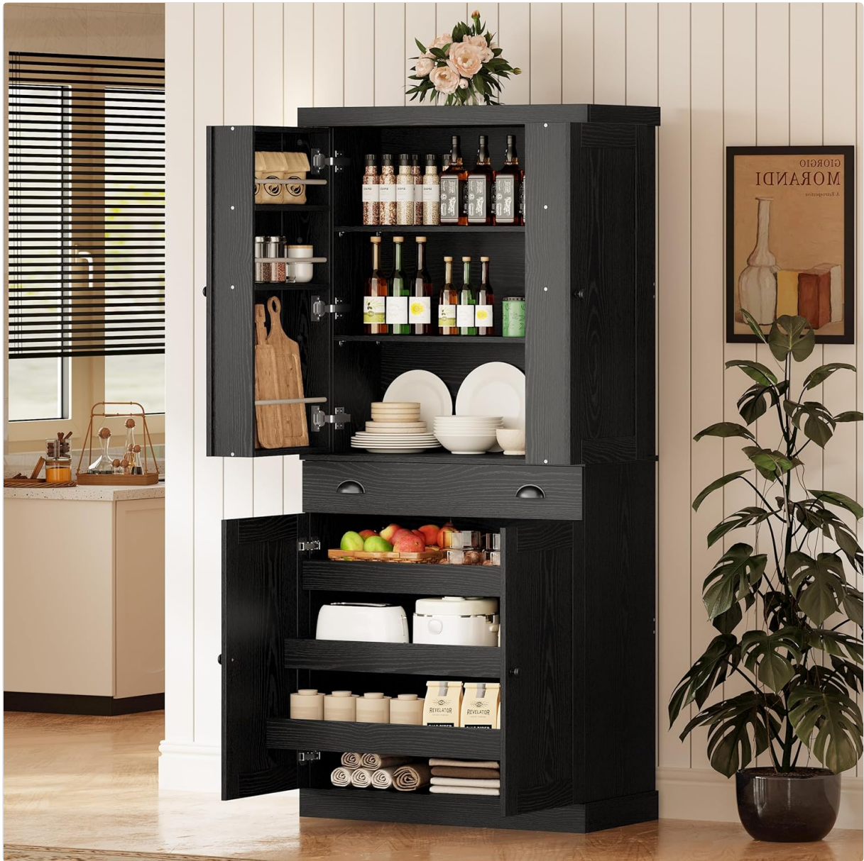
Figure 5: The sliding storage racks provide easy access to contents.