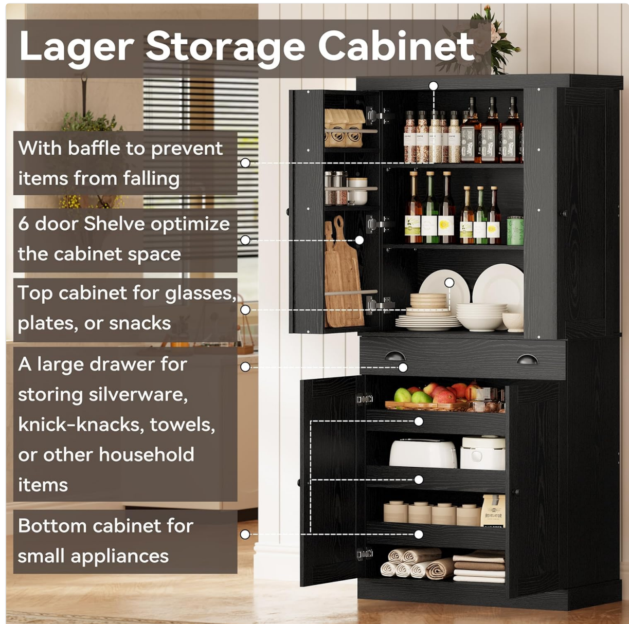
Figure 3: Overview of the cabinet's storage capabilities.