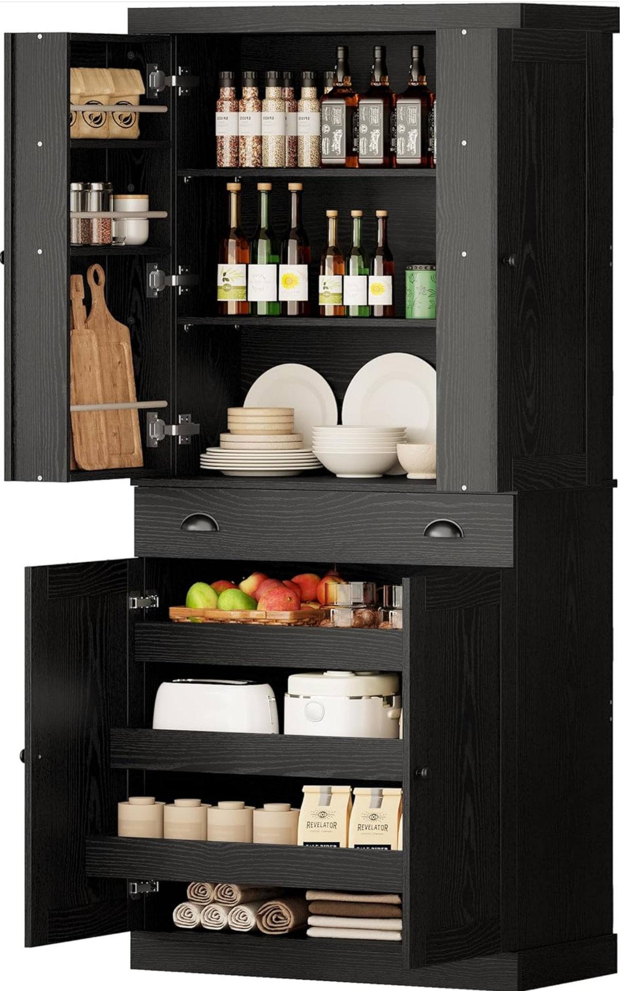
Figure 2: The IRONCK Kitchen Pantry Cabinet, illustrating its various storage compartments.