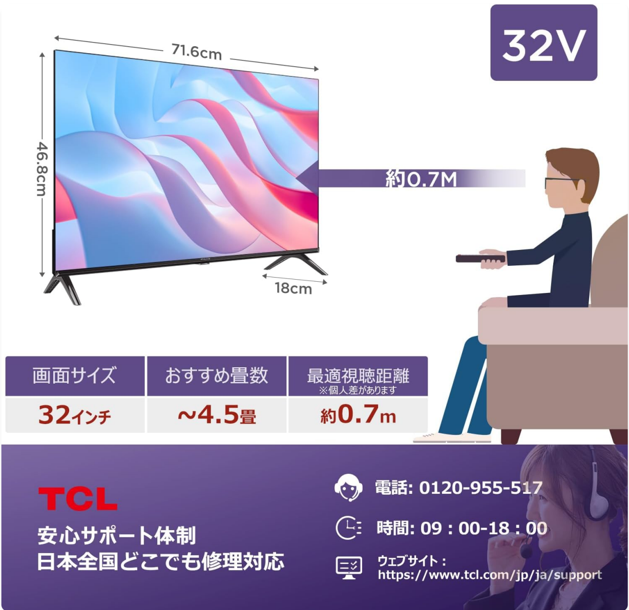
Image: iFFALCON 32-inch TV with dimensions (71.6cm width, 46.8cm height, 18cm depth) and a diagram showing a recommended viewing distance of approximately 0.7 meters for a 32-inch screen in a 4.5 tatami mat room.

Carefully remove the TV from its packaging. Place the TV on a stable surface or mount it on a VESA-compatible wall mount. Ensure adequate ventilation around the TV.