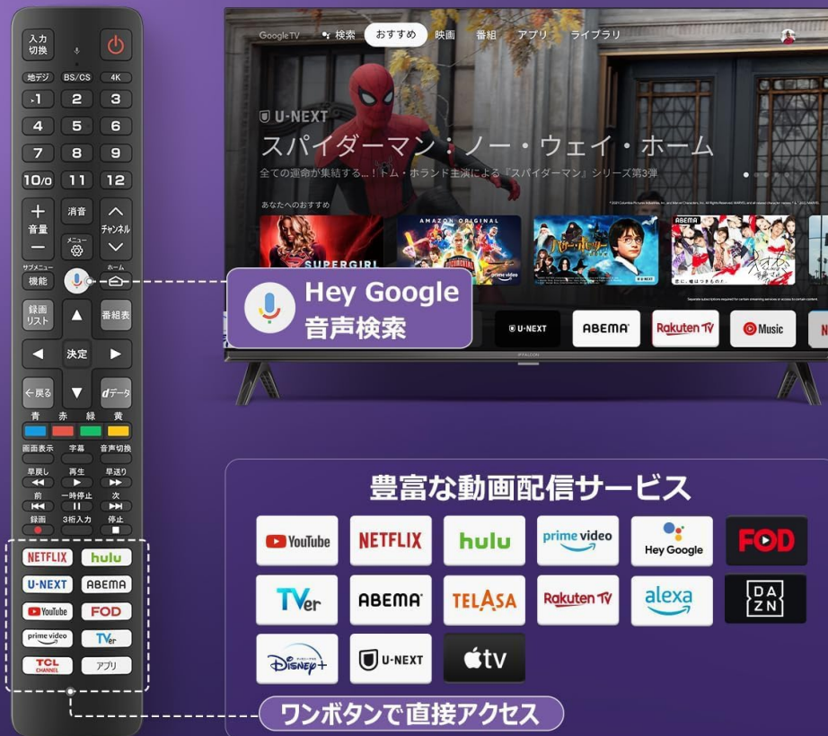
Image: The Google TV interface displaying popular streaming services like YouTube, Amazon Prime Video, Netflix, Hulu, Disney+, Apple TV+, and U-NEXT, along with content recommendations.