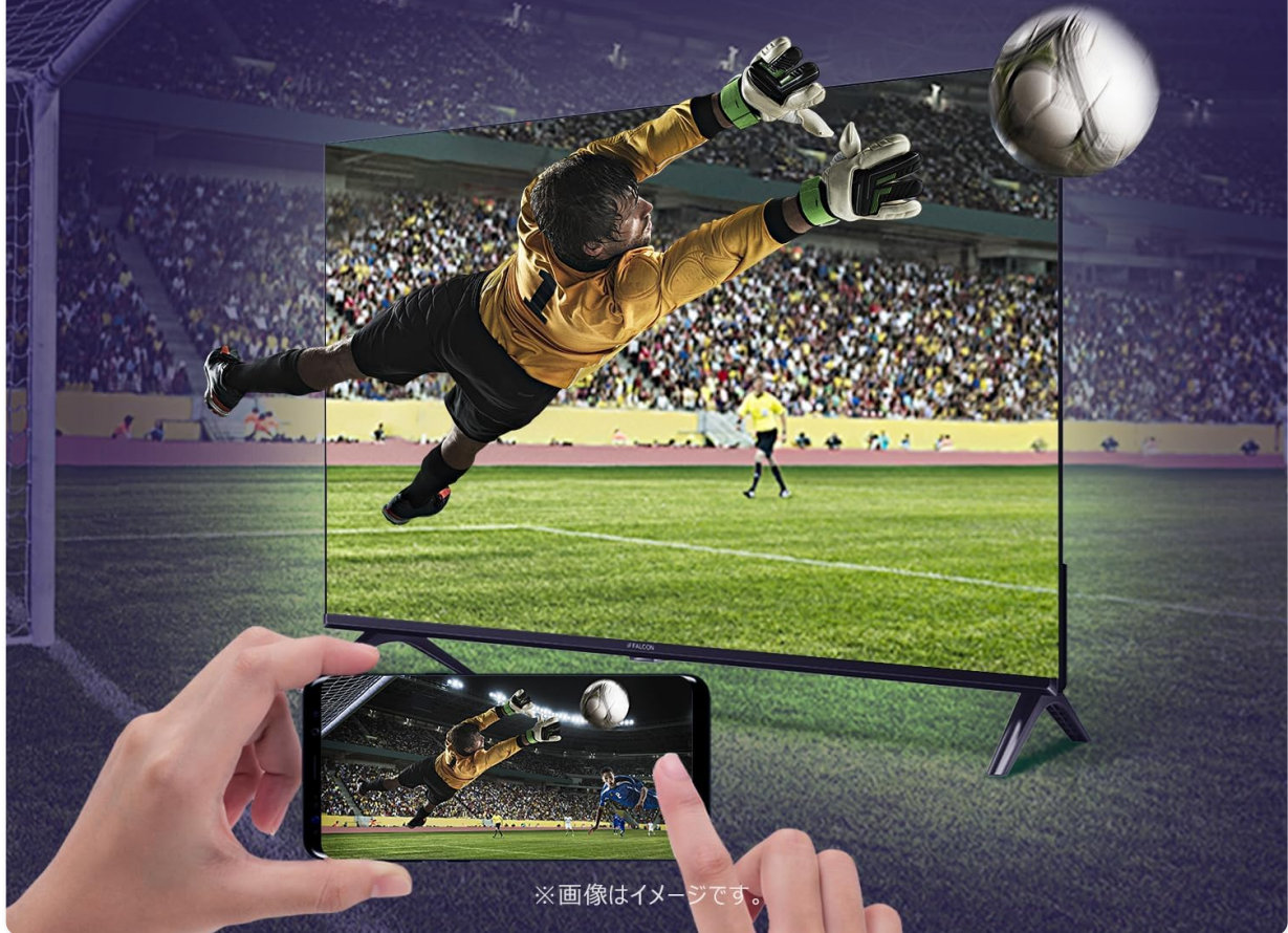
Image: A visual representation of the Chromecast built-in feature, where content from a smartphone, such as a soccer game, is being displayed on the iFFALCON TV.

クロームキャスト搭載でスマートフォンで見ている映像やゲームなどを テレビの大画面でお気軽に楽しめます。