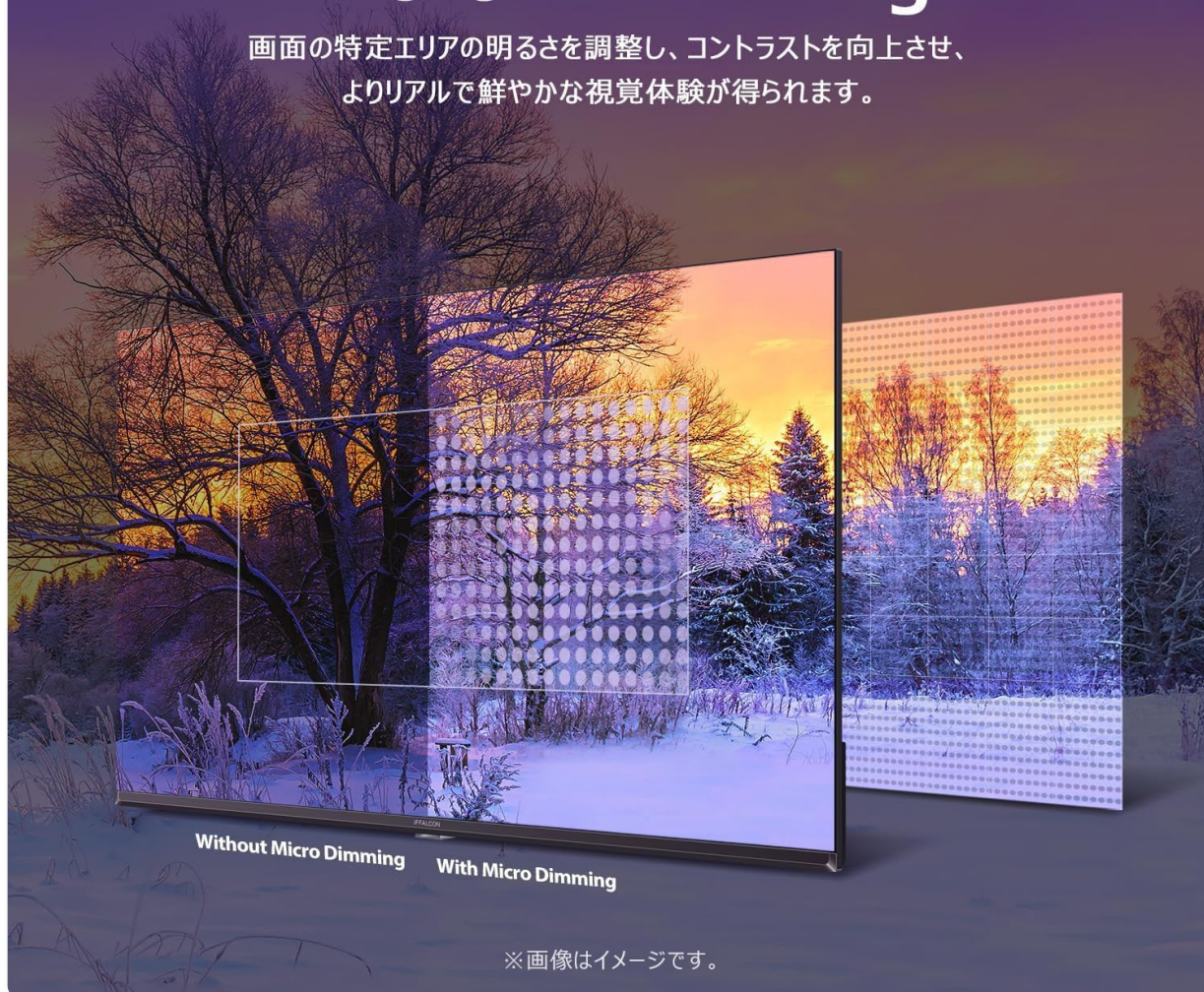
Image: An illustration of Micro Dimming technology, showing how it adjusts brightness in specific areas of the screen to improve contrast and create a more vivid visual experience.

画面の特定エリアの明るさを調整し、コントラストを向上させ、 よりリアルで鮮やかな視覚体験が得られます。