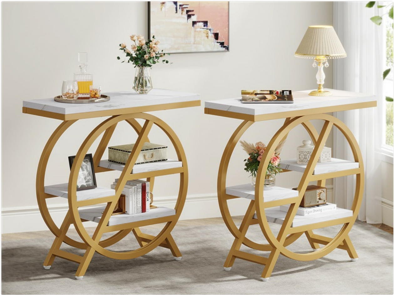
Image 4: Key features of the table, including storage, frame, and adjustable footpads.