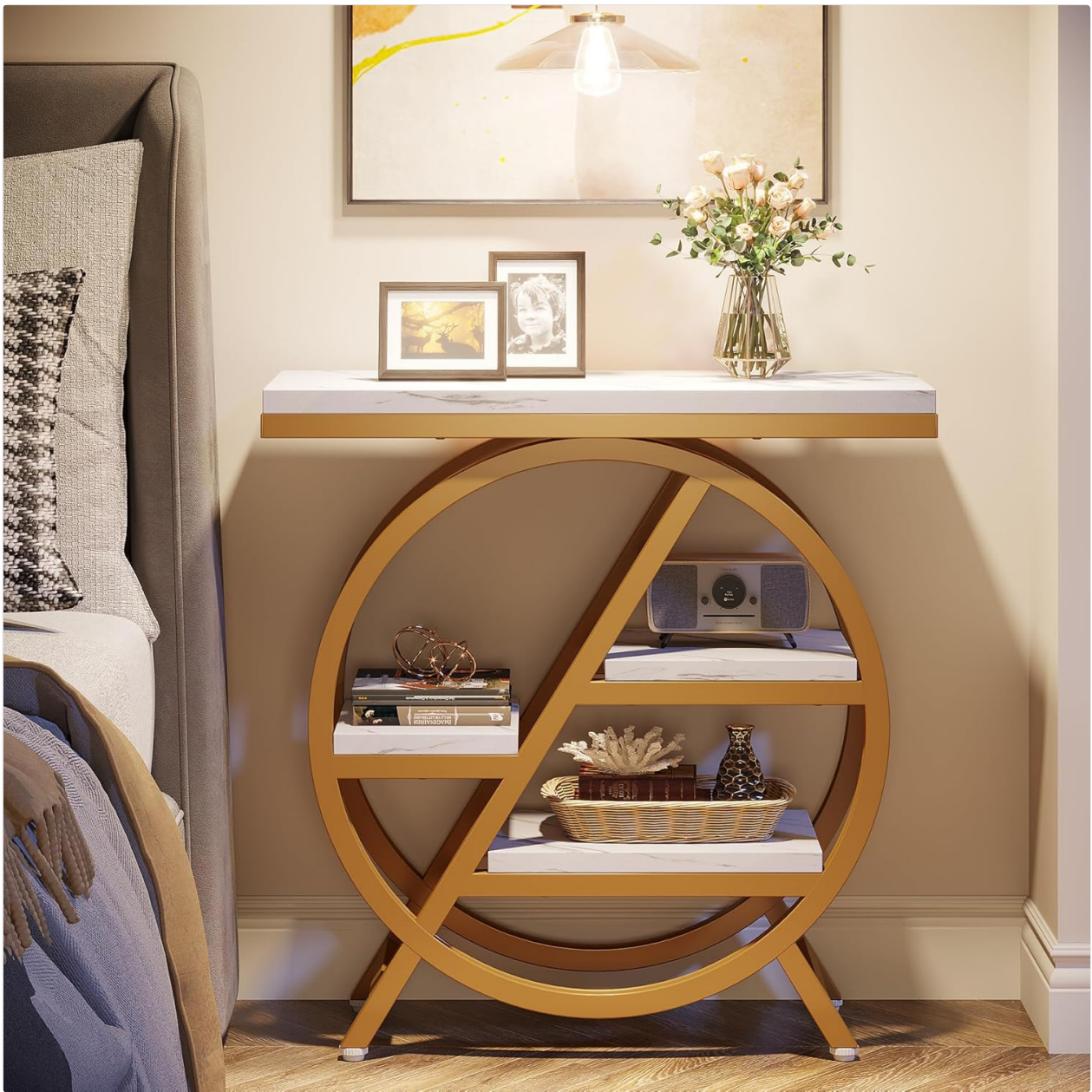
Image 2: The Tribesigns 3-Tier Faux Marble Side Table serving as a nightstand in a bedroom, highlighting its storage capabilities.