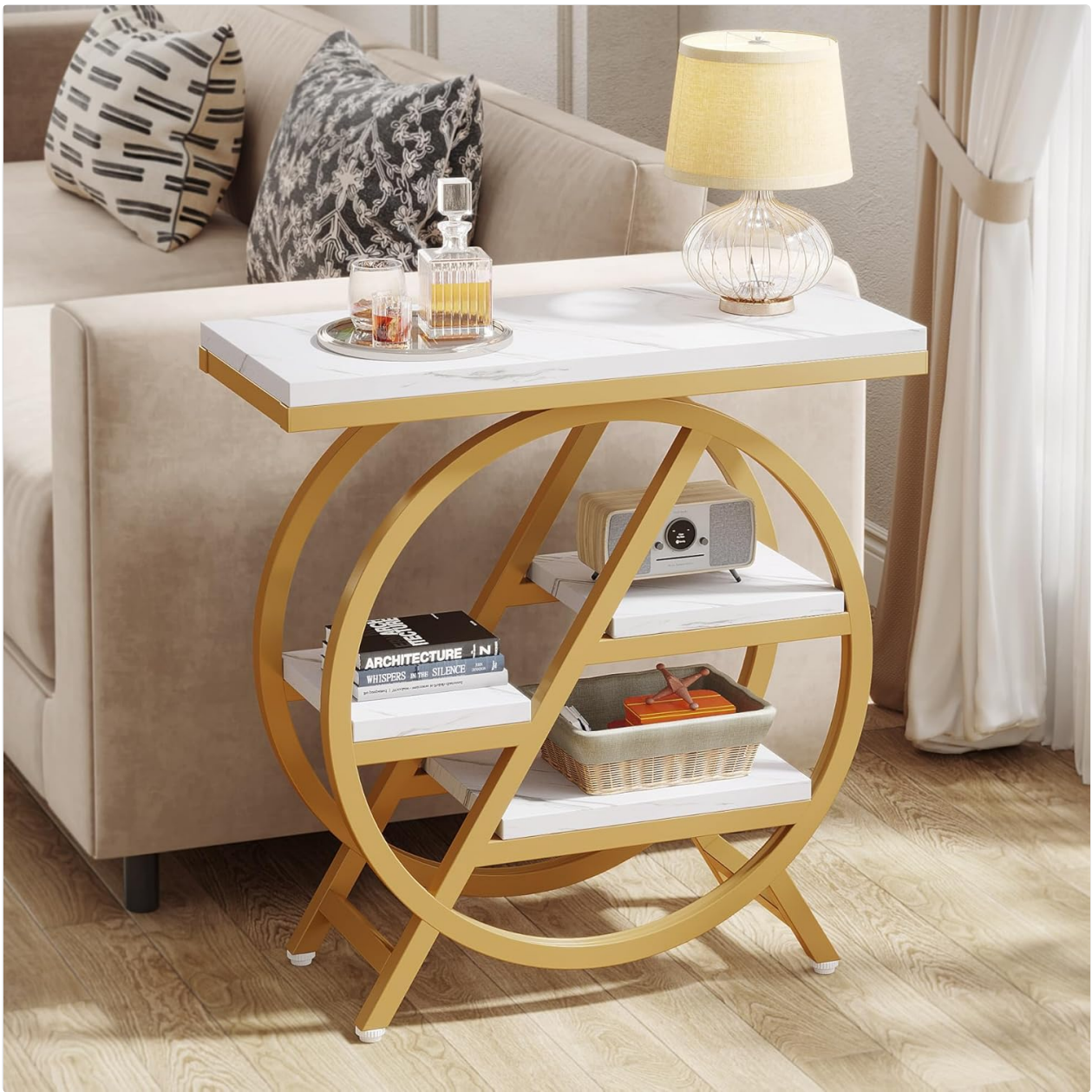
Image 1: The Tribesigns 3-Tier Faux Marble Side Table positioned in a living room, showcasing its use as a sofa end table.