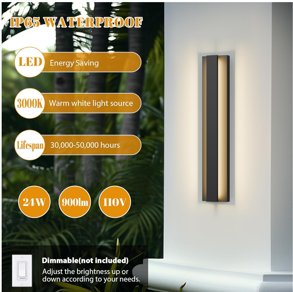
Image: Overview of the LamQee LED Outdoor Wall Light highlighting its IP65 waterproof rating, LED energy saving, 3000K warm white light, 30,000-50,000 hours lifespan, 24W, 900lm, 110V, and dimmer compatibility.