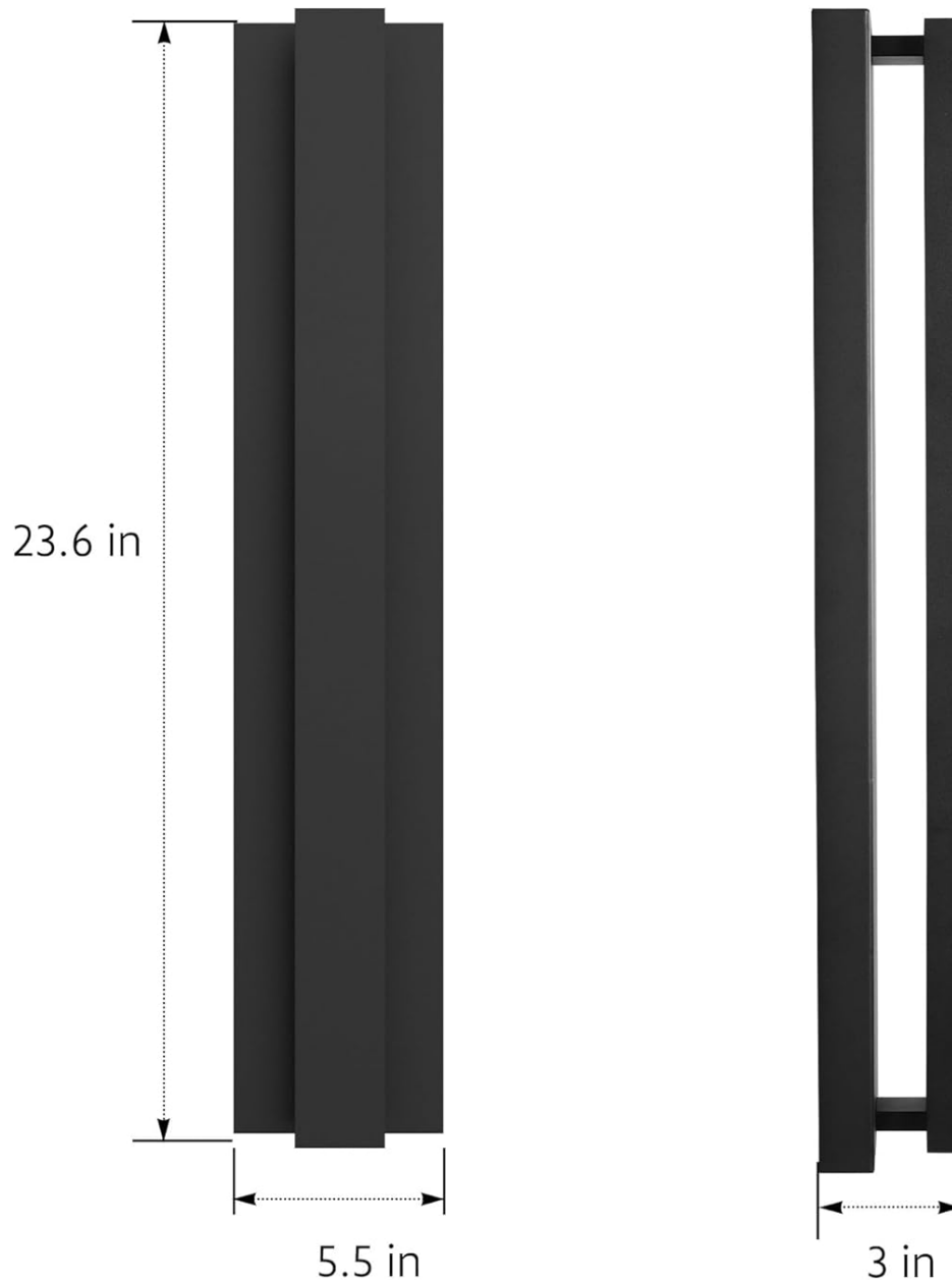
Image: Technical drawing showing the dimensions of the 23.6-inch wall light: 23.6 inches in height, 5.5 inches in width, and 3 inches in depth.