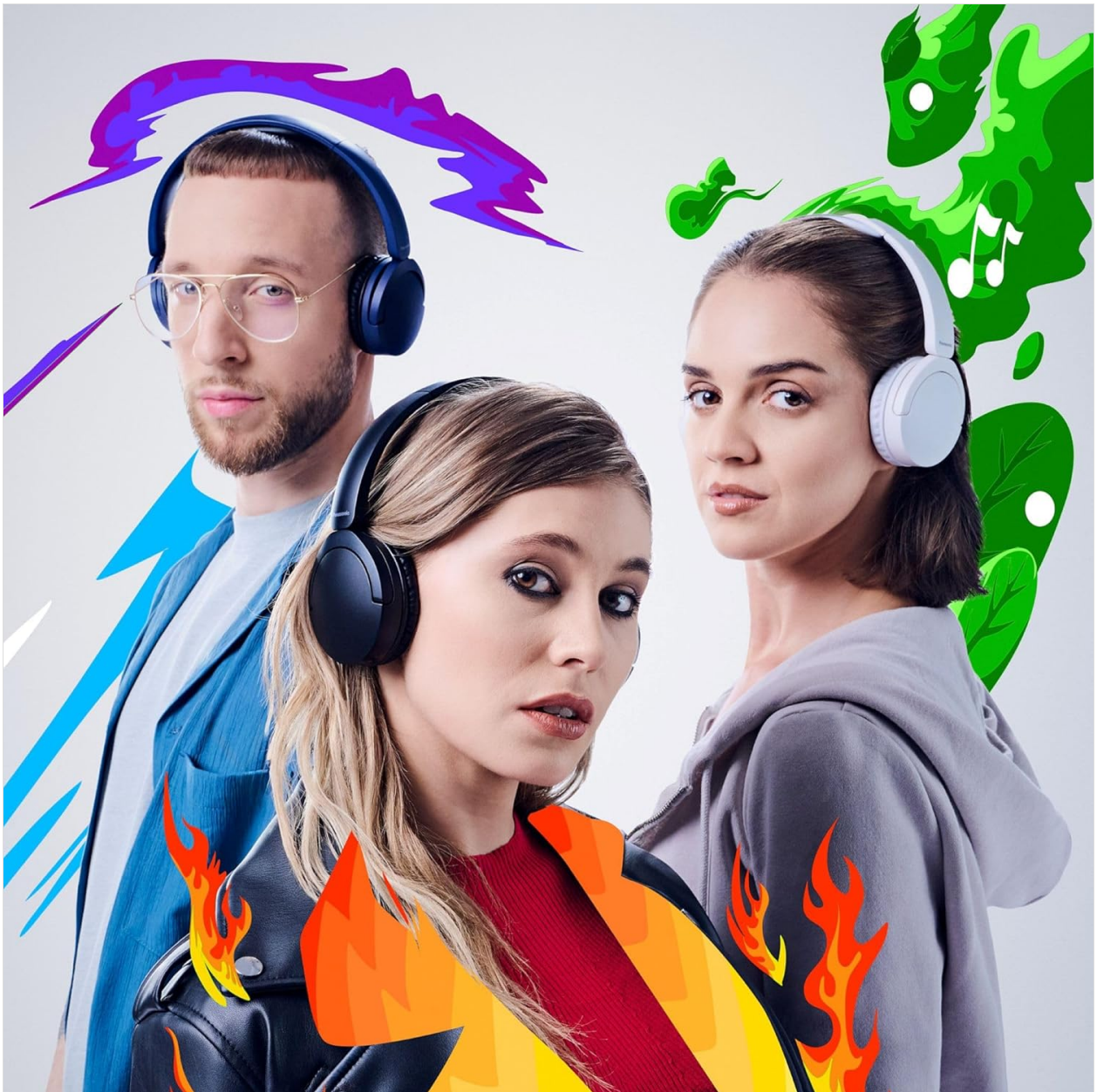
Figure 6.1: The integrated Environmental Noise Cancellation (ENC) microphone ensures clear communication during calls.

To activate your device's voice assistant (e.g., Siri, Google Assistant), press the MFB twice quickly.