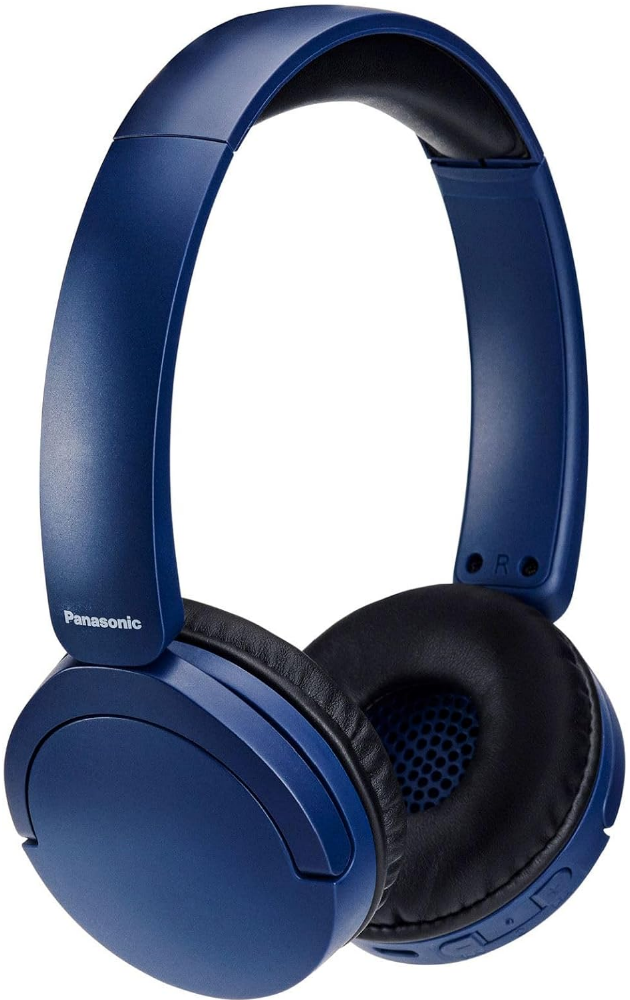
Figure 4.1: Front view of the Panasonic RB-HF630BE-A headphones, showcasing the over-ear design and blue finish.