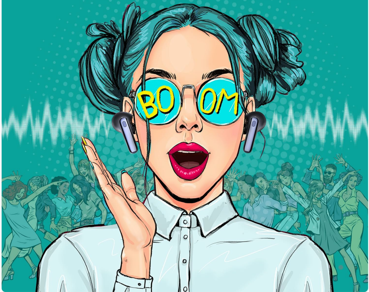
Image 3.1: The Quad Mic ENC (Environmental Noise Cancellation) feature ensures clear voice calls.