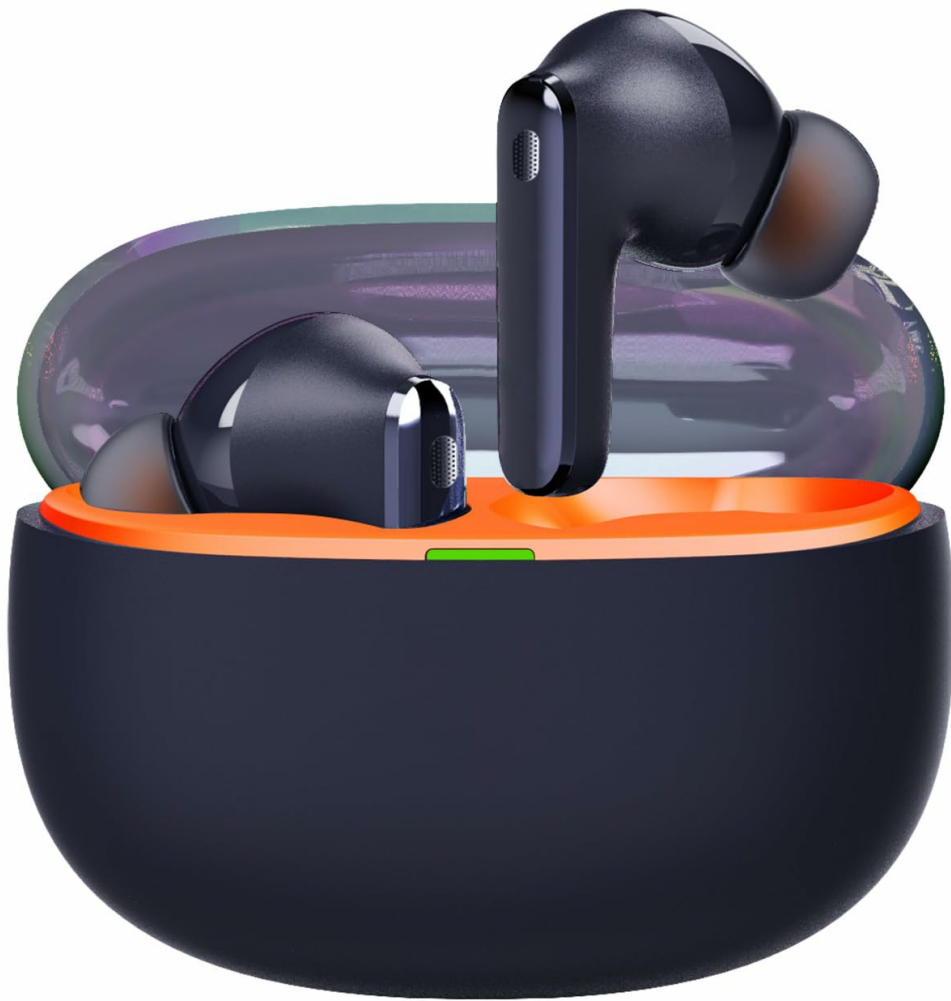
Image 1.1: itel T11Pro True Wireless Earbuds in their charging case.