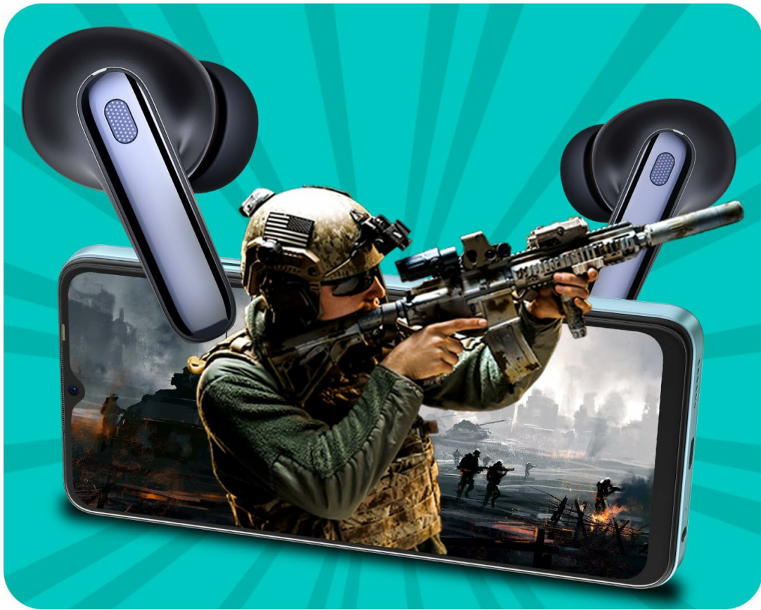
Image 3.2: The 45ms low latency feature provides a synchronized audio experience for gaming.