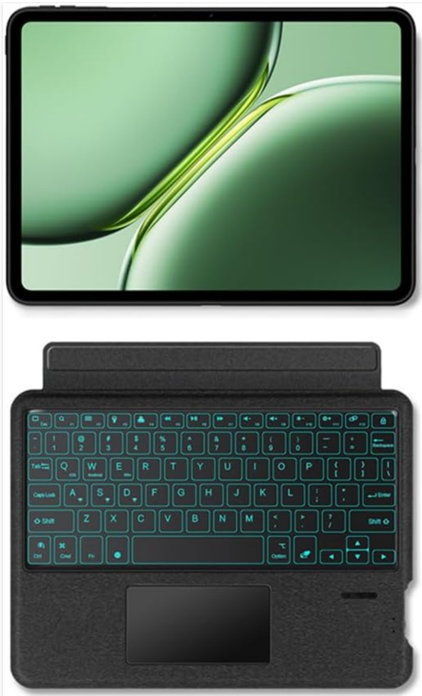
Image: Keyboard and tablet case detached.