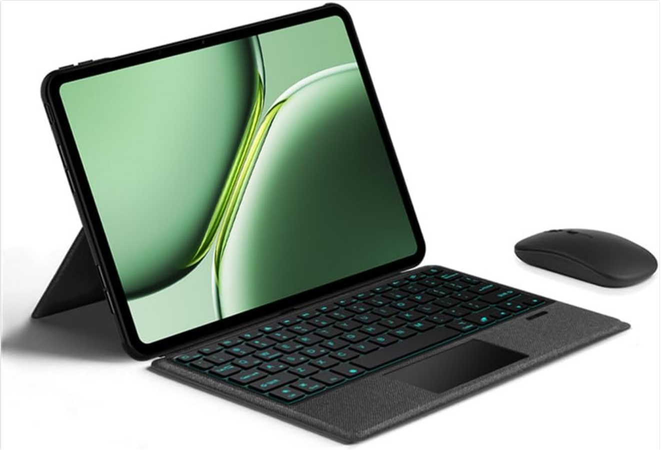
Image: Tablet in the keyboard case with the wireless mouse.