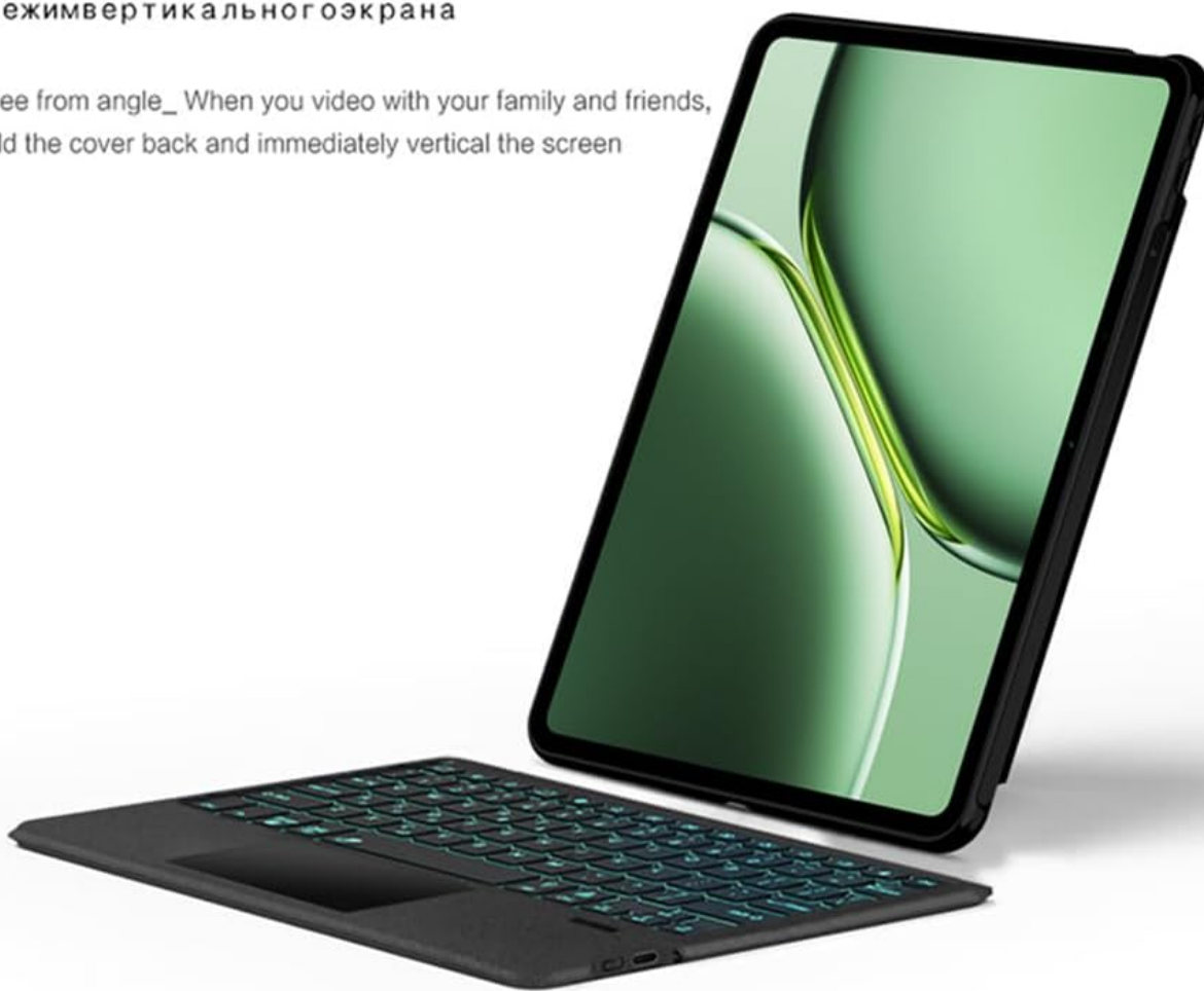
Image: Tablet in vertical stand mode.

Free from angle_ When you video with your family and friends, fold the cover back and immediately vertical the screen