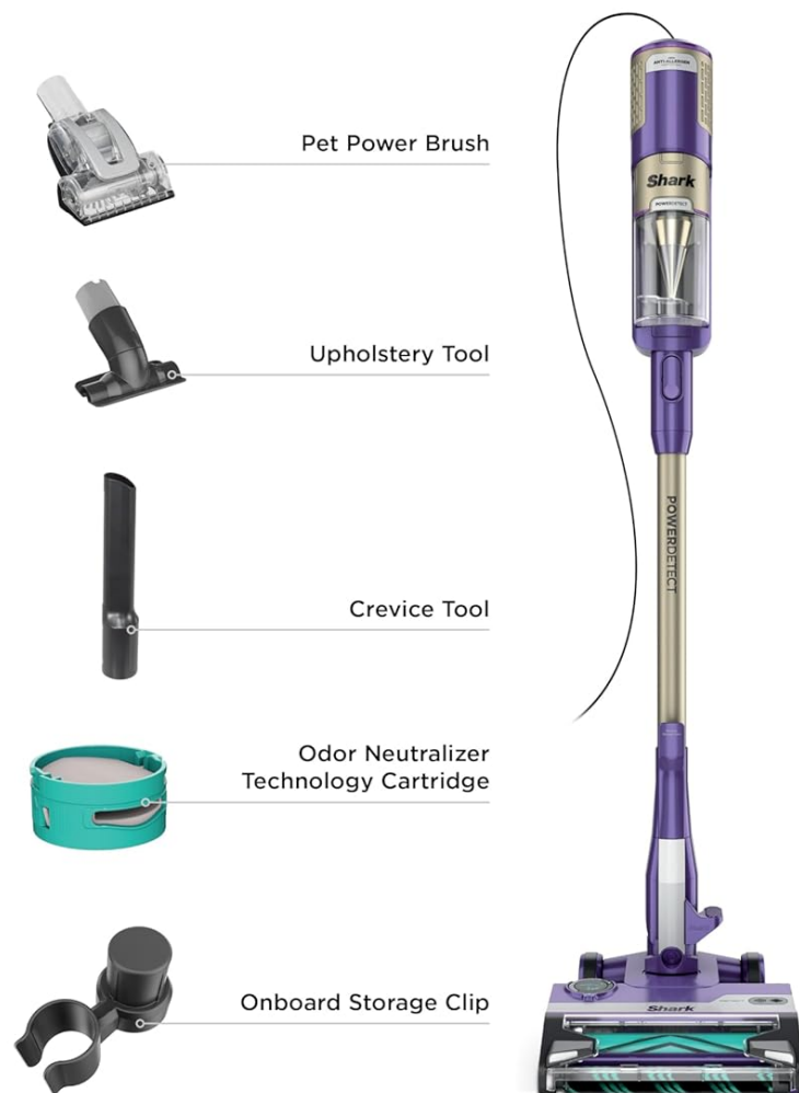
Image: Contents of the Shark POWERDETECT vacuum box, showing the main unit, pet power brush, upholstery tool, crevice tool, odor neutralizer technology cartridge, and onboard storage clip.