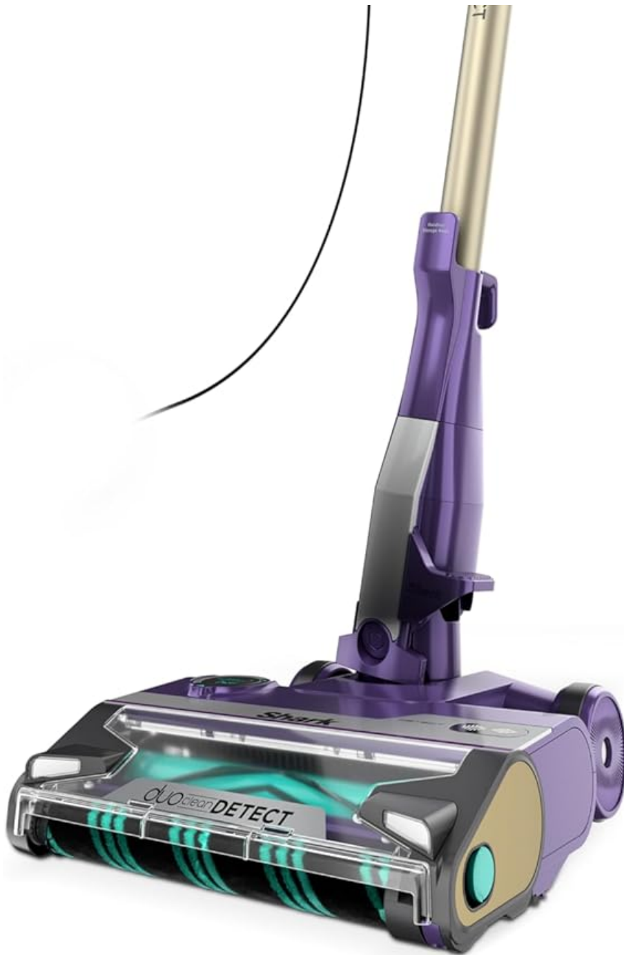
Image: The Shark POWERDETECT Ultra-Light Corded Stick Vacuum, showcasing its sleek design and corded operation.