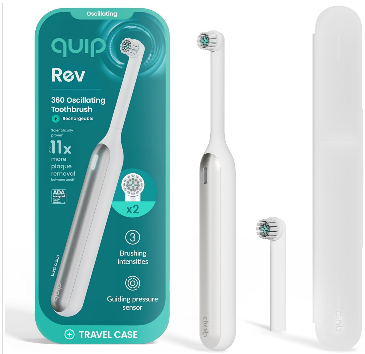
Image: The Quip 360 Oscillating Rechargeable Electric Toothbrush with its complete set of accessories, including the handle, brush heads, charging cable, stand, mirror mount, and travel case.