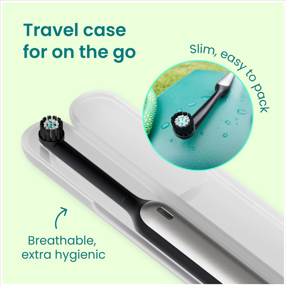
Image: The Quip toothbrush neatly stored within its slim and portable travel case, ideal for on-the-go use.