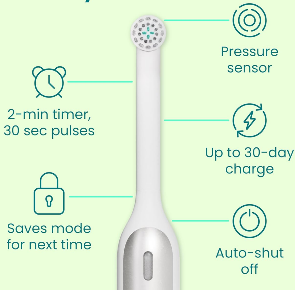
Image: Key features of the Quip toothbrush, highlighting the impressive 30-day battery life on a single charge.