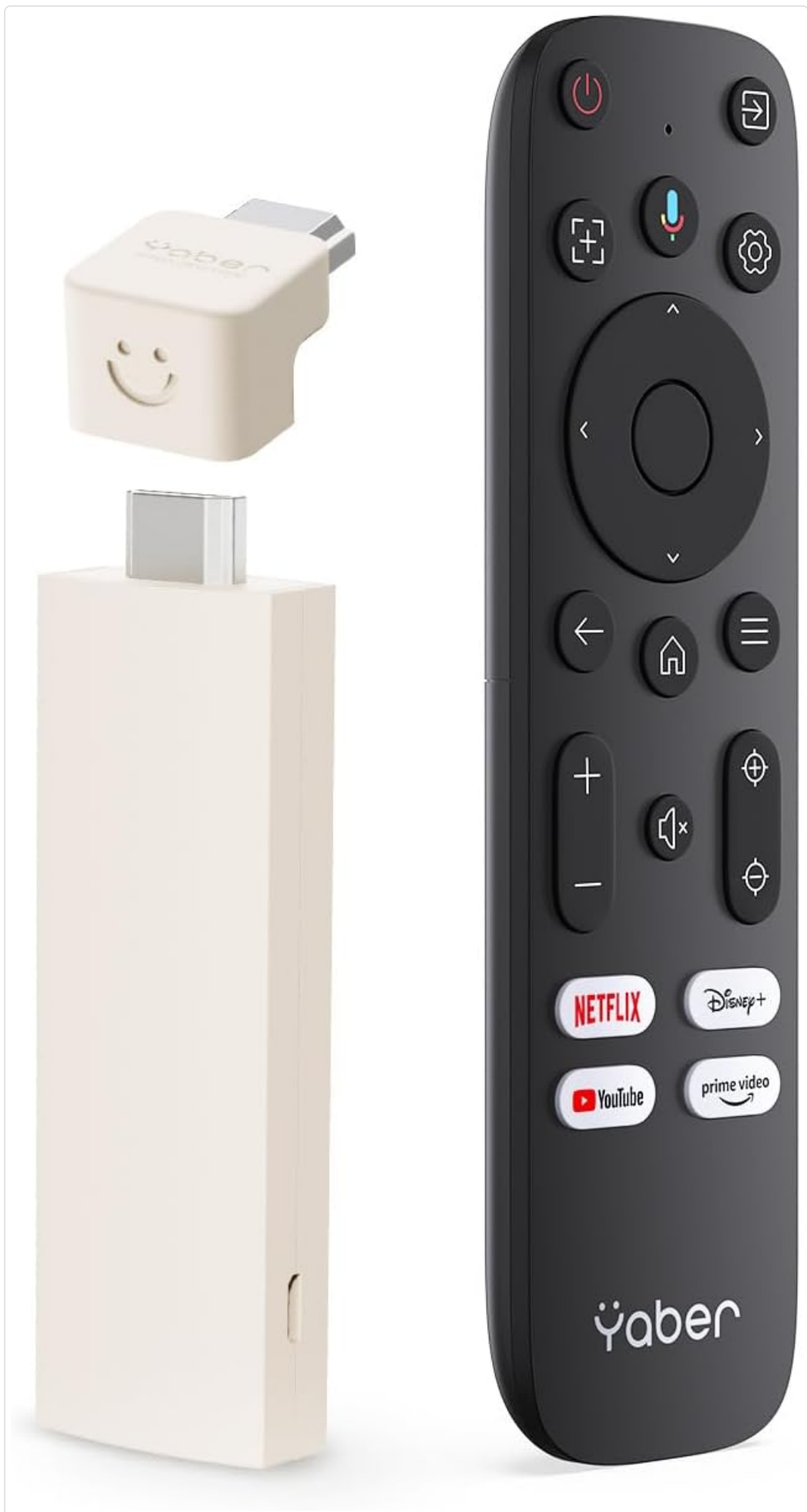
Image of the Yaber PROJECTOR T2 HDMI Adapter and its accompanying remote control. The adapter is a compact, cream-colored stick, and the remote is black with various control buttons and dedicated streaming service buttons.