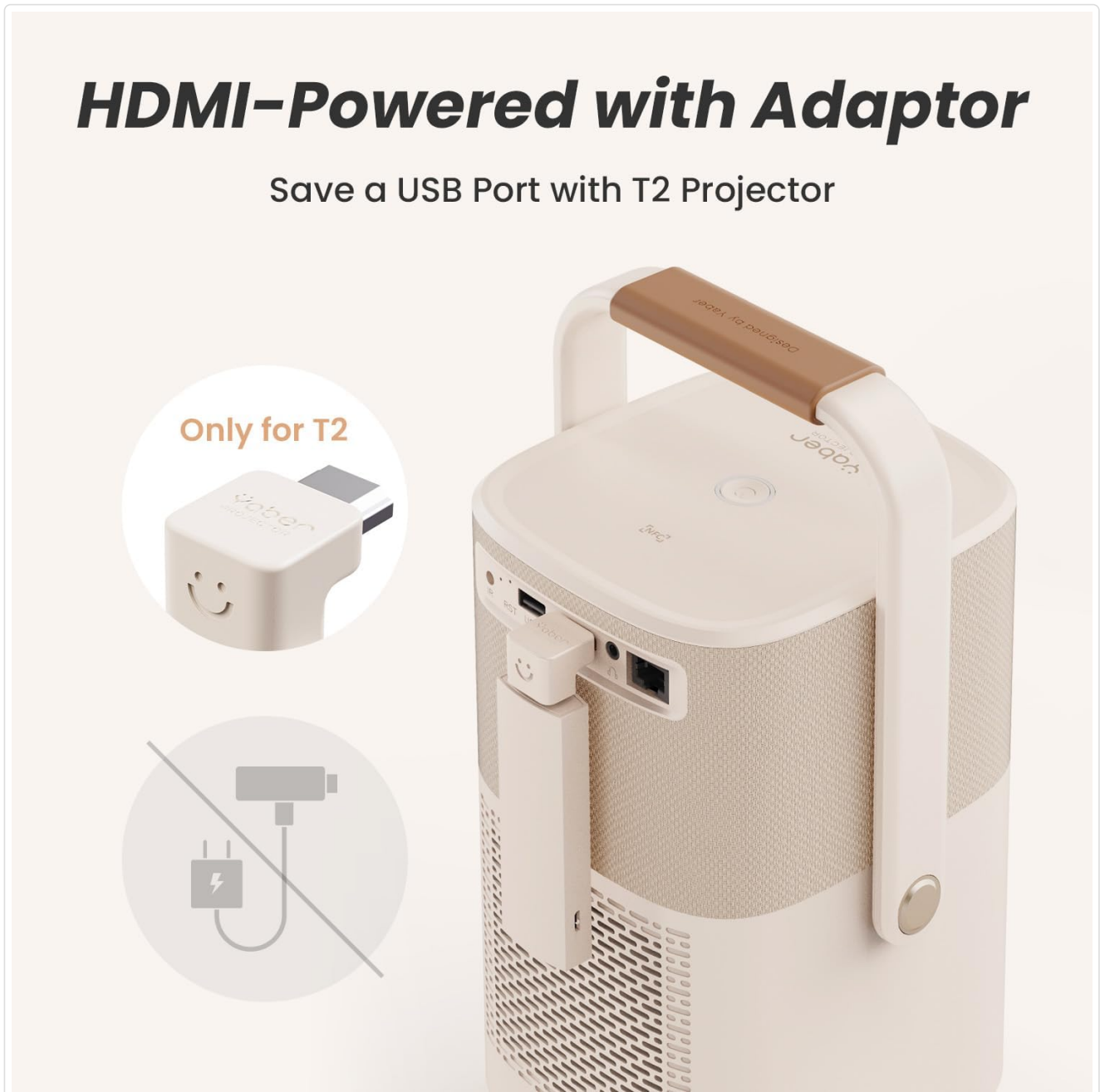
Image showing the T2 HDMI Adapter connected to a Yaber T2 Projector. The adapter is plugged into an HDMI port, and a small, separate power adapter is shown with text indicating 'Only for T2', emphasizing the HDMI-powered feature and saving a USB port.