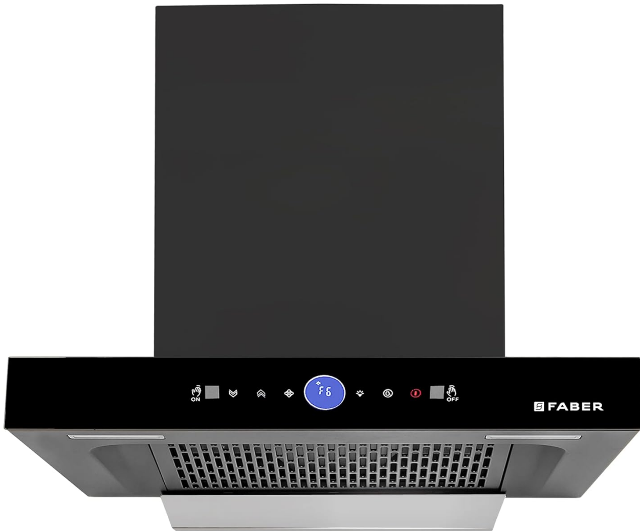
Image: Bottom view of the Faber HOOD DAZZLE BLDC FL HC BK 60 Kitchen Chimney, showing the filterless intake area.