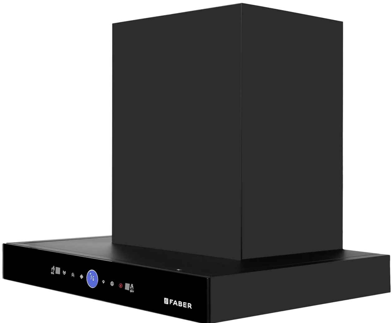
Image: Front view of the Faber HOOD DAZZLE BLDC FL HC BK 60 Kitchen Chimney, showcasing its sleek black design and control panel.

This chimney is designed for wall-mounted installation. Ensure the wall is strong enough to support the appliance's weight (approximately 18 kg). The recommended mounting height above the cooking surface should be followed as per local safety standards and the chimney's specifications to ensure effective suction and safety.