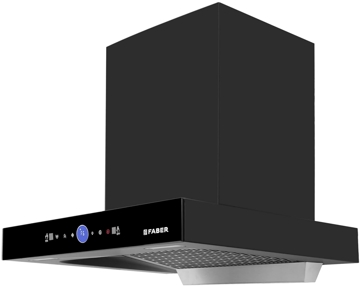
Image: Angled view of the Faber HOOD DAZZLE BLDC FL HC BK 60 Kitchen Chimney, highlighting the touch and gesture control panel.