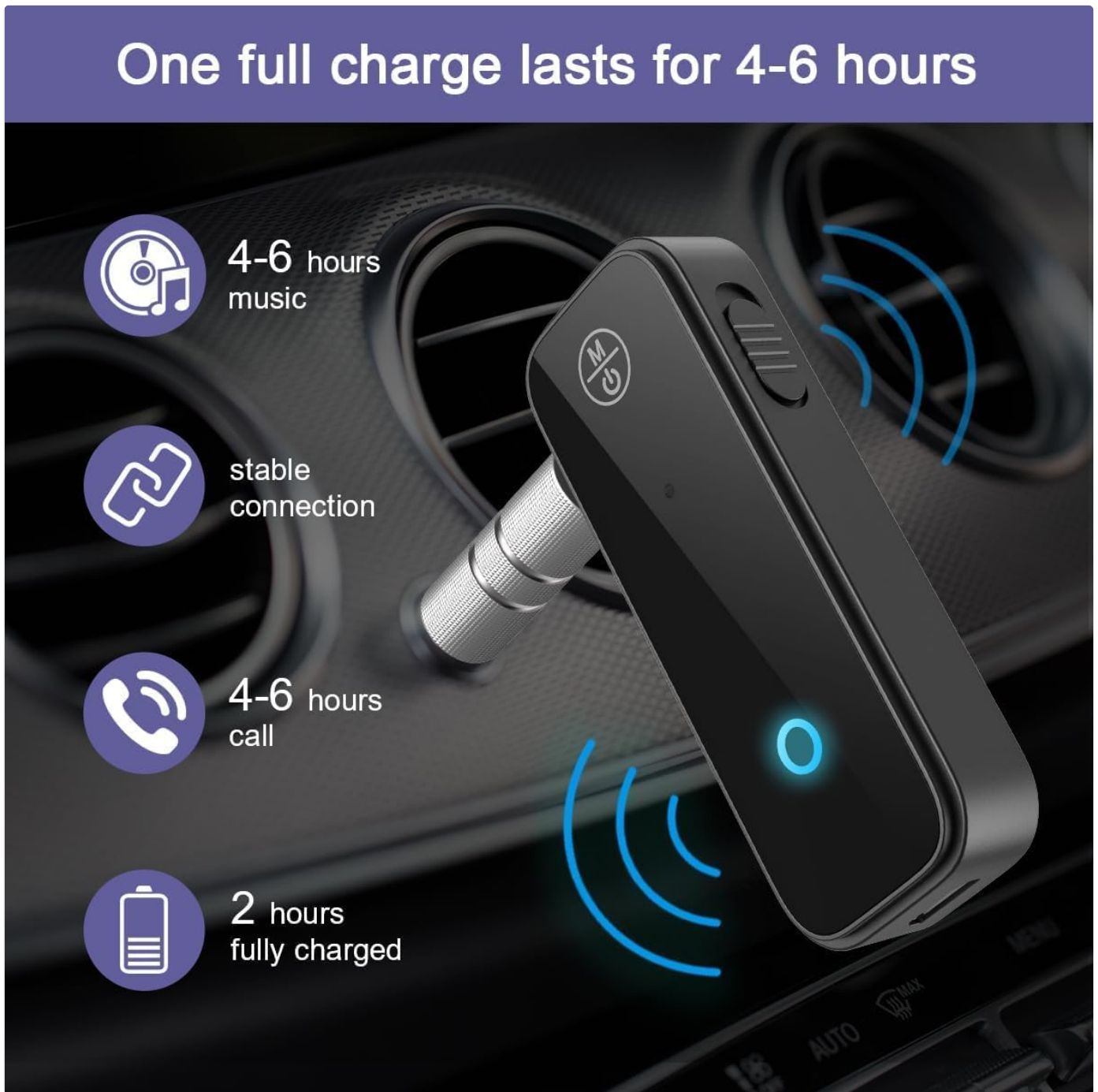
Figure 2: Battery Life and Charging Information. The adapter provides 4-6 hours of music playback or call time, and takes about 2 hours to fully charge.

charging status and turn off or change color when fully charged. A full charge typically takes approximately 2 hours.