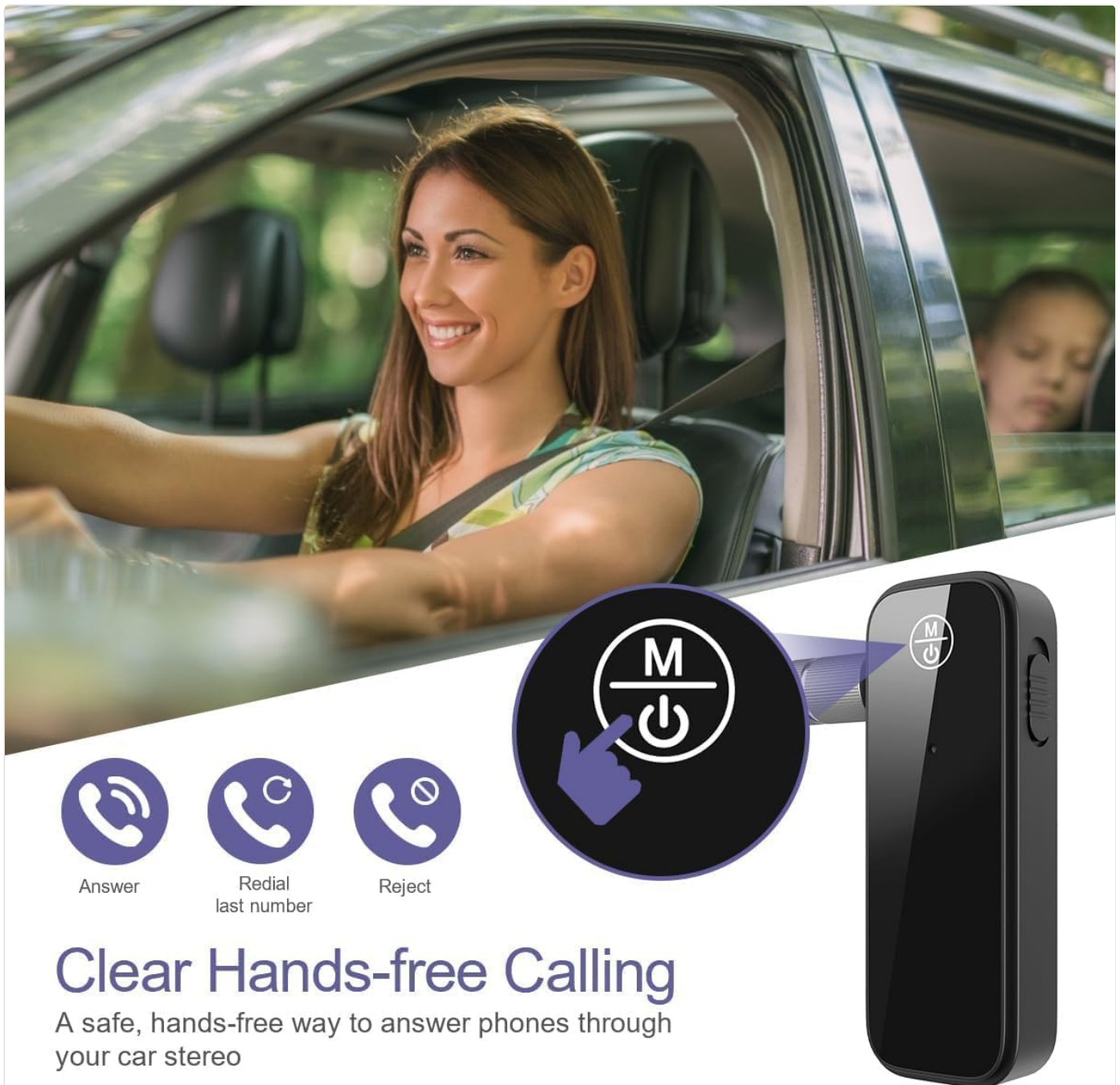
Figure 6: Hands-free Calling Feature. This image illustrates the convenience of hands-free calling in a car environment using the adapter's built-in microphone and multifunction button.

When the adapter is in RX mode and connected to your smartphone, you can use its built-in microphone for hands-free calls.