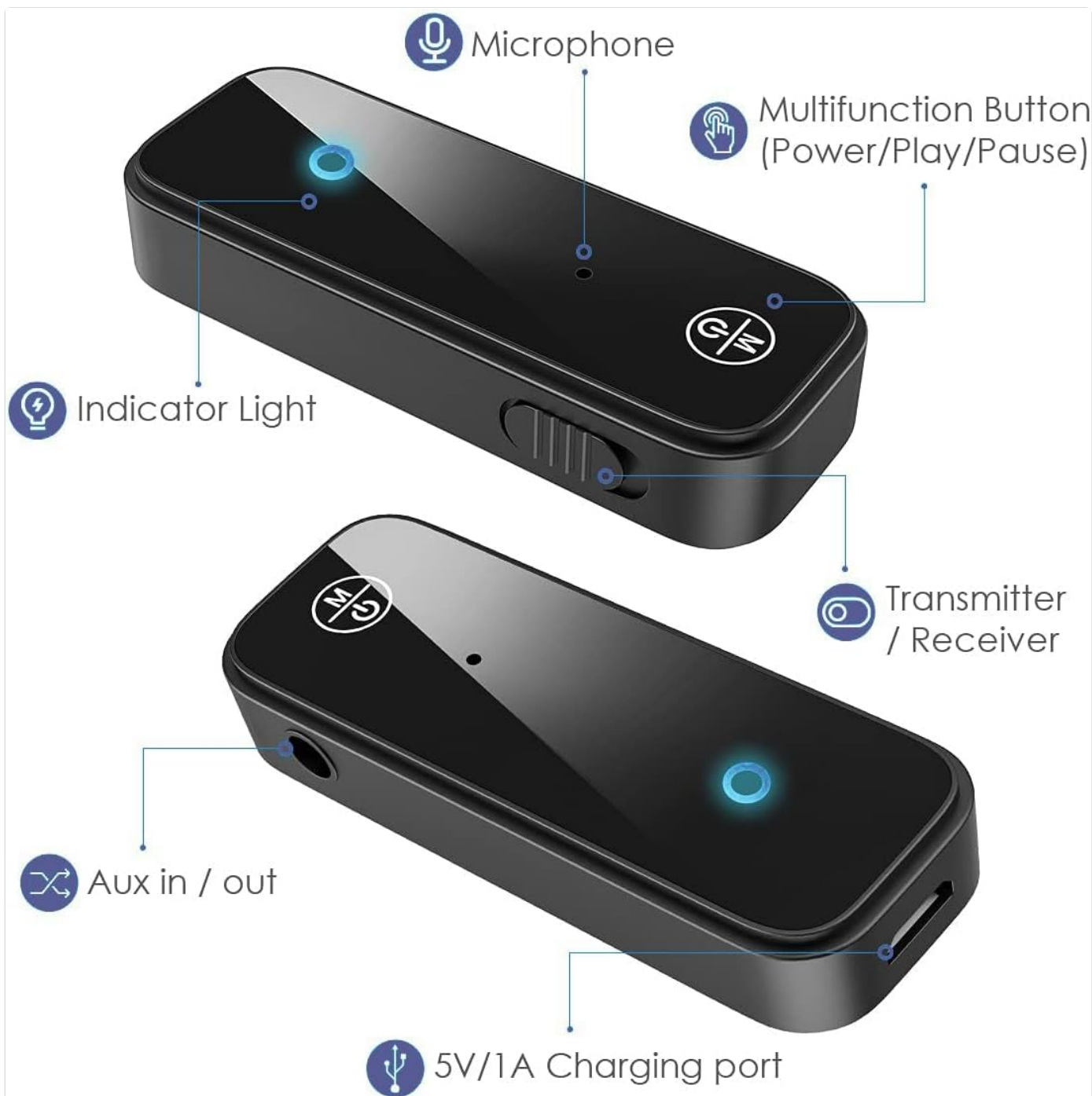
Figure 1: OQIMAX CP210 Bluetooth Adapter Component Diagram. This image highlights the various parts of the adapter, including the microphone, multifunction button (power/play/pause), indicator light, TX/RX mode switch, 3.5mm Aux in/out port, and the 5V/1A USB charging port.