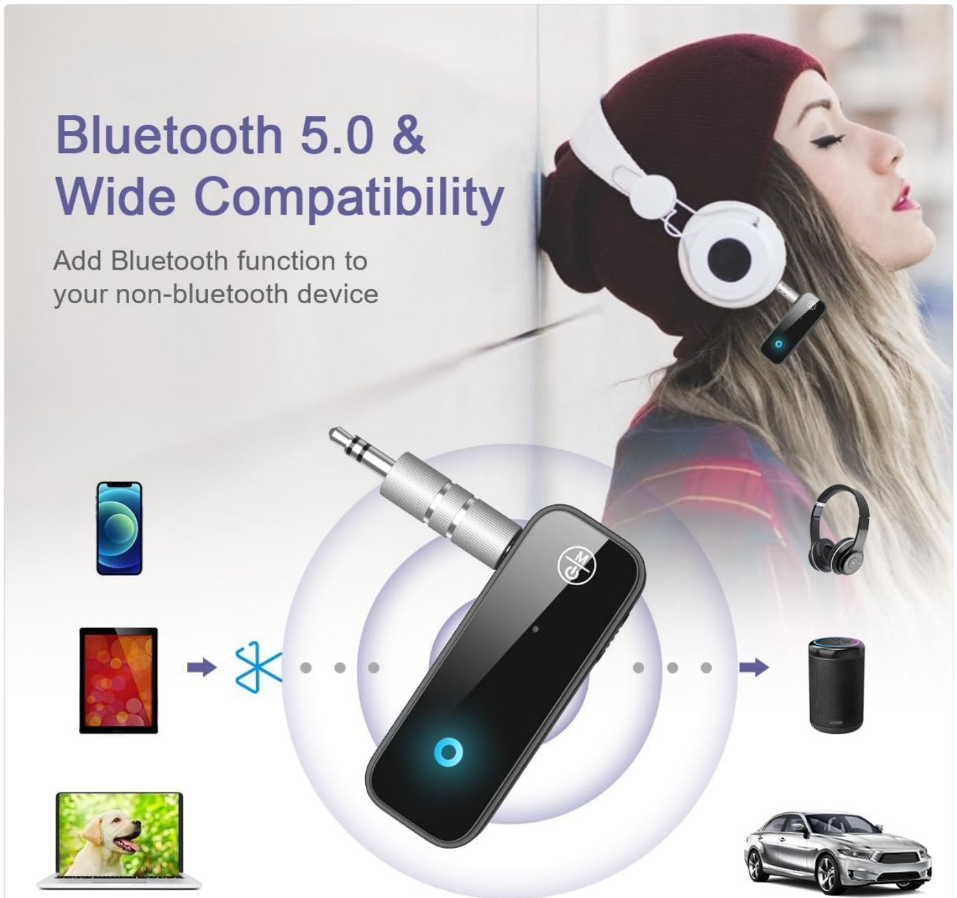
Figure 4: Wide Compatibility in Receiver Mode. This image demonstrates the adapter's ability to connect various Bluetooth source devices (phones, tablets, laptops) to non-Bluetooth output devices (headphones, speakers, car stereos) via its 3.5mm AUX connection.