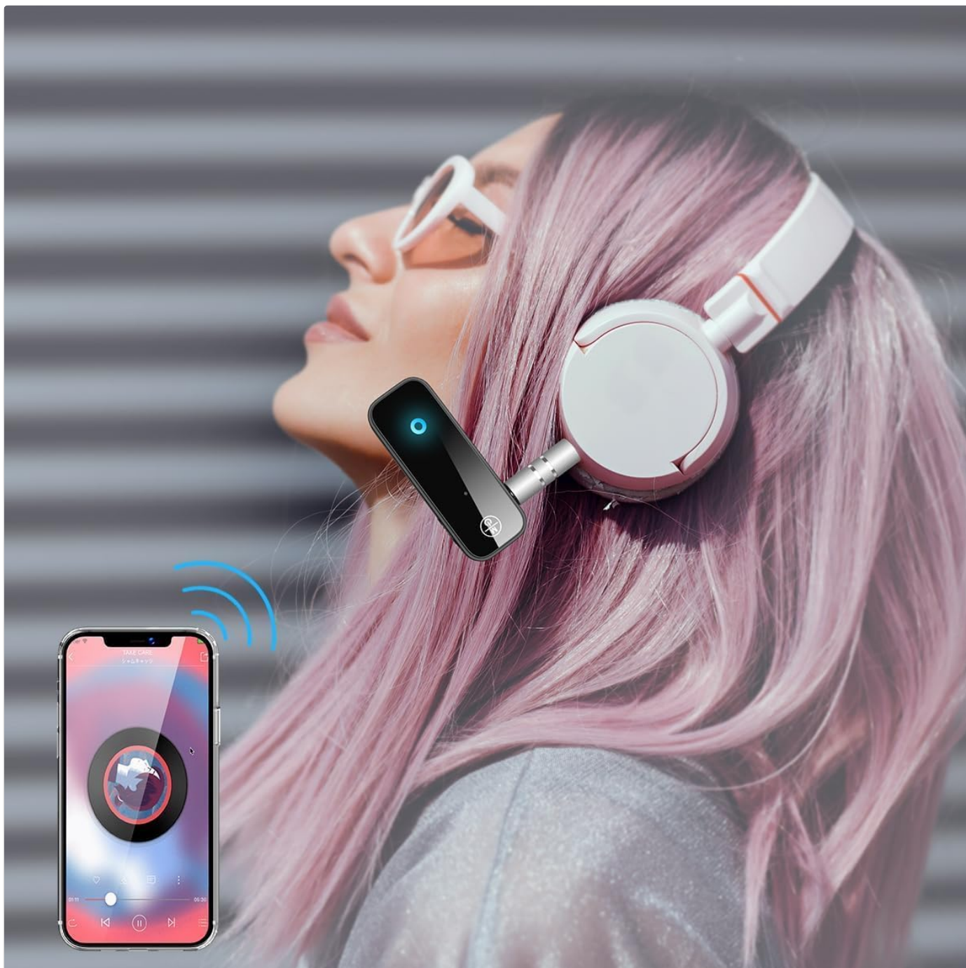
Figure 5: Adapter in use with headphones. The OQIMAX CP210 adapter is shown connected to a pair of wired headphones, receiving audio wirelessly from a smartphone.