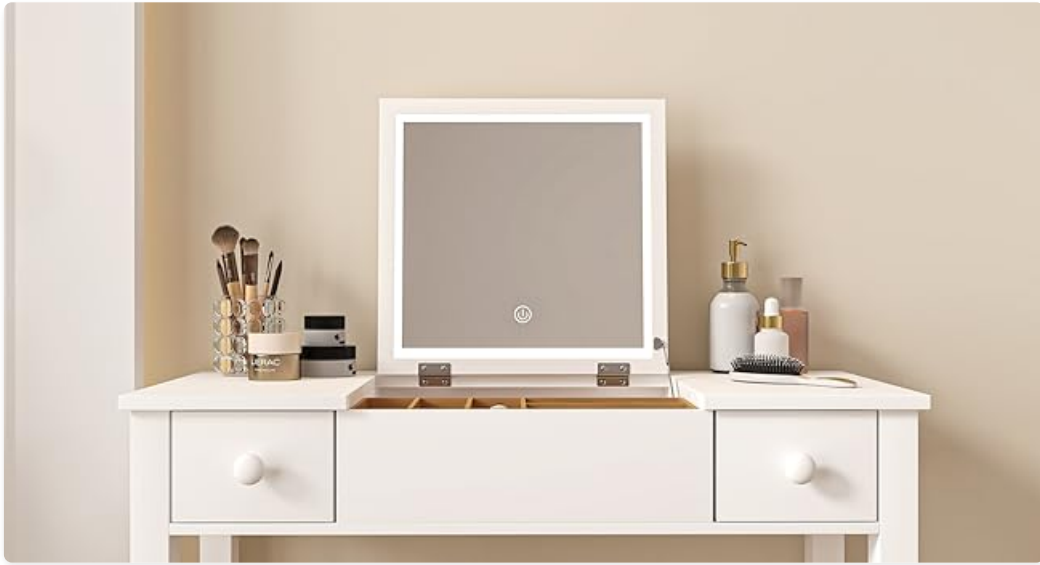
A close-up view of the flip-top mirror, showcasing the integrated LED lighting system with touch control.

The vanity features a flip-top mirror with integrated LED lighting. To access the mirror and internal storage, gently lift the top panel.