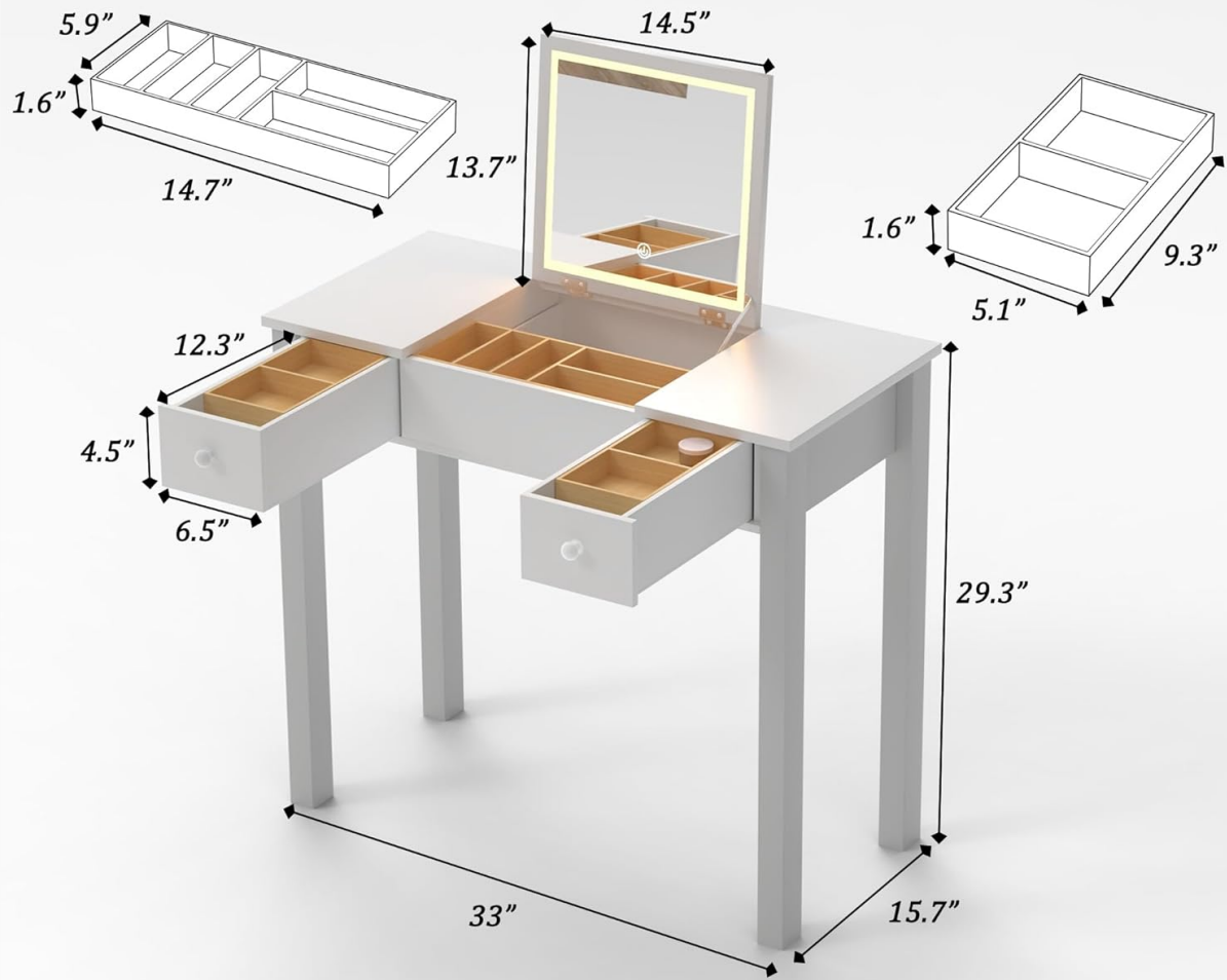
Detailed diagram illustrating the overall dimensions of the vanity desk and the measurements of its internal and drawer storage organizers.