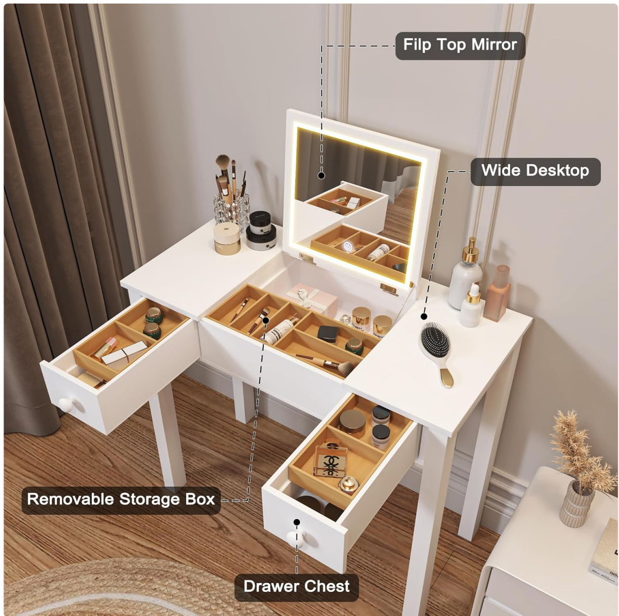
An overhead view of the vanity desk highlighting its key features: the flip-top mirror, wide desktop surface, removable storage boxes, and drawer chests.