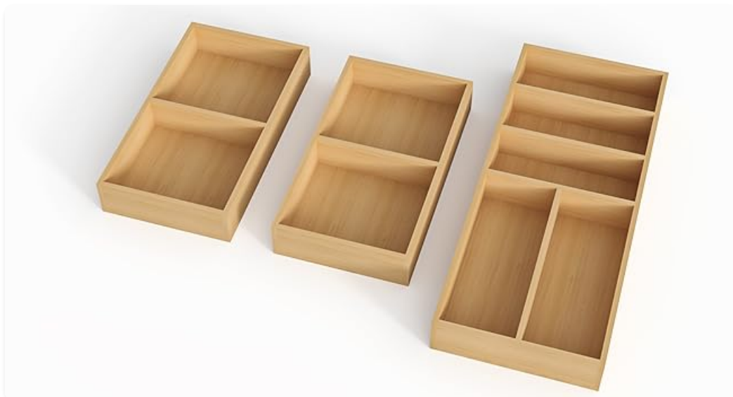
The removable wooden storage organizers, designed to keep cosmetics and accessories neatly separated within the vanity's compartments.

The removable storage boxes can be easily lifted out for cleaning or to reconfigure the internal storage