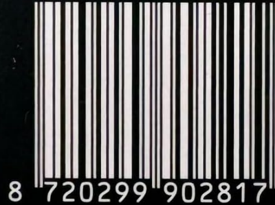
Image: Product information and certifications on the back of the box.