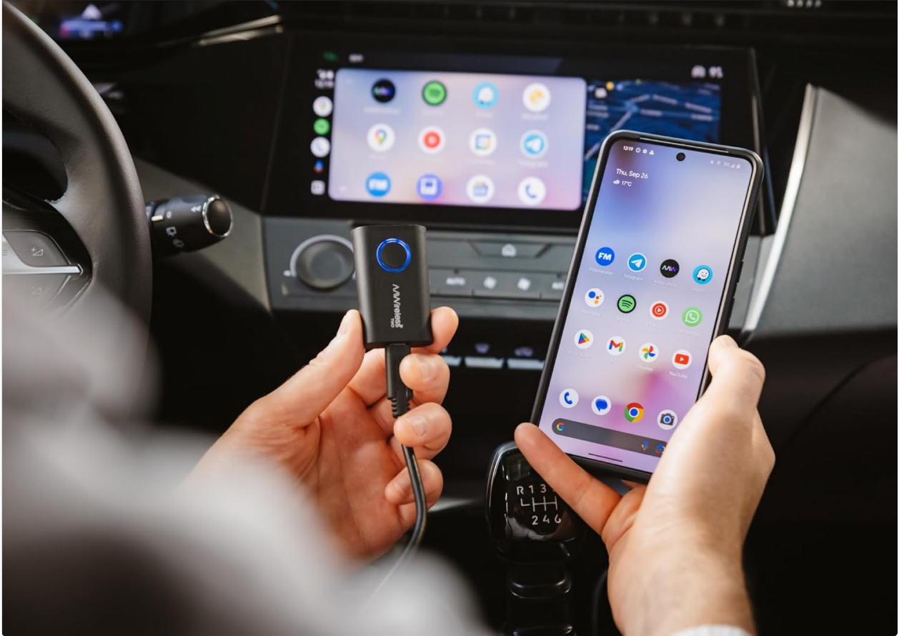
Image: Your favorite Android Auto apps displayed wirelessly on the car screen.