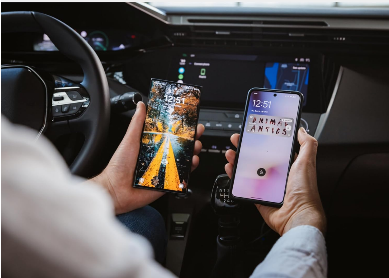
Image: Demonstrating the ability to easily pair and switch between multiple phones.