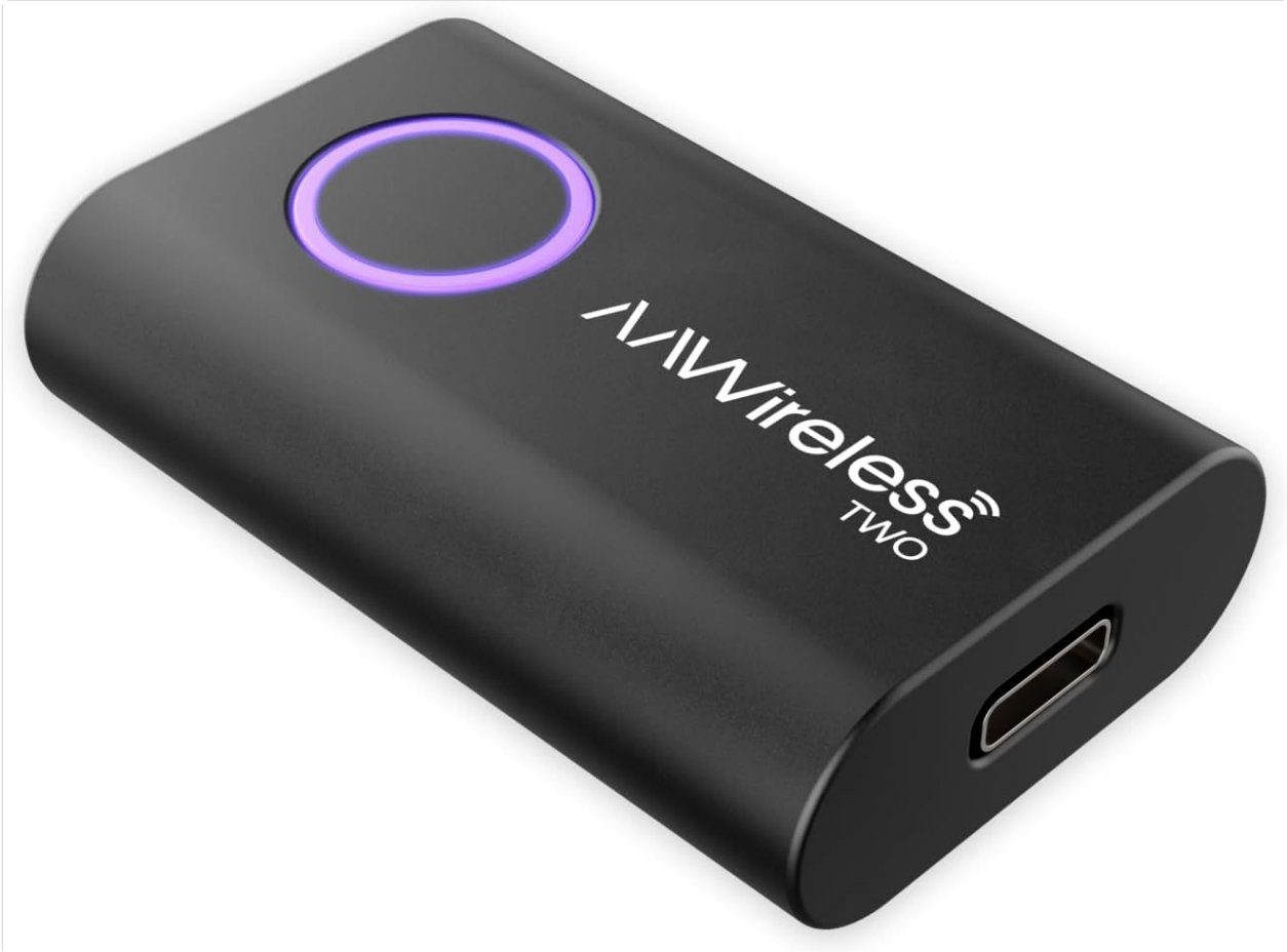
Image: The compact AAWireless Two adapter.