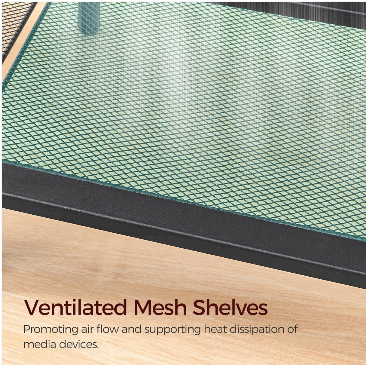
Figure 5: Ventilated Mesh Shelves.

This image shows a detailed view of the mesh design of the shelves. The open grid pattern is intended to allow air to flow freely around electronic devices, preventing overheating and ensuring proper ventilation for optimal device performance.