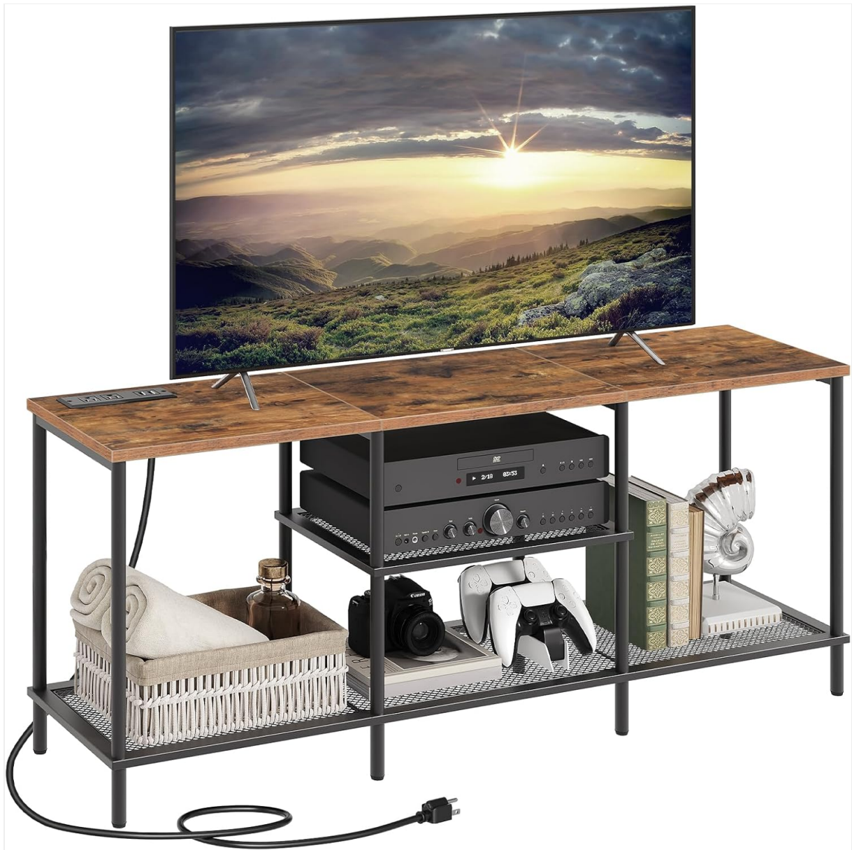
Figure 1: Assembled MAHANCRIS TV Stand with Power Outlets (Model TVHR131E01).

This image shows the MAHANCRIS TV Stand fully assembled, featuring a rustic brown top surface, black metal frame, and mesh shelves. A television is placed on top, and various media devices, books, and decorative items are arranged on the shelves. A power cord extends from the integrated power strip on the top surface.