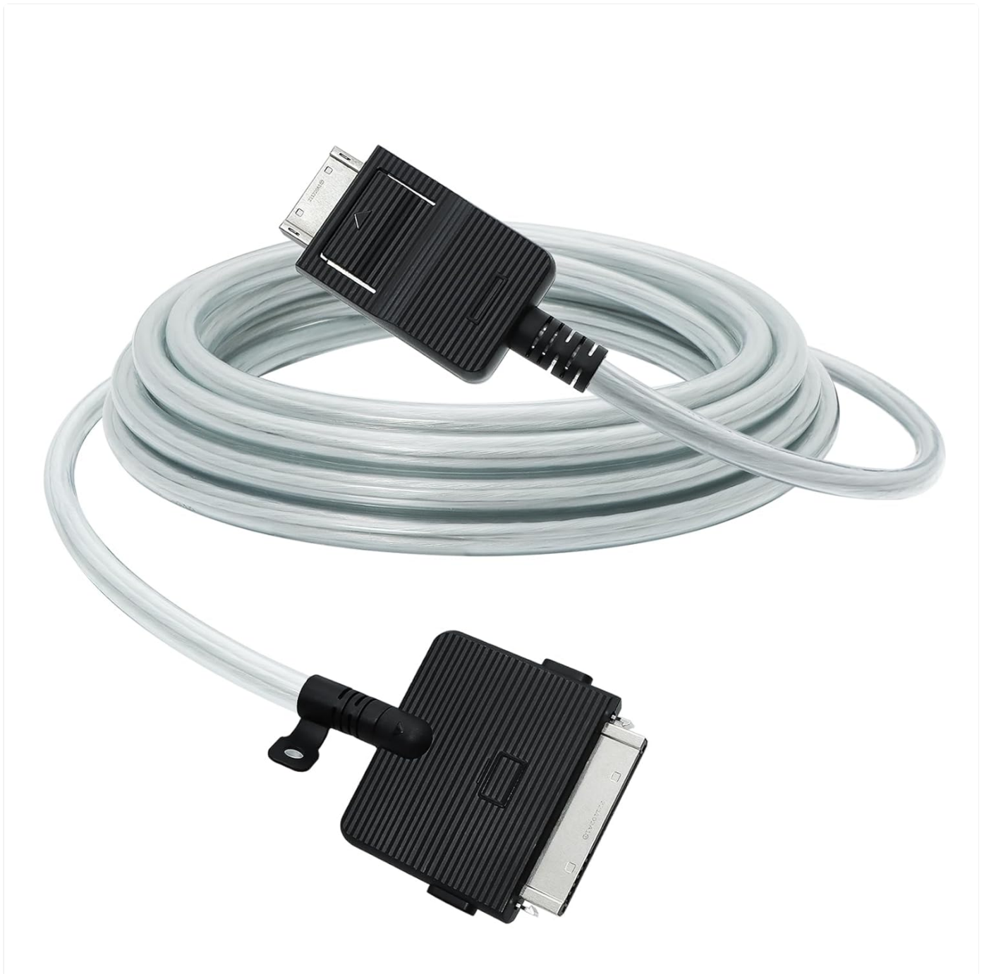
Figure 1: The VG-SOCC05 One Connect Cable, coiled for storage.