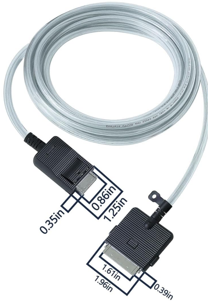
Figure 7: The 5-meter (16.4 feet) length of the cable provides ample reach for connecting your TV to the One Connect Box.