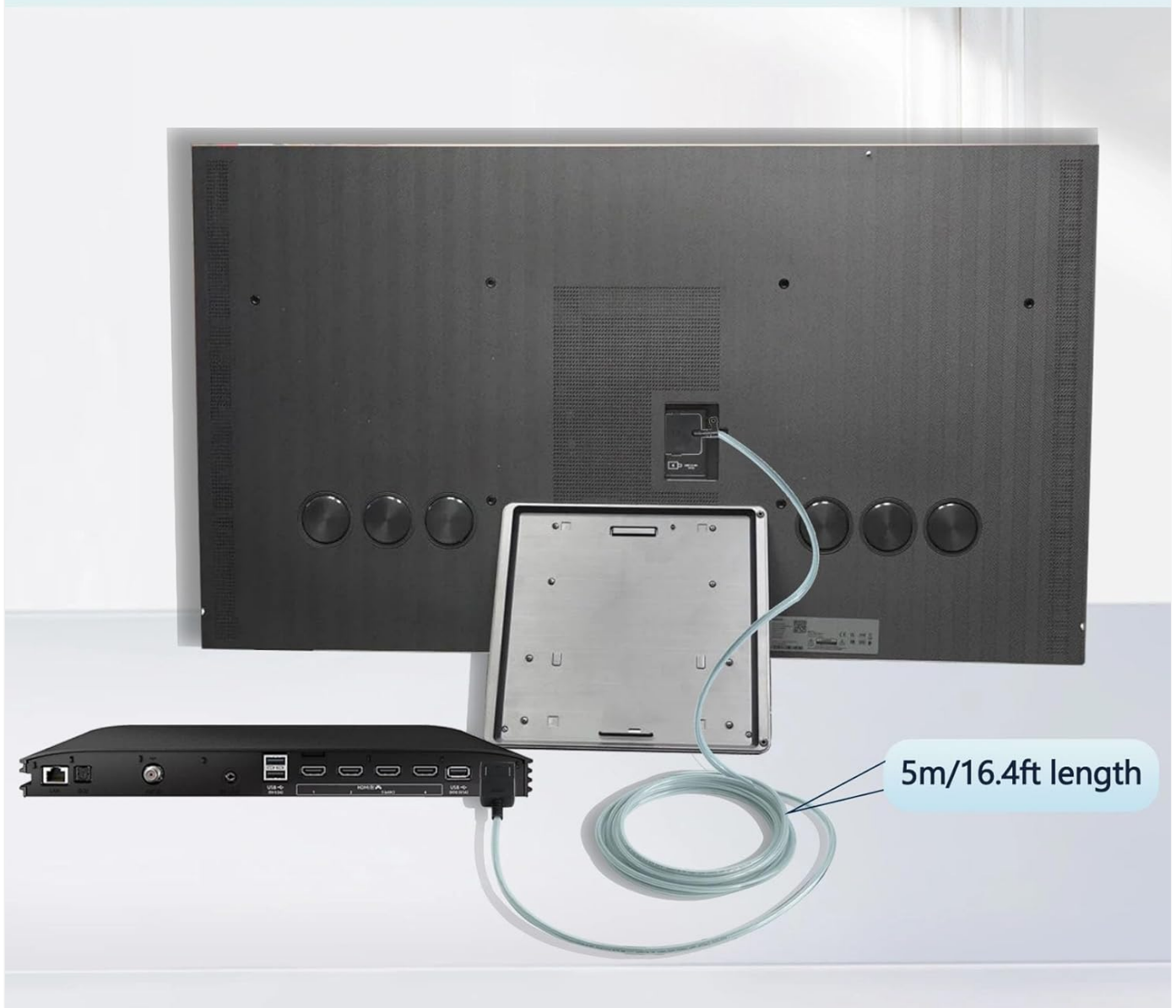
Figure 6: Visual comparison of the VG-SOCC05 cable connector with incompatible cable types (BN39-02688A, BN39-02688B). Ensure your cable matches the VG-SOCC05 type.