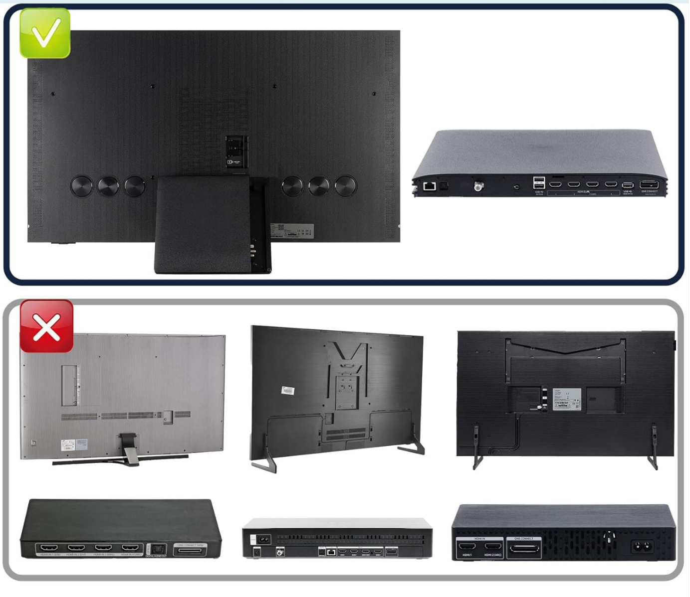
Figure 4: Proper connection of the VG-SOCC05 cable to the TV and One Connect Box. Note that this cable is only compatible with the specific One Connect Box shown.

Cable VG-SOCC05 can only be used with this TV and connection box. Not compatible with other TVs or connection boxes.