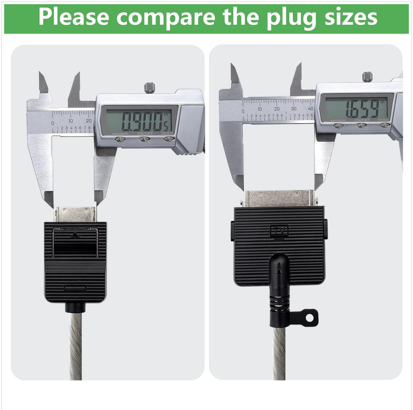
Image 3: A visual comparison of the two distinct plug sizes and shapes of the One Connect Cable, measured with calipers. This image helps users verify that the cable's connectors will fit their specific TV and One Connect Box ports.

The two plugs on this cable have distinct shapes. It is essential to compare these shapes with the ports on your TV and One Connect Box to ensure a correct fit.