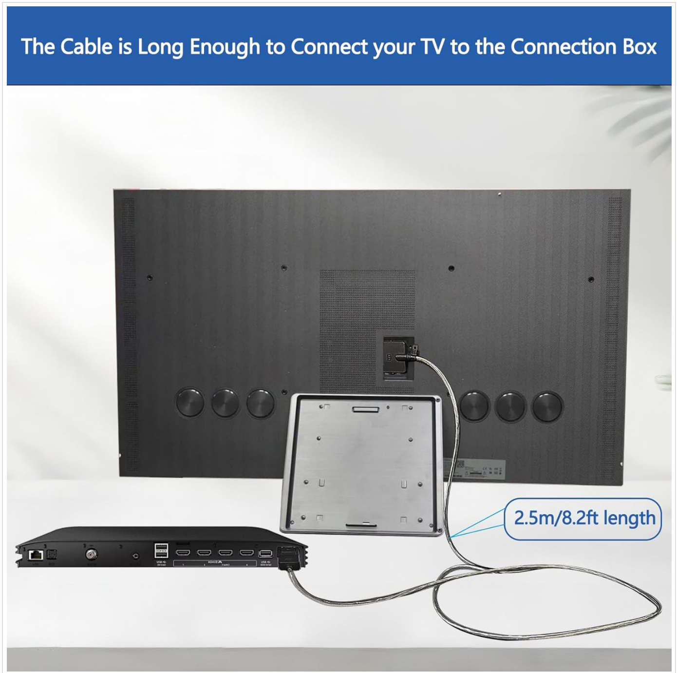
Image 5: The 2.5m (8.2ft) One Connect Cable properly installed, connecting a compatible Samsung TV to its One Connect Box. This demonstrates the typical setup and the cable's length in a practical application.

5. Power On: Once the cable is securely connected at both ends, plug in your TV and One Connect Box, then power them on.