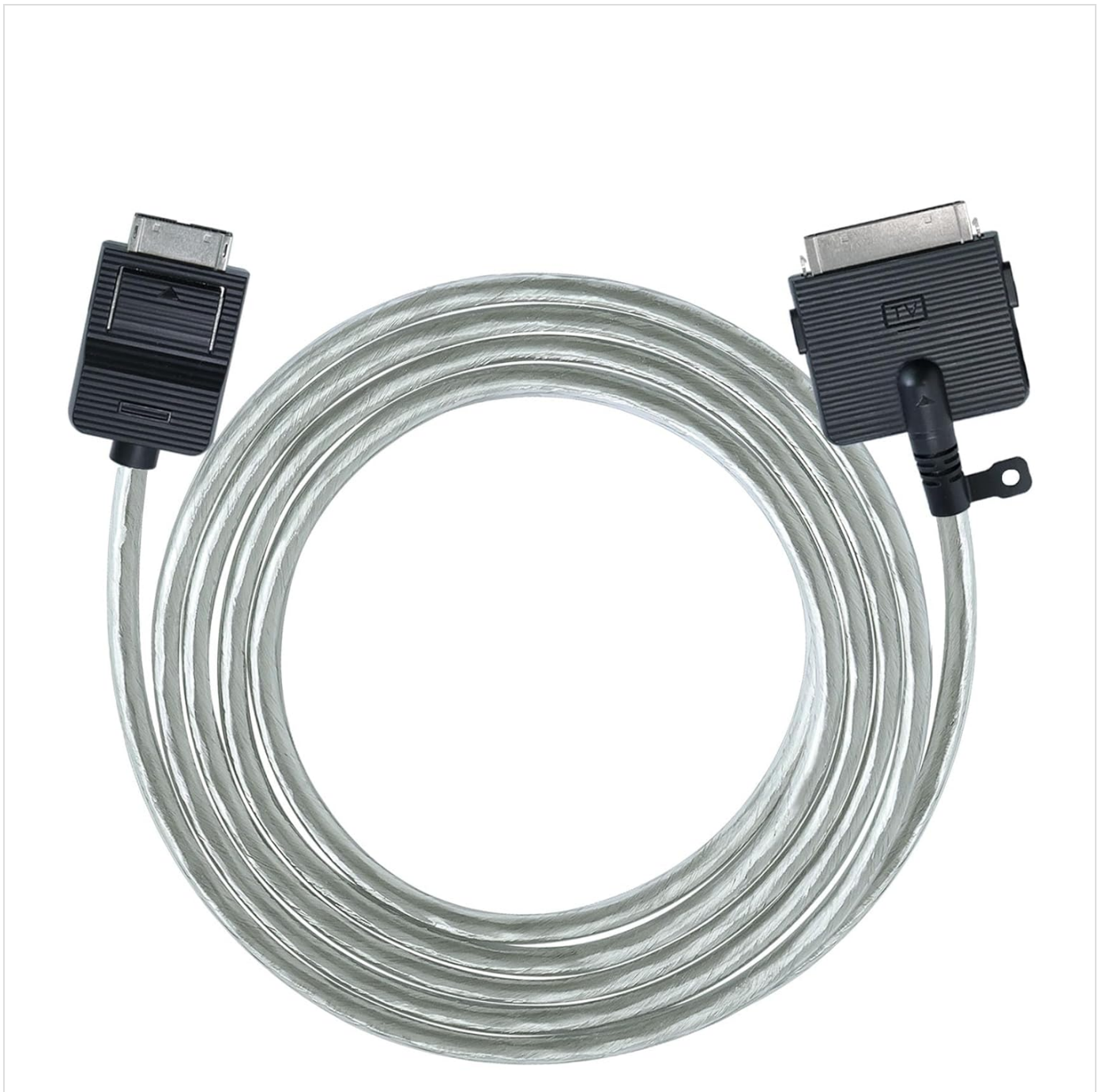
Image 1: The Tjyuzo BN39-02903A One Connect Cable, coiled for display. This cable is 2.5 meters (8.2 feet) in length and features distinct connectors at each end for specific ports on compatible Samsung TVs and One Connect Boxes.