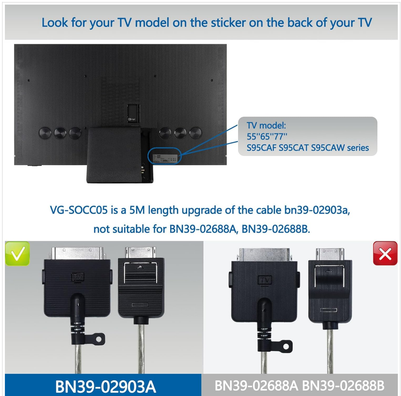
Image 2: Illustration showing how to locate the TV model sticker on the back of a Samsung TV and a visual comparison of the BN39-02903A cable connector with incompatible cable types (BN39-02688A, BN39-02688B). Ensure your TV model matches the compatible

To confirm your TV model, locate the sticker on the back of your television or navigate to the "About TV" option within your TV's settings menu.