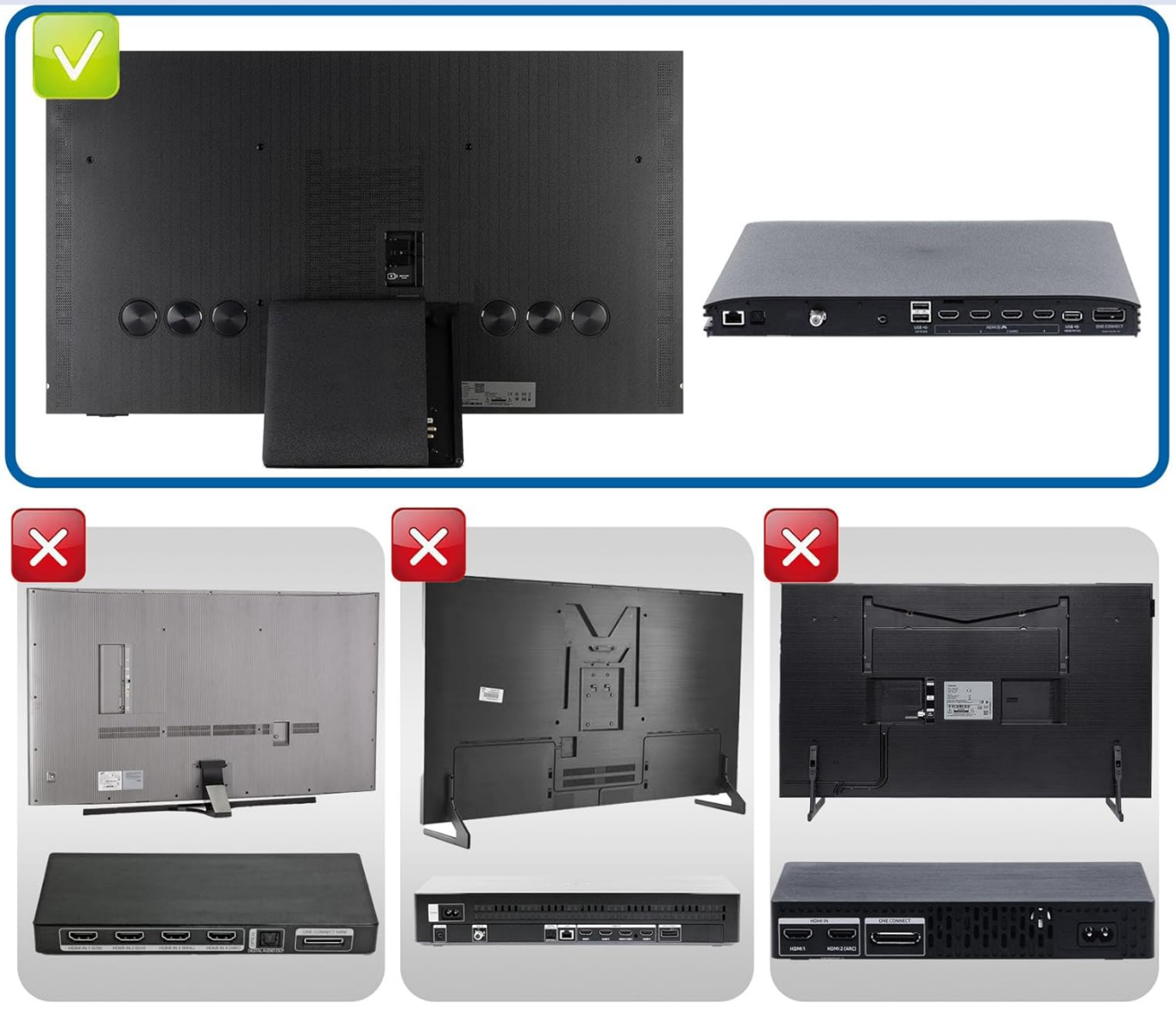
Image 4: This image illustrates the correct TV and One Connect Box configuration for the BN39-02903A cable (top panel, marked with a green checkmark). The bottom panel shows examples of incompatible TV backs and One Connect Boxes (marked with red 'X's), highlighting that the cable is not universally compatible.

Cable BN39-02903A can only be used with this TV and connection box. Not compatible with other TVs or connection boxes.