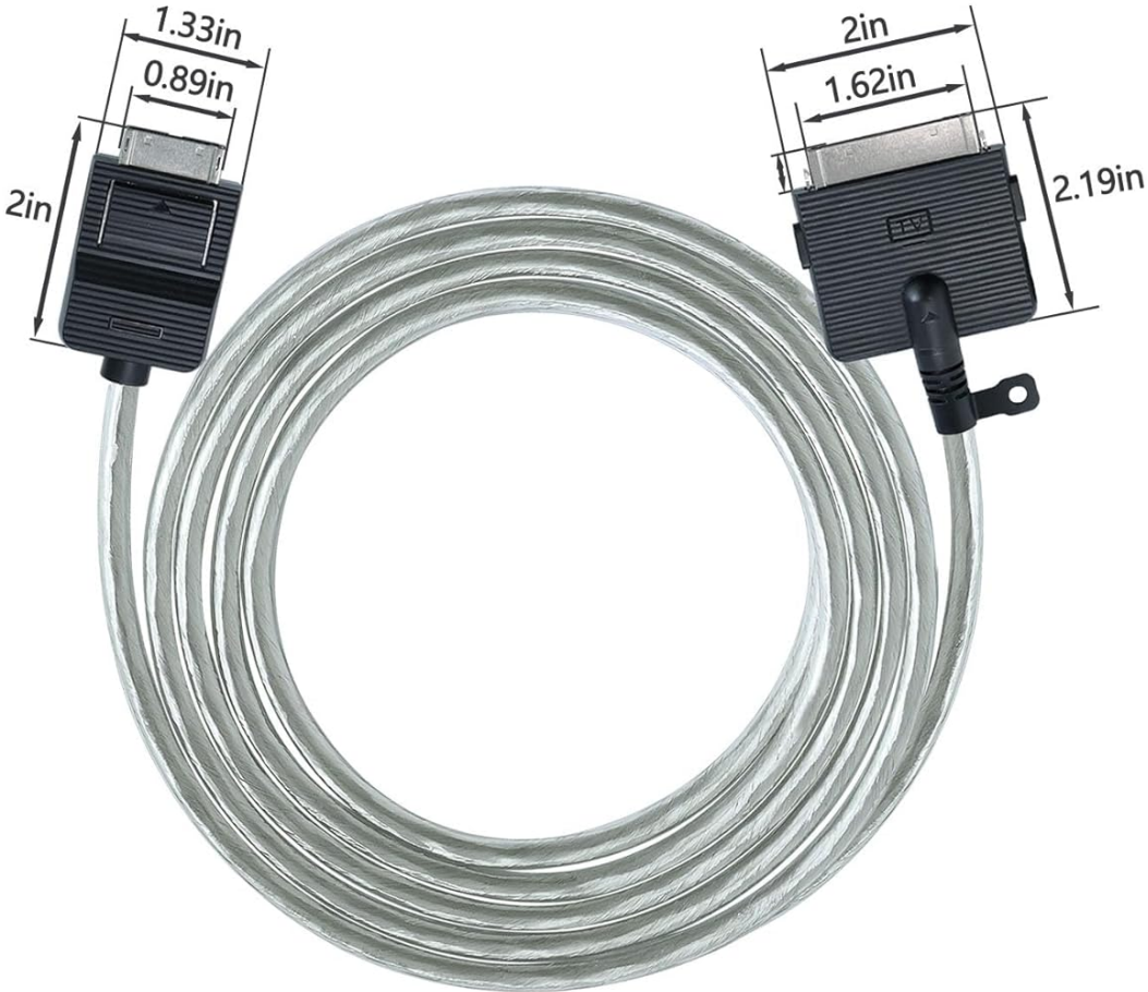
Image 6: Detailed diagram illustrating the 2.5m (8.2ft) length of the cable and the precise dimensions of its two distinct connectors. This provides critical information for verifying fit and compatibility.