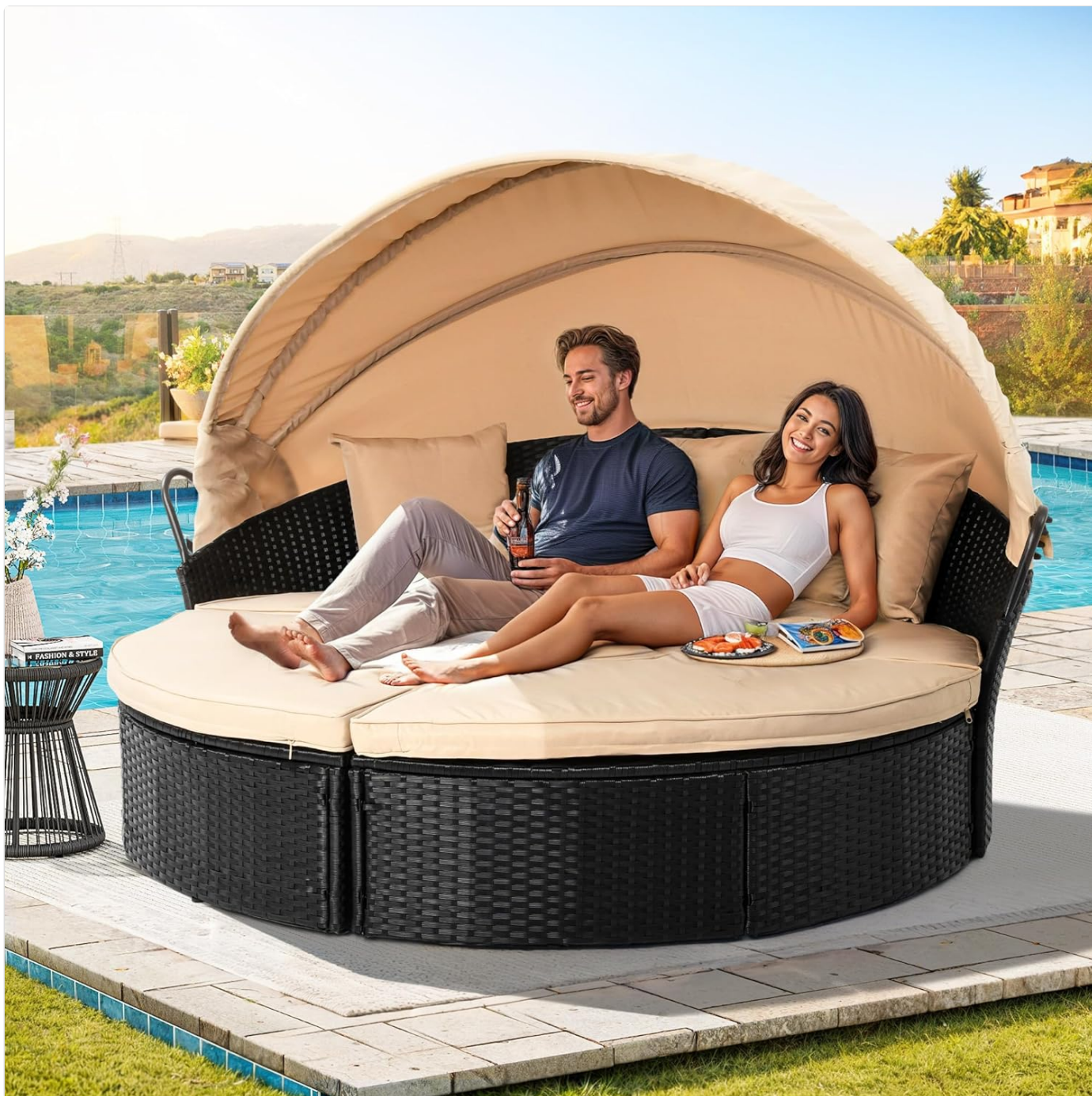
Image 1: Fully assembled YITAHOME Patio Round Daybed with retractable canopy extended.