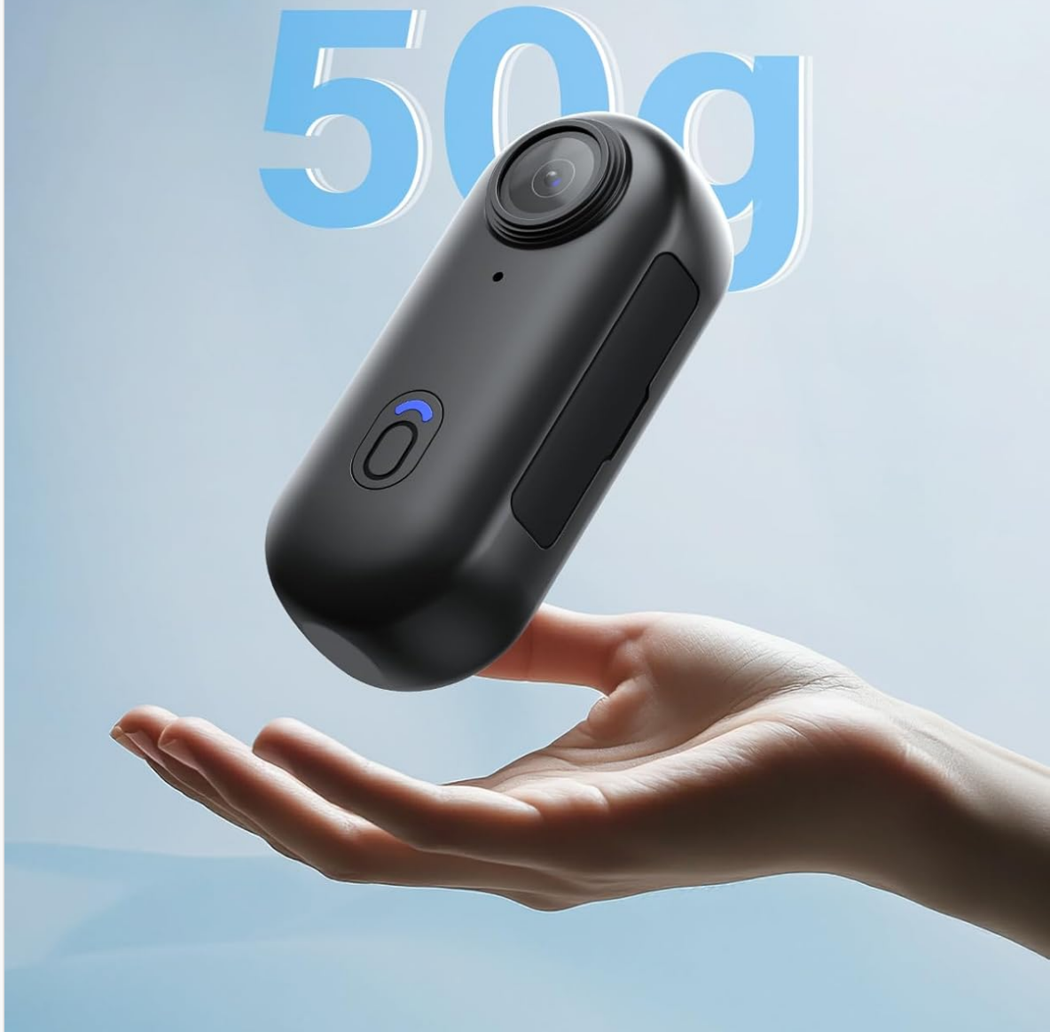
Image: The BOBLOV W4 camera, highlighting its lightweight design at only 50 grams.