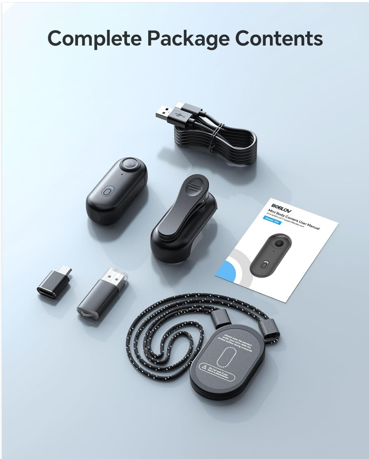
Image: All components included in the BOBLOV W4 package.