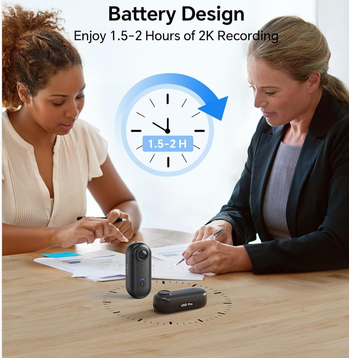
Image: The camera's 800mAh battery provides 90-120 minutes of continuous recording.