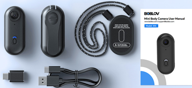
Image: The camera can be connected to both Windows and Mac computers for data transfer.