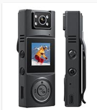
Image: Introduction to the camera's main button and low battery warning.

The camera supports loop recording, meaning that when the memory card is full, it will automatically overwrite the oldest video files to continue recording. This ensures continuous capture without manual deletion of old files.