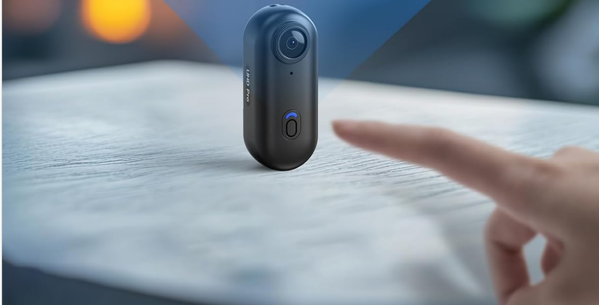
Image: The camera features a user-friendly one-click recording function.