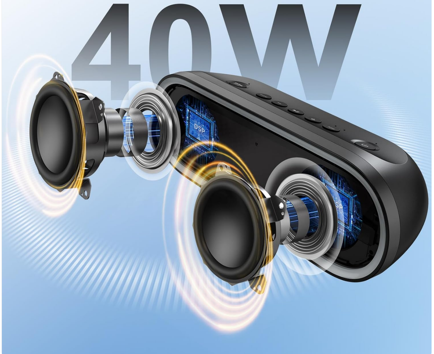
Image: An exploded view of the speaker's internal components, highlighting the two full-range speakers and DSP technology responsible for its 40W stunning sound.

The speaker is equipped with two full-range speakers and a passive radiator, delivering 40W of rich sound with enhanced bass. Dual DSP technologies reduce distortion and balance the audio output.