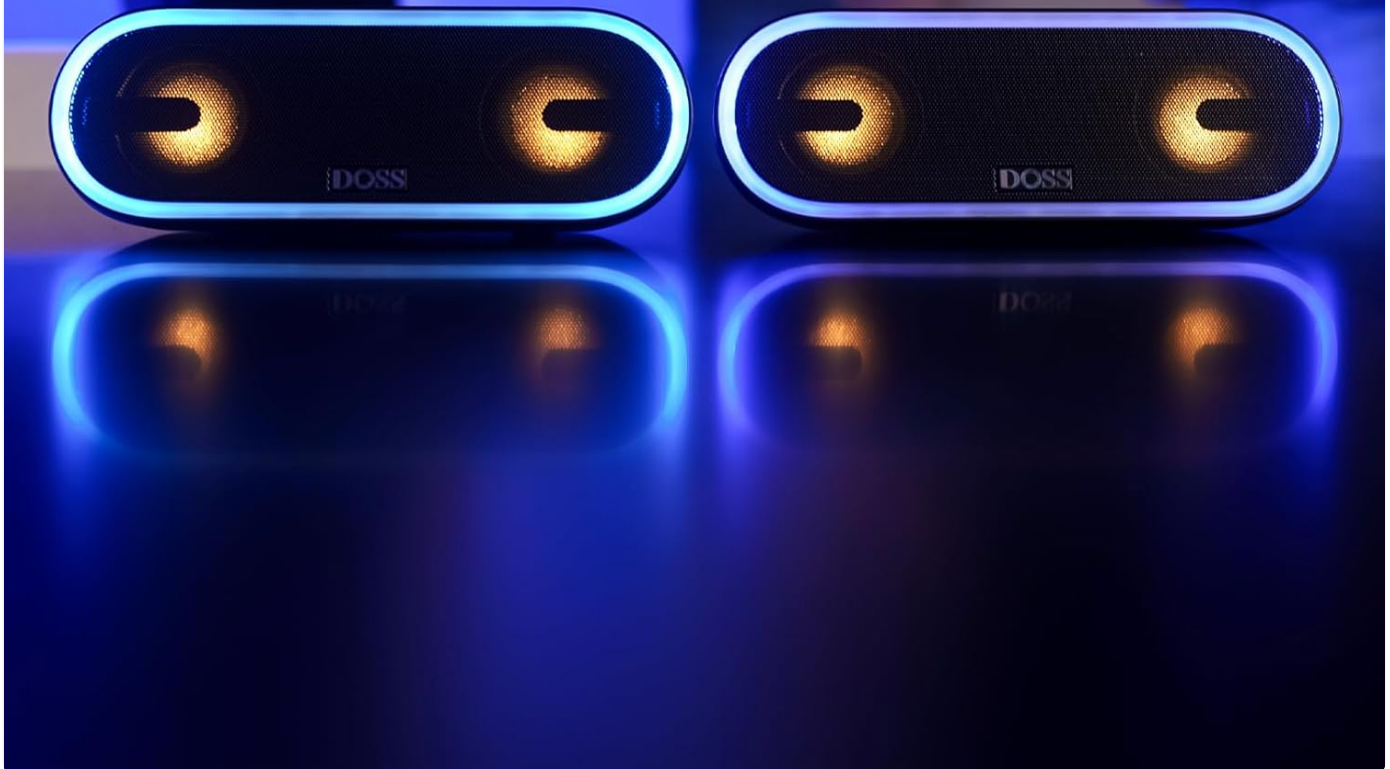
Image: Two DOSS SoundBox Pro+ P300 speakers positioned to demonstrate True Wireless Stereo (TWS) pairing, providing a wider and more powerful soundstage.