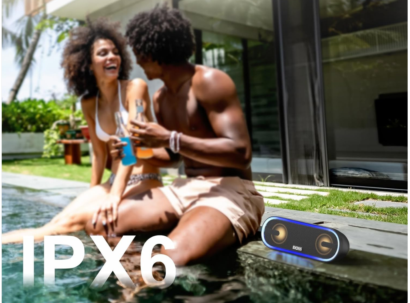
Image: The DOSS SoundBox Pro+ P300 speaker positioned near a swimming pool, illustrating its IPX6 waterproof capability, ideal for beach or poolside use.

Keep the music playing at your beach or poolside party