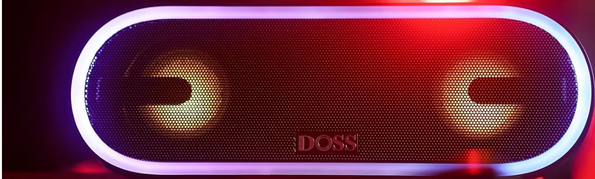
Image: The DOSS SoundBox Pro+ P300 speaker illuminated with its vibrant, beat-synced light show, creating an engaging visual experience.

Elevate your party with pulsating lights