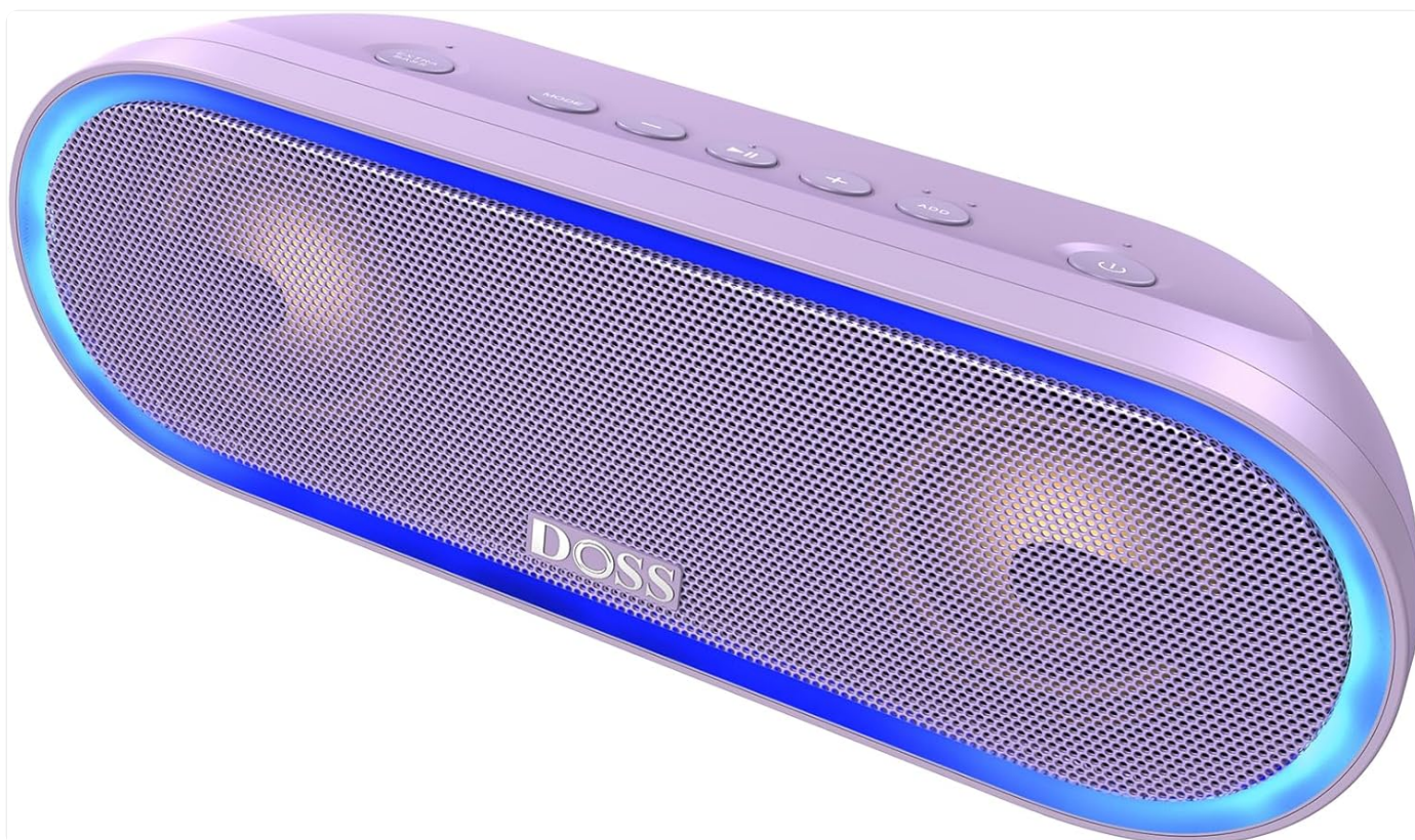
Image: The DOSS SoundBox Pro+ P300 Bluetooth Speaker, showcasing its sleek violet design and illuminated LED accents.

Thank you for choosing the DOSS SoundBox Pro+ P300 Bluetooth Speaker. This manual provides important information regarding the setup, operation, and maintenance of your new speaker. Please read this manual thoroughly before using the product to ensure proper function and safety.