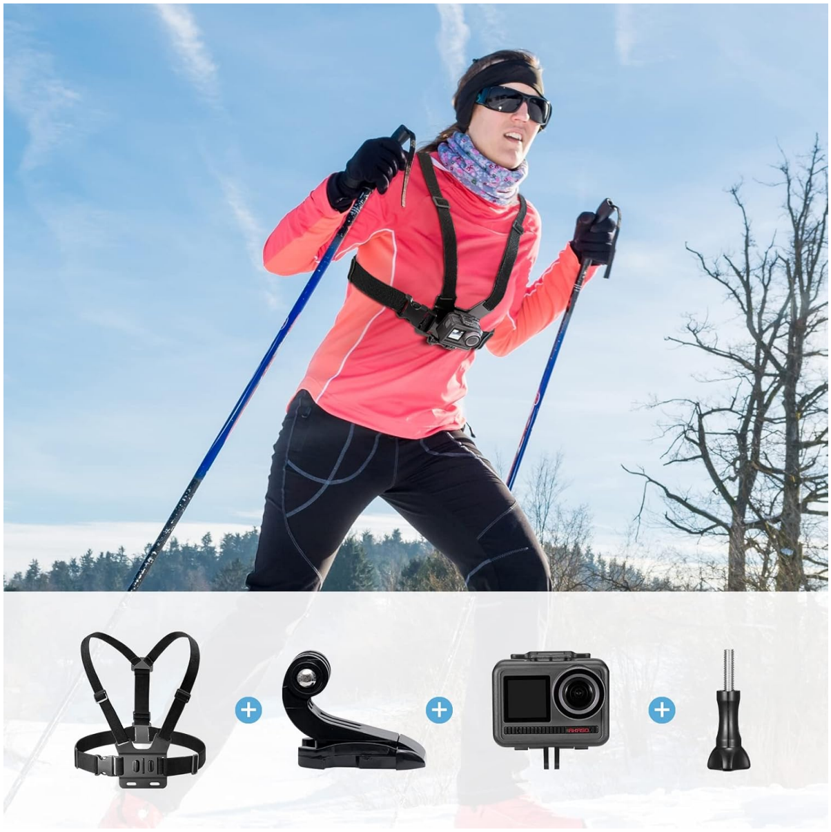
A person skiing while wearing an action camera on a chest strap, capturing dynamic footage.