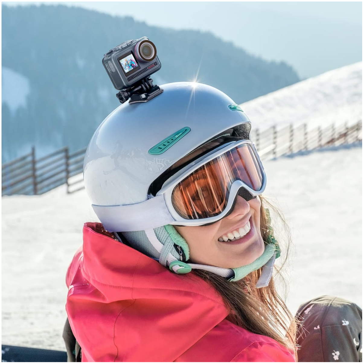
An action camera securely mounted on a helmet, ready for use.