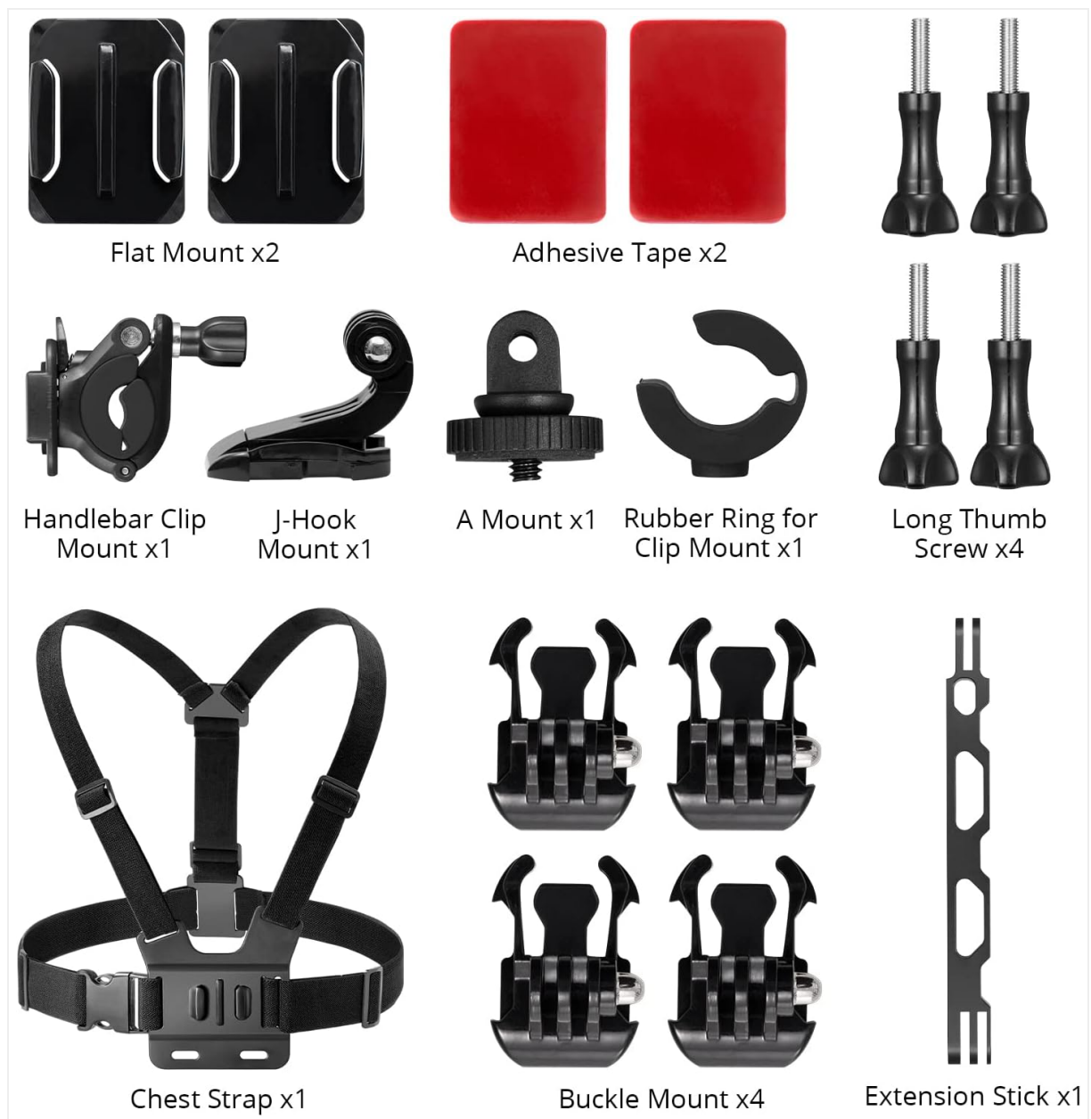
Image showing all components included in the AKASO Action Camera Ski Kit Bundle: Flat Mounts, Adhesive Tapes, Handlebar Clip Mount, J-Hook Mount, A Mount, Rubber Ring for Clip Mount, Long Thumb Screws, Chest Strap, Buckle Mounts, and Extension Stick.