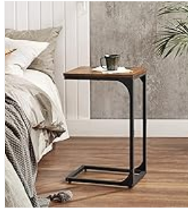
Figure 3.1: Illustration of table components and assembly points.