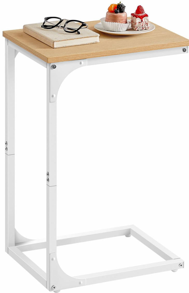
Figure 4.1: The C-shaped table in a living room setting, demonstrating its compact design.