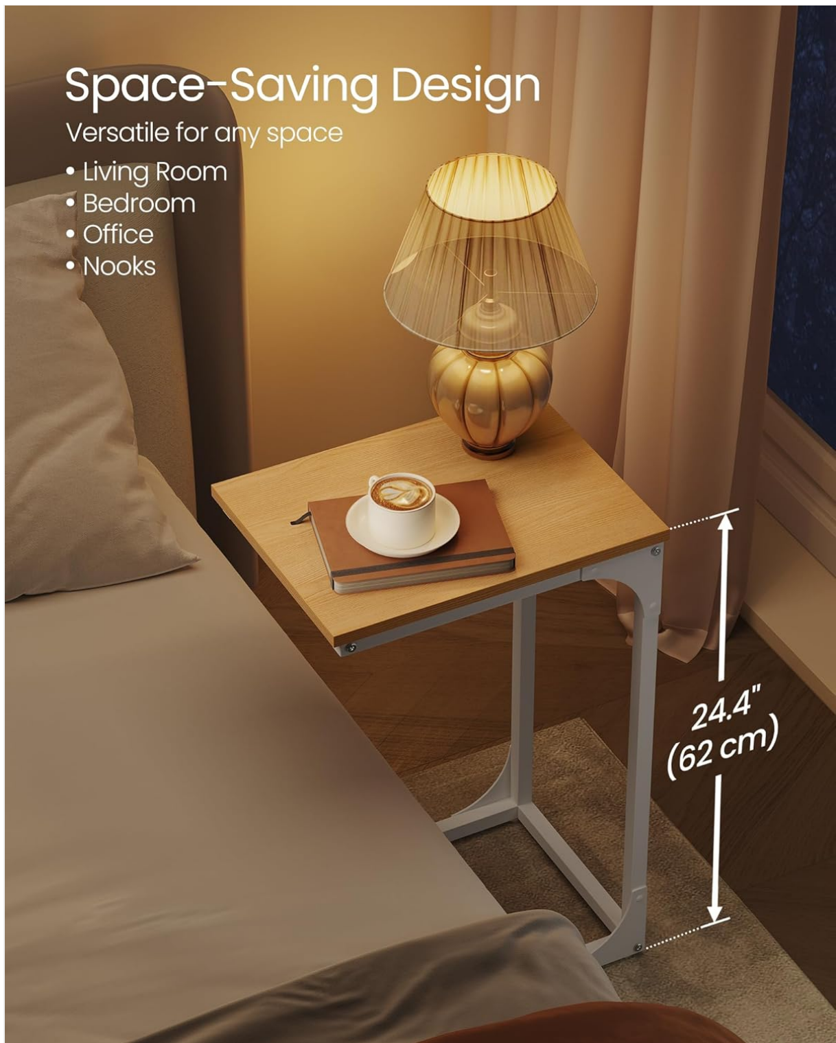
Figure 4.2: The table's dimensions and suitability for bedroom use.