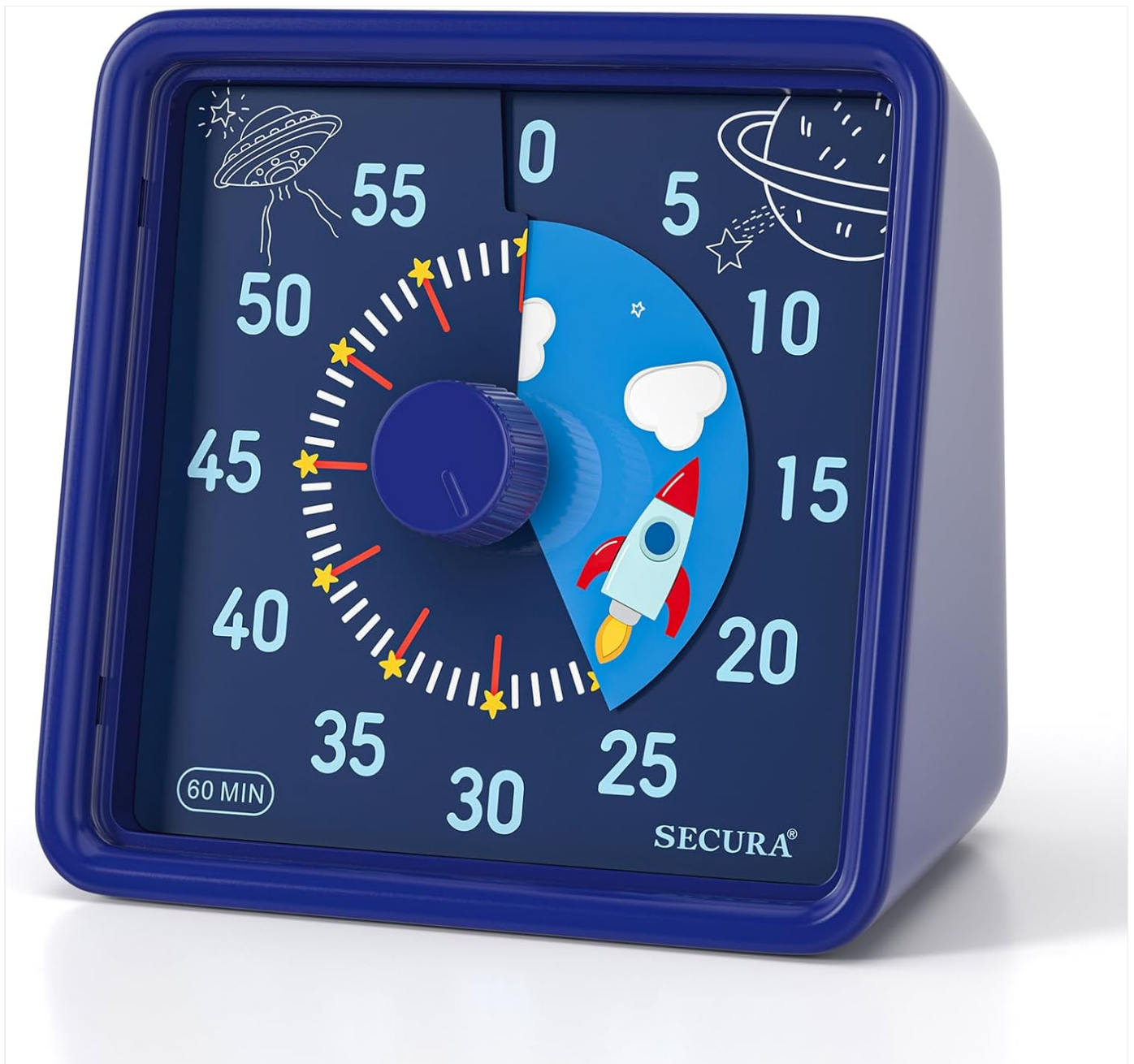
Image: Secura 60-Minute Visual Timer in Navy Blue, featuring a clear dial and cosmic-themed design elements like a rocket and planets. This timer helps users visualize time passing.