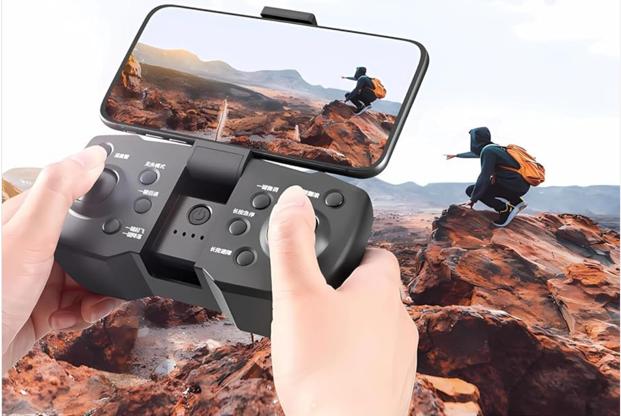
Image: A user controlling the drone with a smartphone mounted on the remote, displaying the live video feed