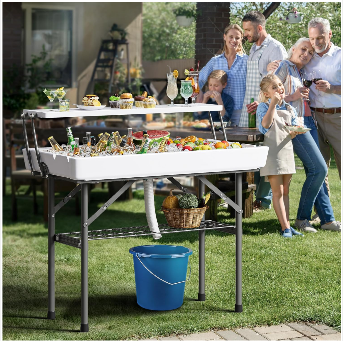
Figure 7: YITAHOME Ice Table in use at an outdoor gathering.

The table's folding design allows for compact storage and easy transport. Simply fold down the legs and detach any accessories for convenient portability using the side handles.