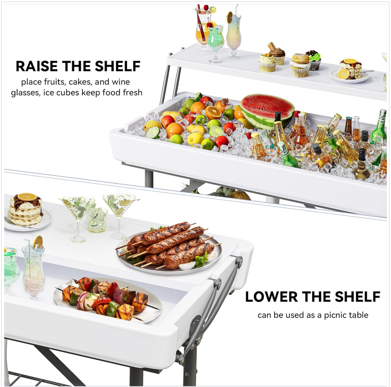
Figure 5: Upper shelf in use.