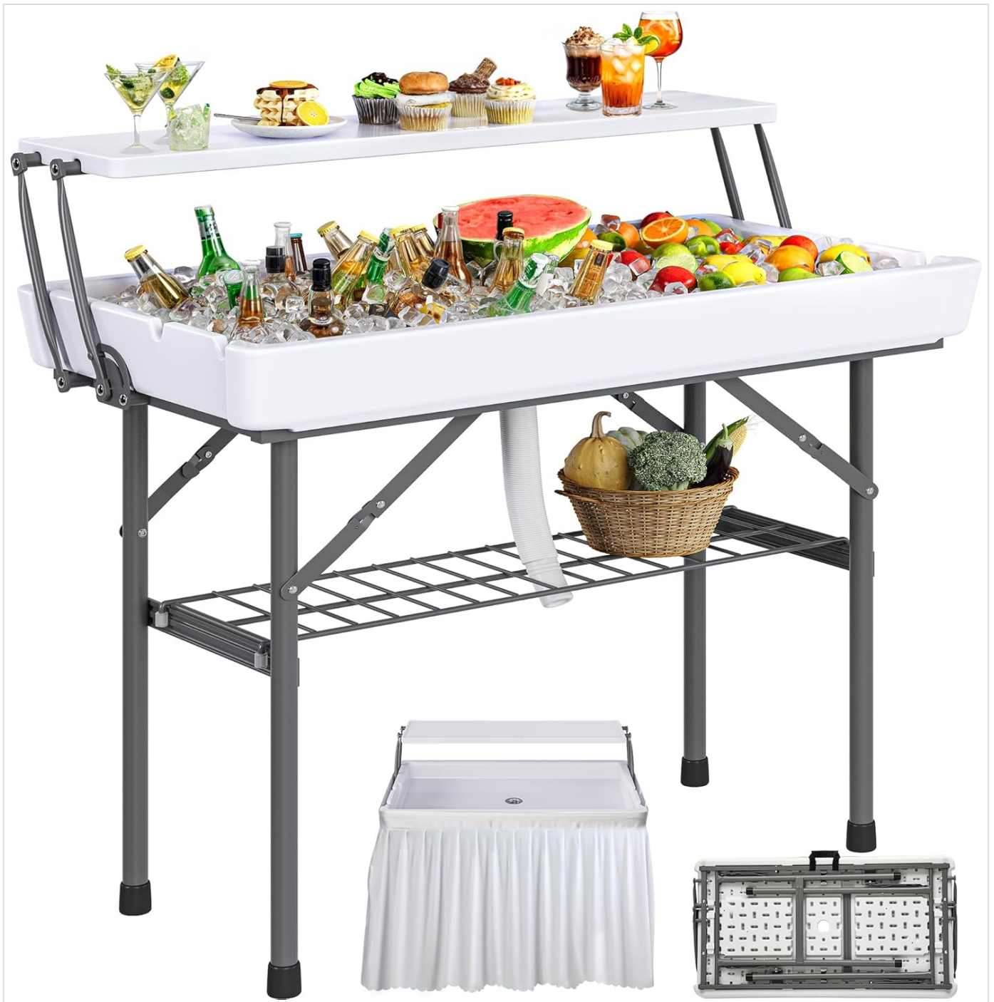
Figure 1: Overview of YITAHOME Two-Tier Ice Table components.