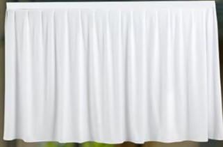
Detachable Table Skirt

Foldable design minimizes storage space, it's lightweight and easy to transport