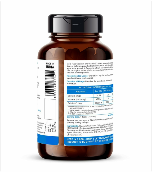
Image 3.1: Back label of the product bottle, detailing nutritional information and ingredients.