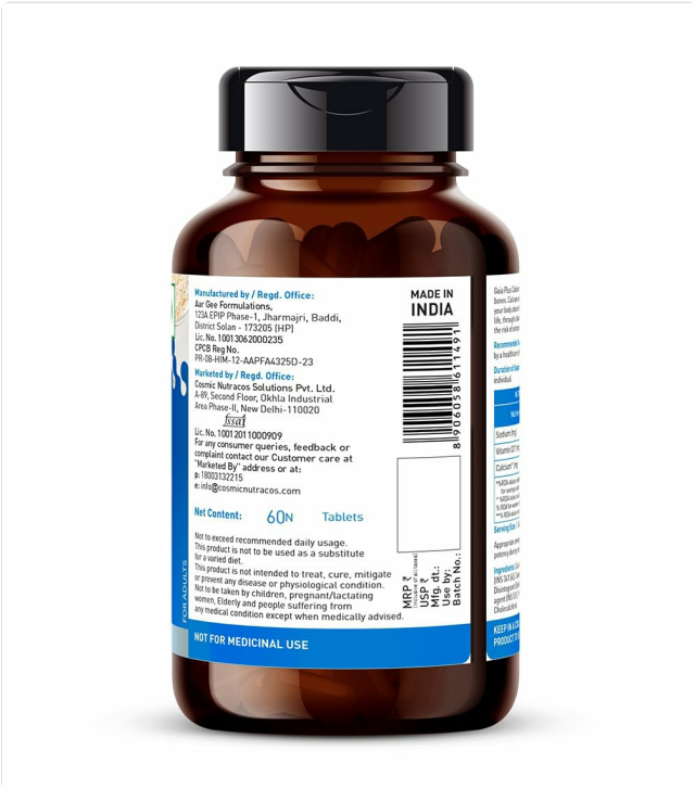
Image 5.1: Back label of the product bottle, detailing warnings, precautions, and manufacturer information.