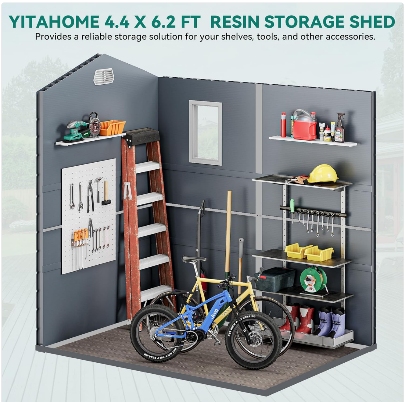
Image: Interior view of the shed showcasing its storage capacity with a bicycle, ladder, and shelves.

Provides a reliable storage solution for your shelves, tools, and other accessories.