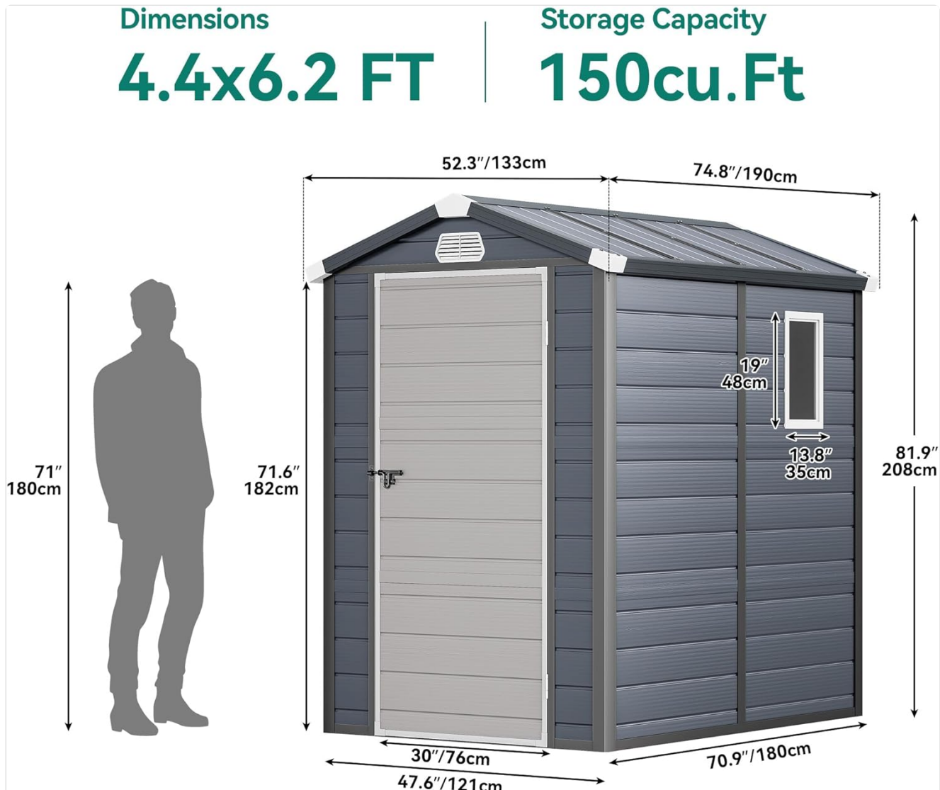
Image: Detailed dimensions of the 4.4x6.2FT YITAHOME Outdoor Resin Storage Shed.

Video: Assembly steps for the foundation of a YITAHOME resin storage shed. Note: This video demonstrates assembly for a similar YITAHOME shed model (7.87x6.2FT); specific part numbers or dimensions may vary slightly from your 4.4x6.2FT model, but the general assembly process is applicable.