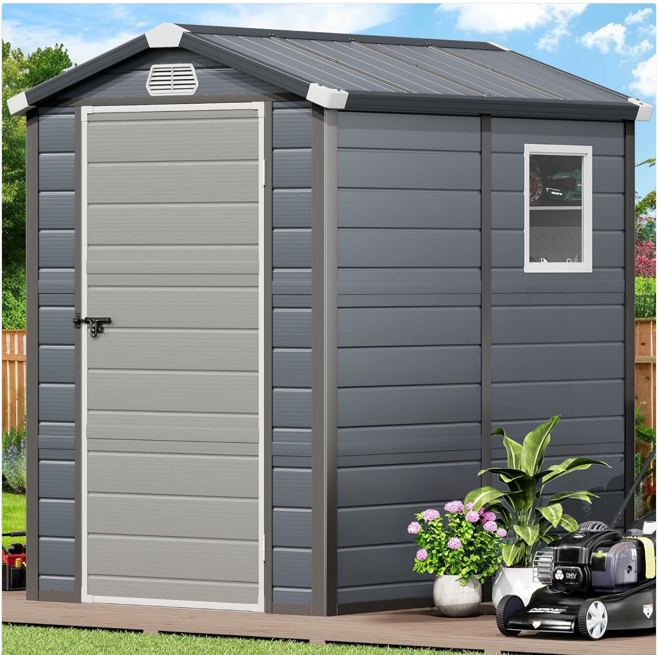
Image: Exterior view of the YITAHOME storage shed, highlighting the roof design and overall appearance in a garden setting.

Assemble the roof panels and attach them to the top of the wall structure. Ensure the sloped design is correctly oriented for water drainage.