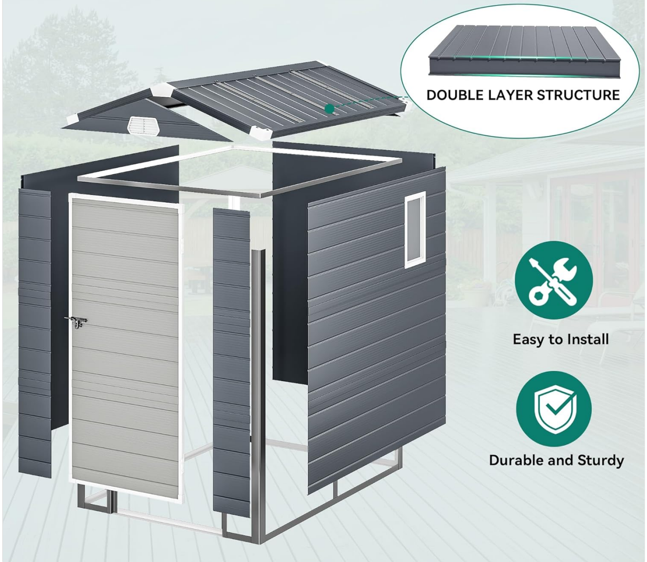
Image: Exploded view illustrating the double-layer resin panels and the easy installation process of the shed structure.

Double-layer resin panels for extra strength