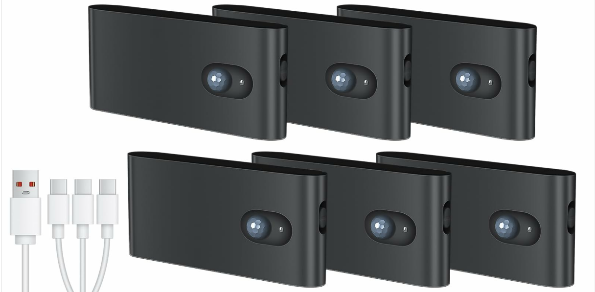
Image: The main product image of the WILLED Rechargeable Motion Sensor Night Light.