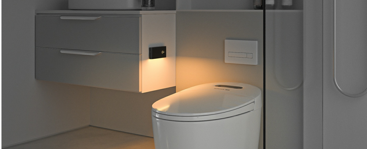
Image: A collage of images demonstrating the night lights installed in different home environments, including a hallway, bedroom, and bathroom, highlighting their versatility.