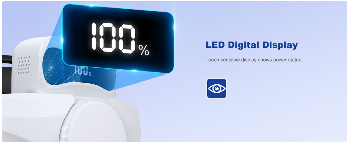
Image: The Kawaye MQ031 head strap with its integrated USB-C cable connected to a Meta Quest headset, showing the battery pack's digital display.

Locate the USB-C cable integrated into the head strap. Plug the USB-C connector into the charging port of your Meta Quest 2 or Quest 3 headset. This will initiate charging and power delivery from the battery pack.