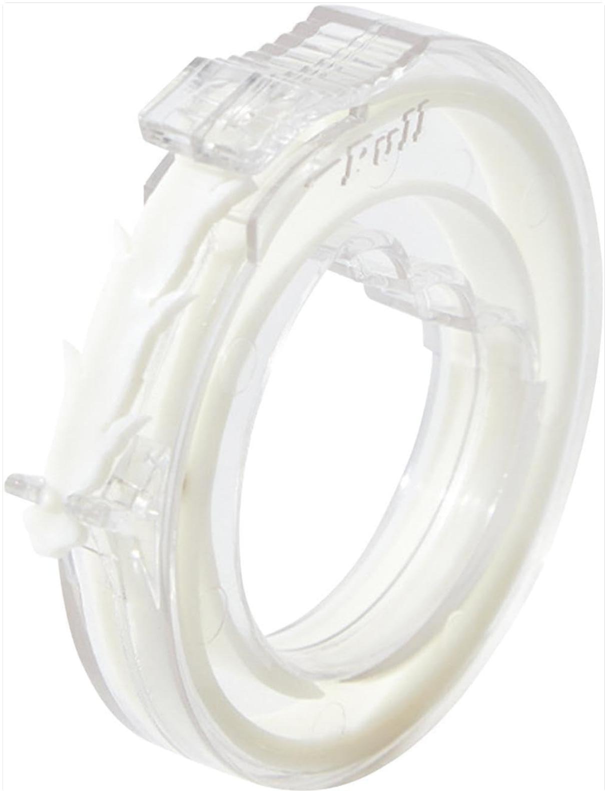
The retractable drain cleaning brush in its compact, coiled storage form.