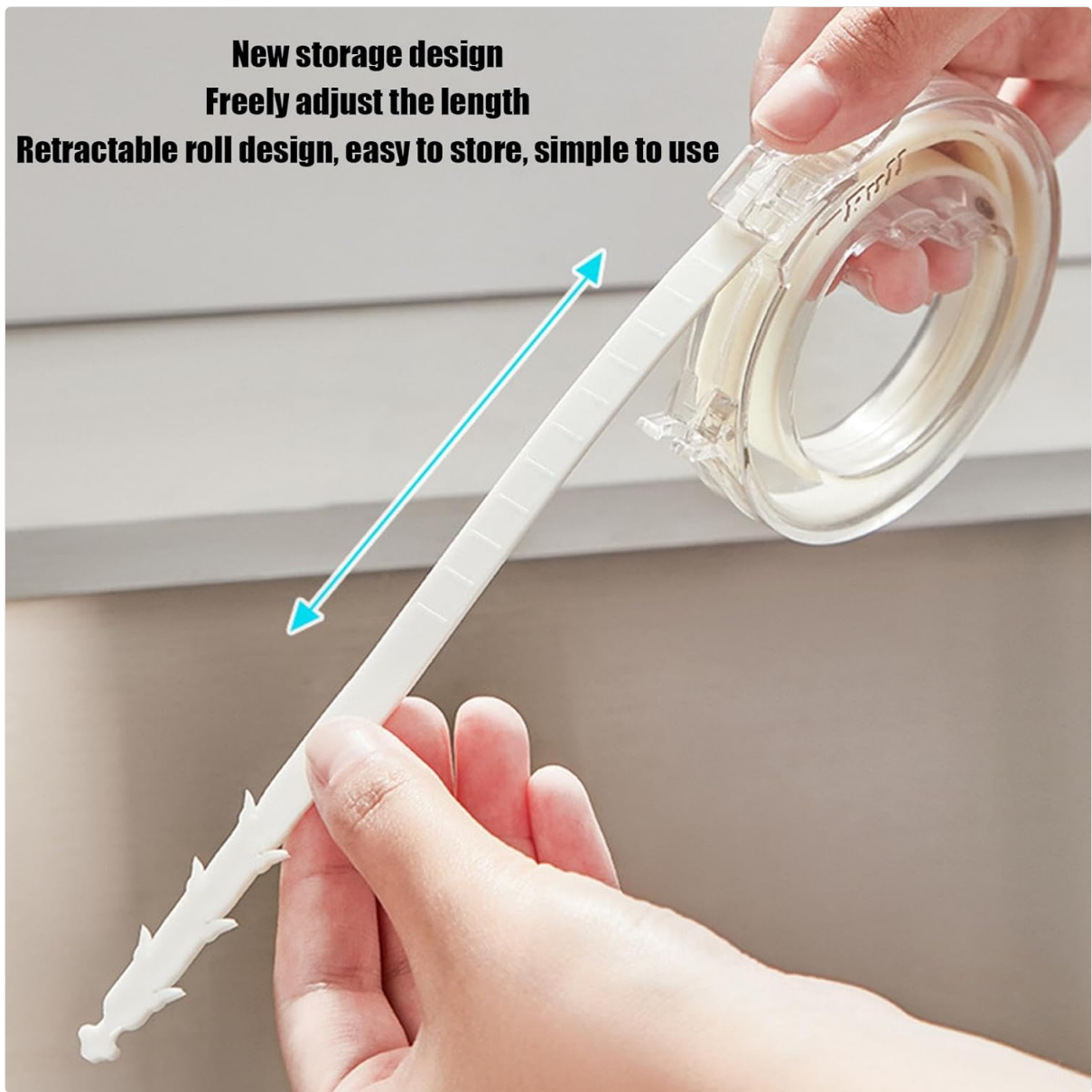
Illustration showing how the brush extends and retracts, highlighting its adjustable length and easy storage.

New storage design Freely adjust the length Retractable roll design, easy to store, simple to use