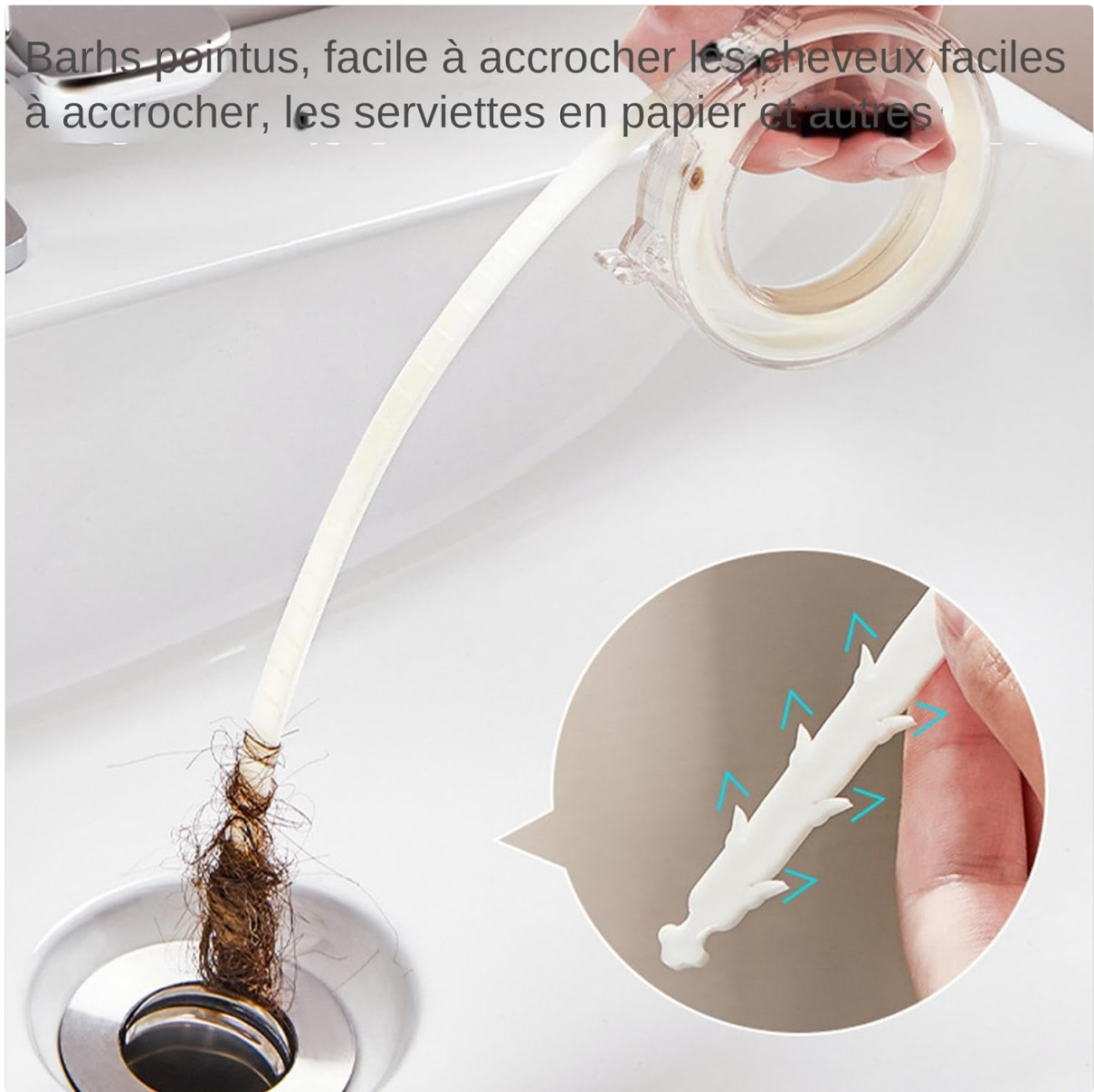
A close-up of the pointed barbs designed to easily hook and pull out hair, paper towels, and other common drain blockages.

Barbs pointus, facile à accrocher les cheveux faciles à accrocher, les serviettes en papier et autres