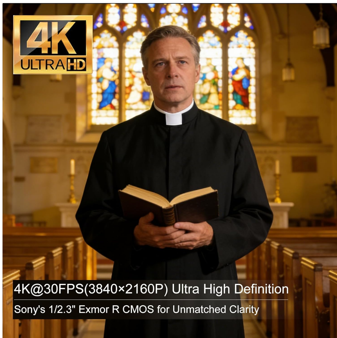
Figure 13: 4K@30FPS (3840x2160P) Ultra High Definition with Sony's 1/2.3" Exmor R CMOS sensor.

Key features include a professional Tally light for clear on-air cues and a 58mm filter thread for attaching ND or polarizing filters, allowing for perfect exposure control in diverse lighting conditions.