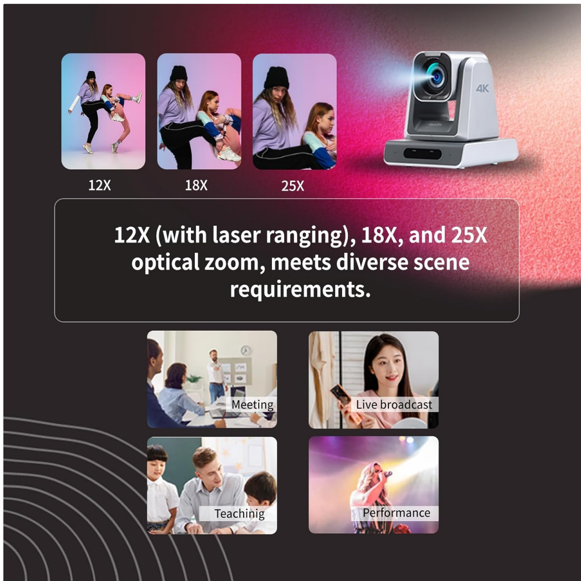
Figure 4: Optical zoom options (12X, 18X, 25X) to meet diverse scene requirements.