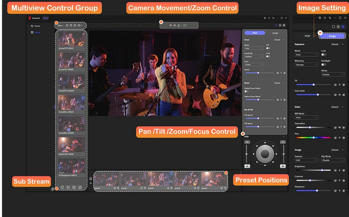
Figure 3: ZowieX App for easy overall management of the camera.