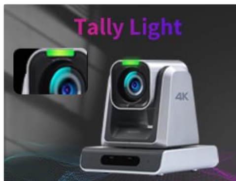
Figure 15: The Tally light provides clear visual cues for live production.