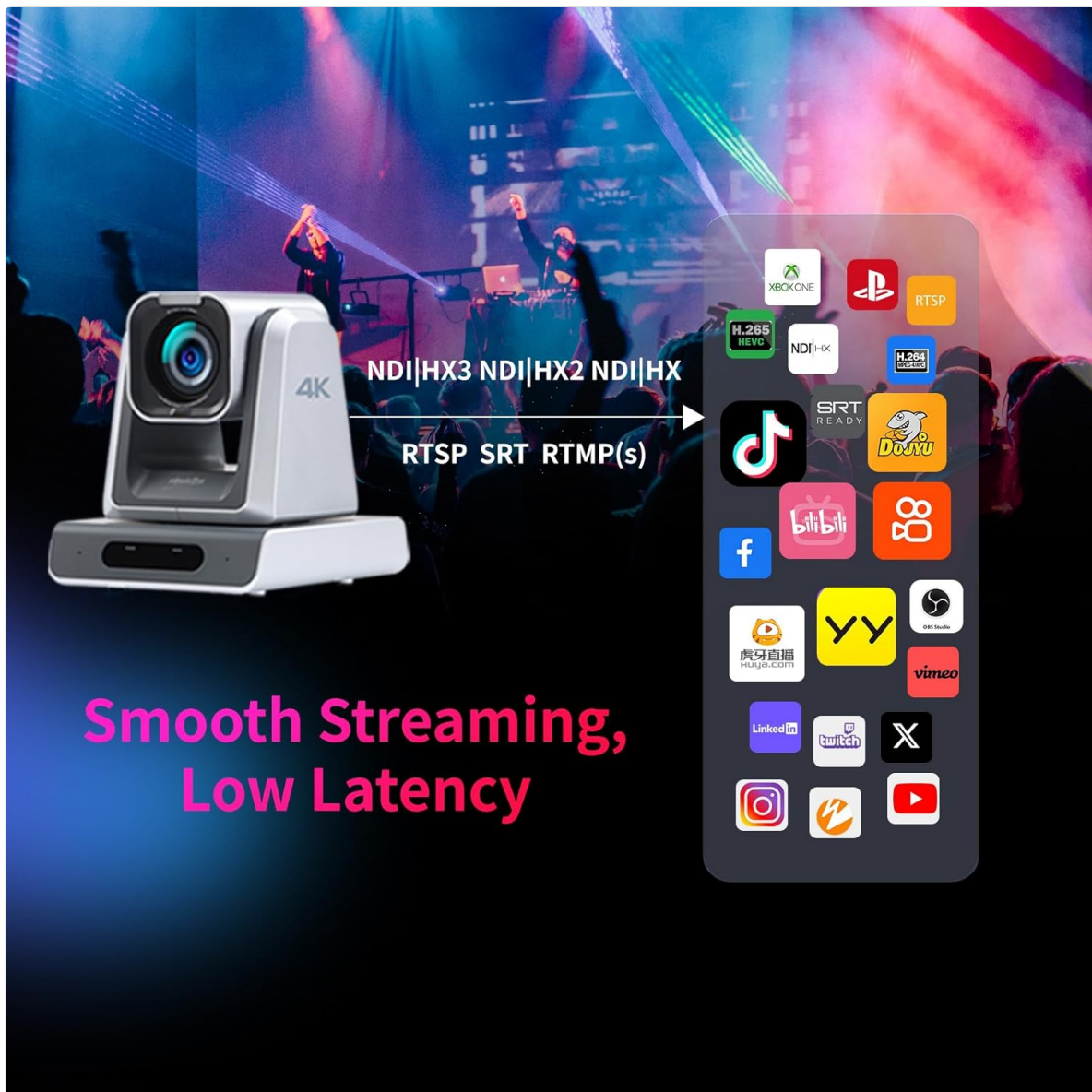
Figure 8: Smooth streaming and low latency to various platforms supported by the ZowiePTZ camera.