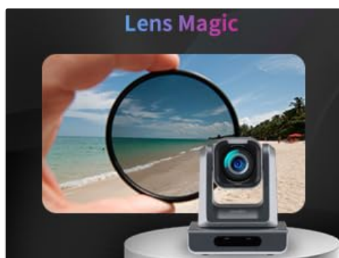
Figure 16: The 58mm filter thread allows for various lens filters to enhance image quality.