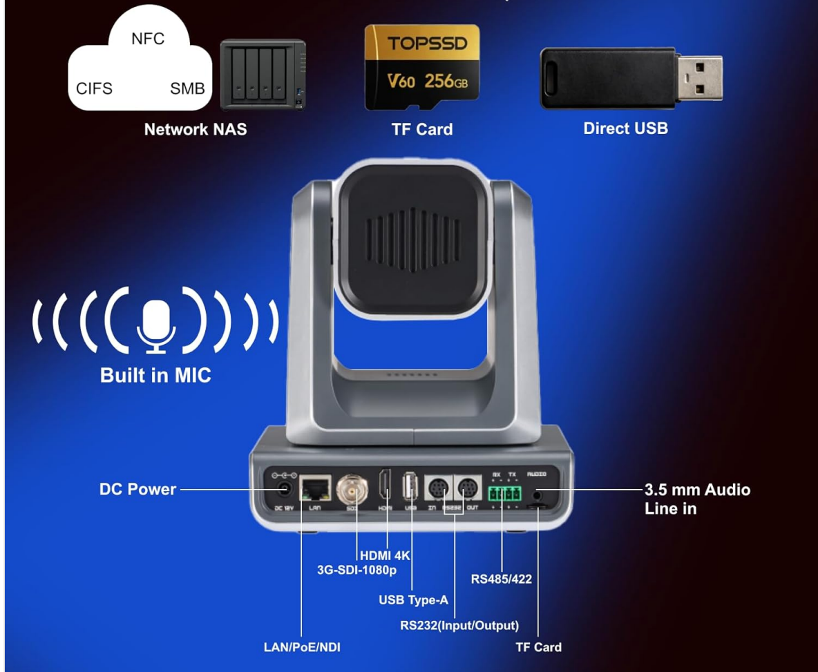
Figure 11: Triple-redundant recording options for secure local and network backup.

Capture Every Moment with Unfailing Local and Network Backup.