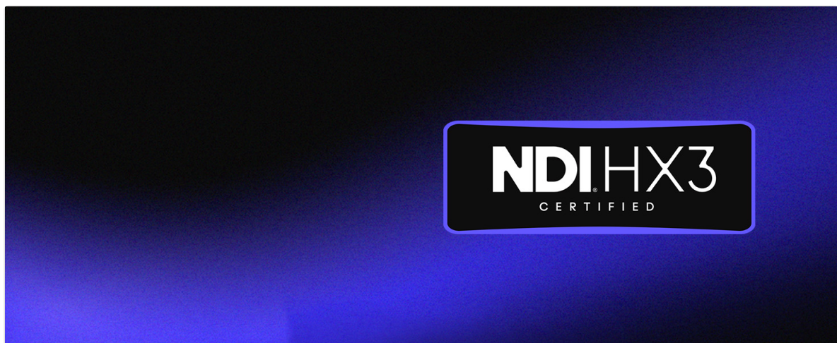
Figure 9: NDI|HX3 Certified for high-quality, low-latency video streams.