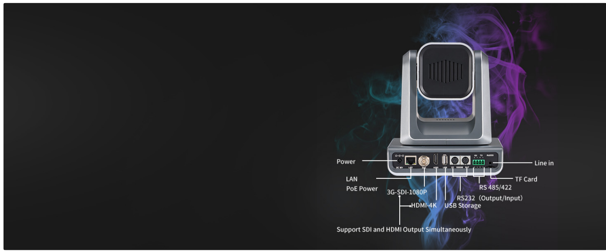
Figure 10: Rich interface with multiple input/output options including SDI, HDMI, USB, and LAN/PoE/NDI.