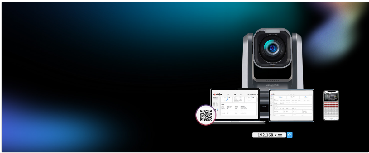
Figure 5: Accessing the camera's exclusive web UI for configuration and control.