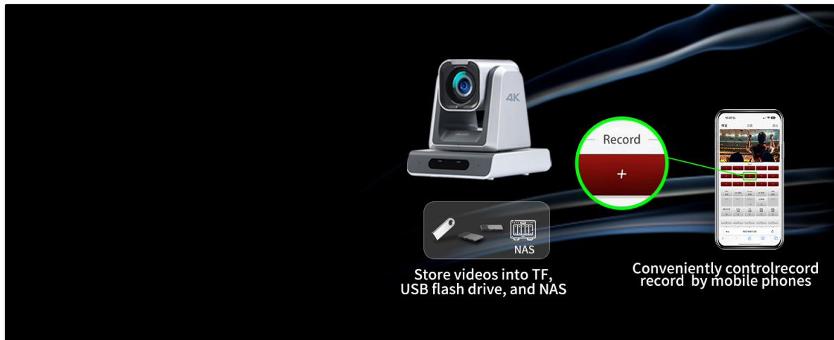
Figure 12: Conveniently record and store videos to TF card, USB flash drive, and NAS.