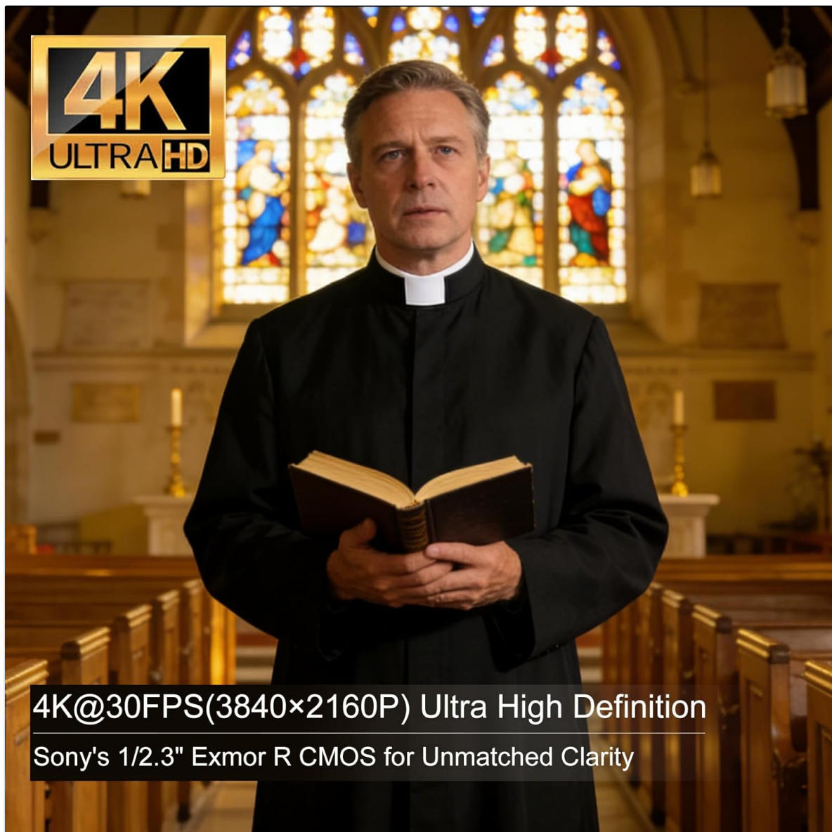
Figure 1: Zowietek 4K PTZ Camera showcasing 4K Ultra HD video quality.