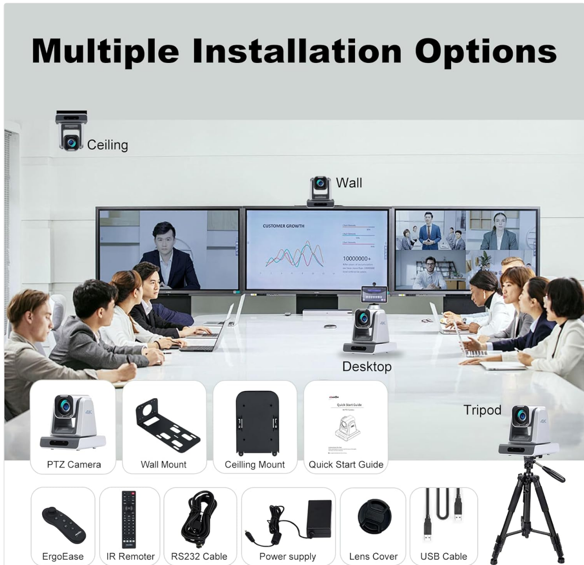
Figure 17: Multiple installation options for the ZowiePTZ camera, including ceiling, wall, desktop, and tripod mounts.

The ZowiePTZ camera supports multiple installation options to suit various environments. It can be mounted on the ceiling, wall, placed on a desktop, or attached to a tripod. This flexibility ensures optimal camera placement for any setup.