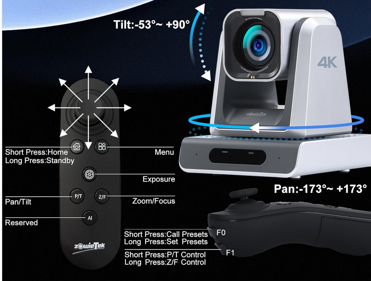
Figure 2: The Ergo-Ease Remote Control for smooth and silent camera movement.