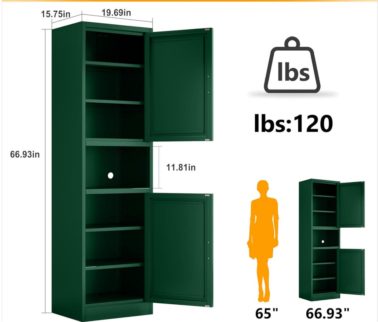
Image: Product dimensions and weight capacity details.