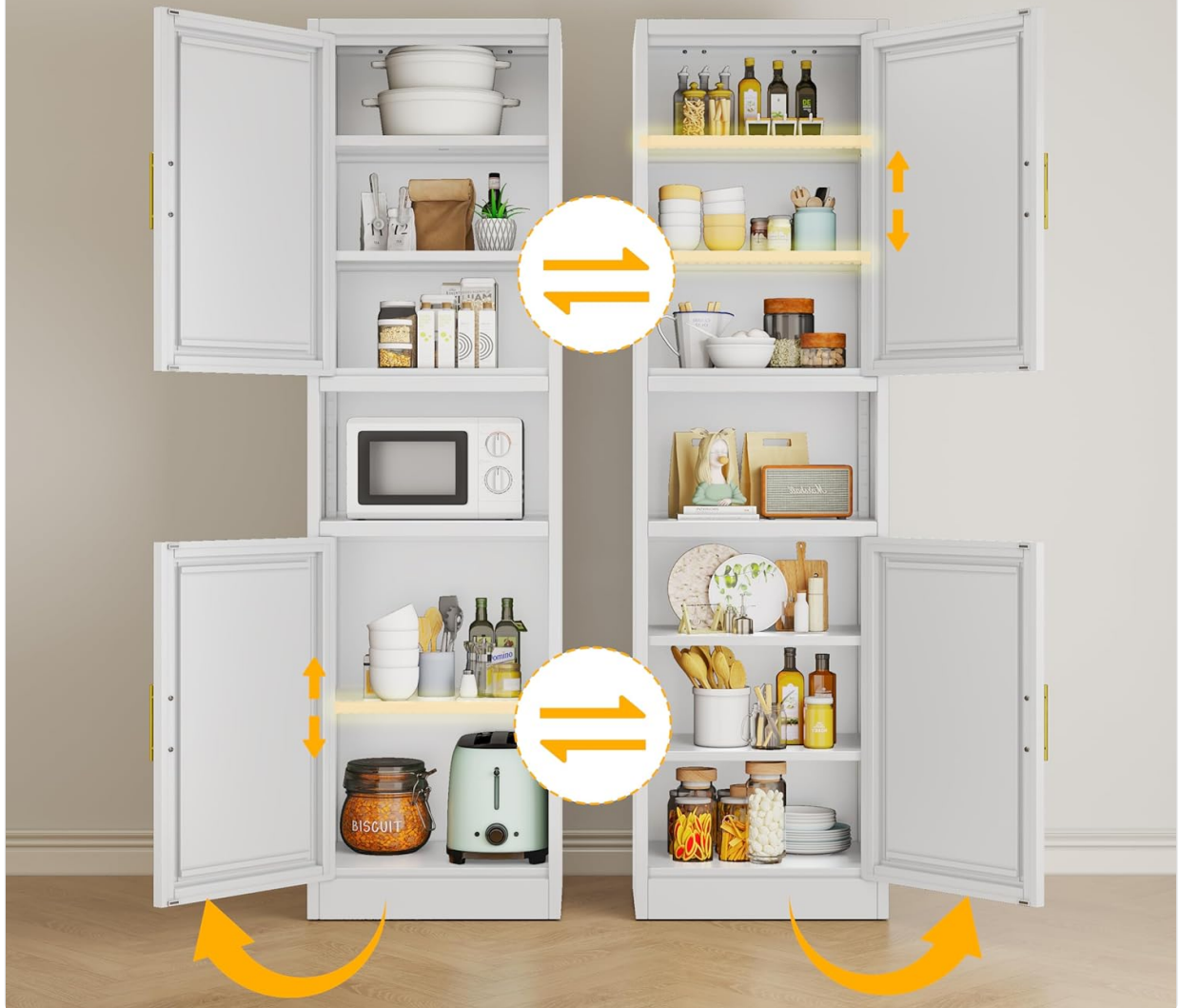
Image: Adjustable shelves and changeable door orientation for flexible storage.