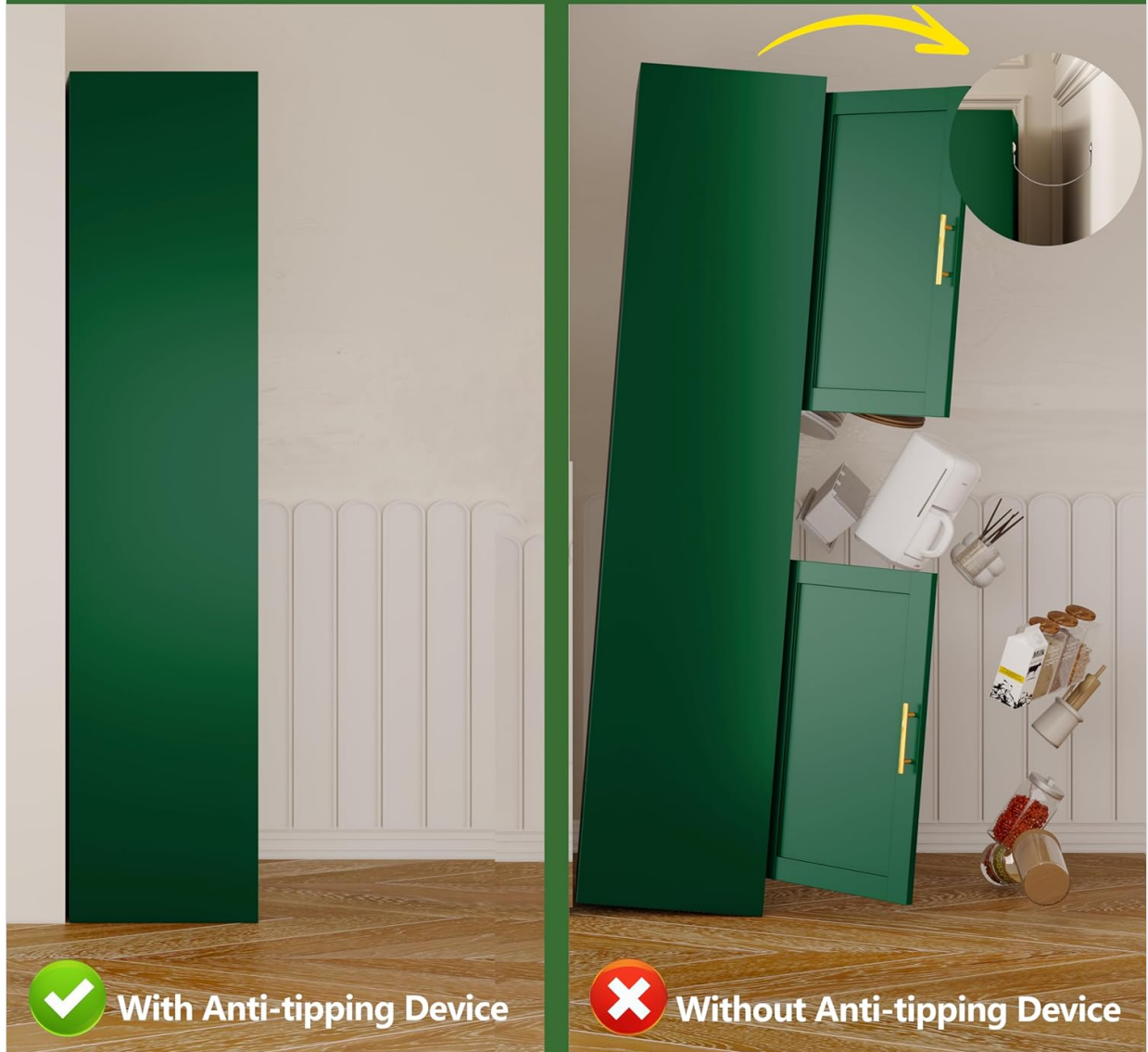
Image: Anti-tipping design protects your family's safety.