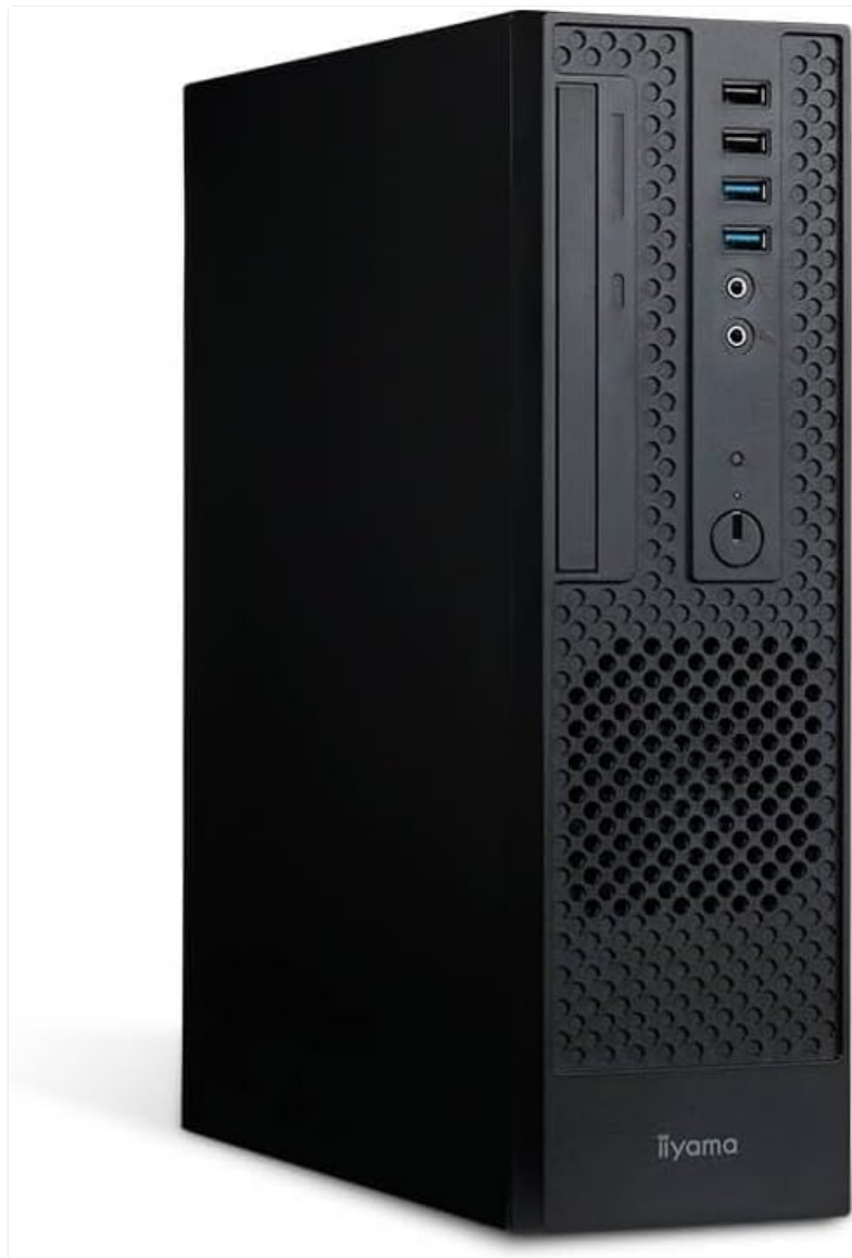
Figure 1.1: iiyama PC STYLE INFINITY Desktop PC (Angled View)

The compact design of this PC makes it suitable for various home and office environments.