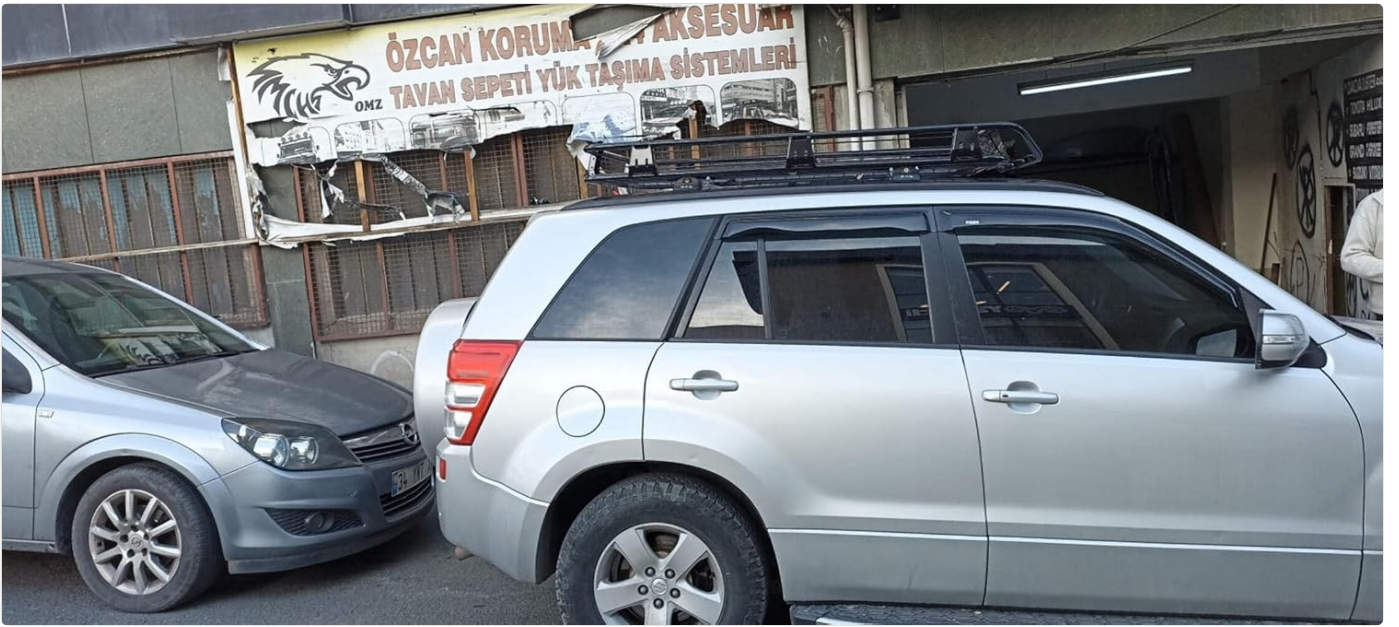
Image: A vehicle demonstrating the use of the auto paw roof rack system with an attached cargo basket, illustrating its versatility for carrying various items.