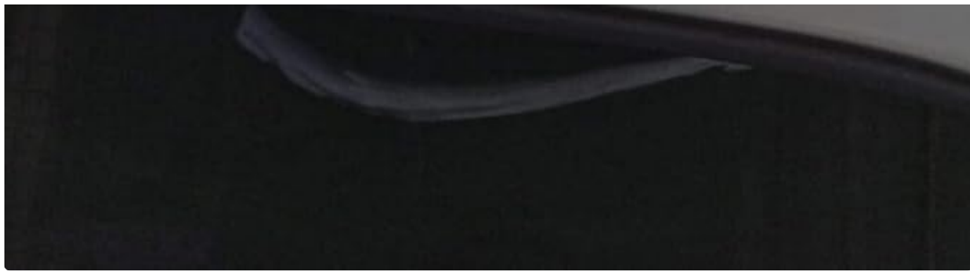
Image: A close-up view of the integrated metal lock system on the auto paw roof rack, showing the key inserted.