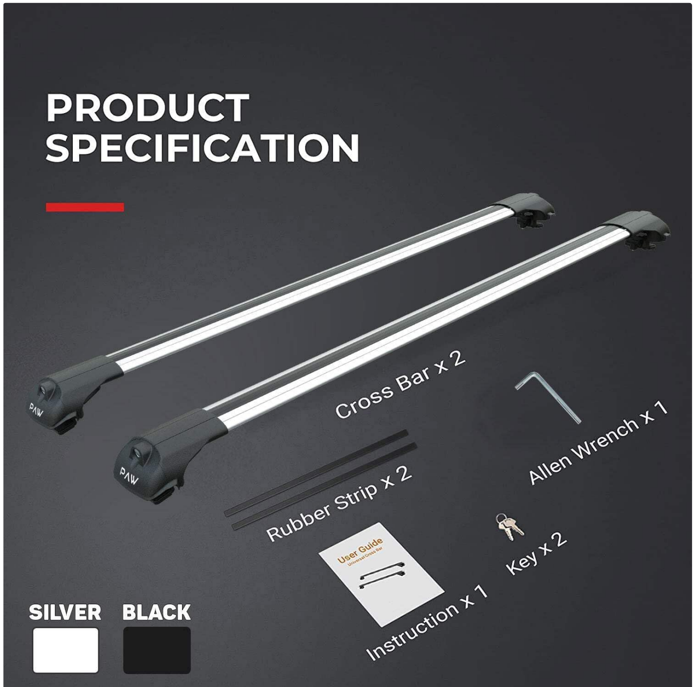
Image: All components included in the auto paw Pro 1 Series Roof Rack System package, including cross bars, keys, Allen wrench, rubber strips, and user guide.