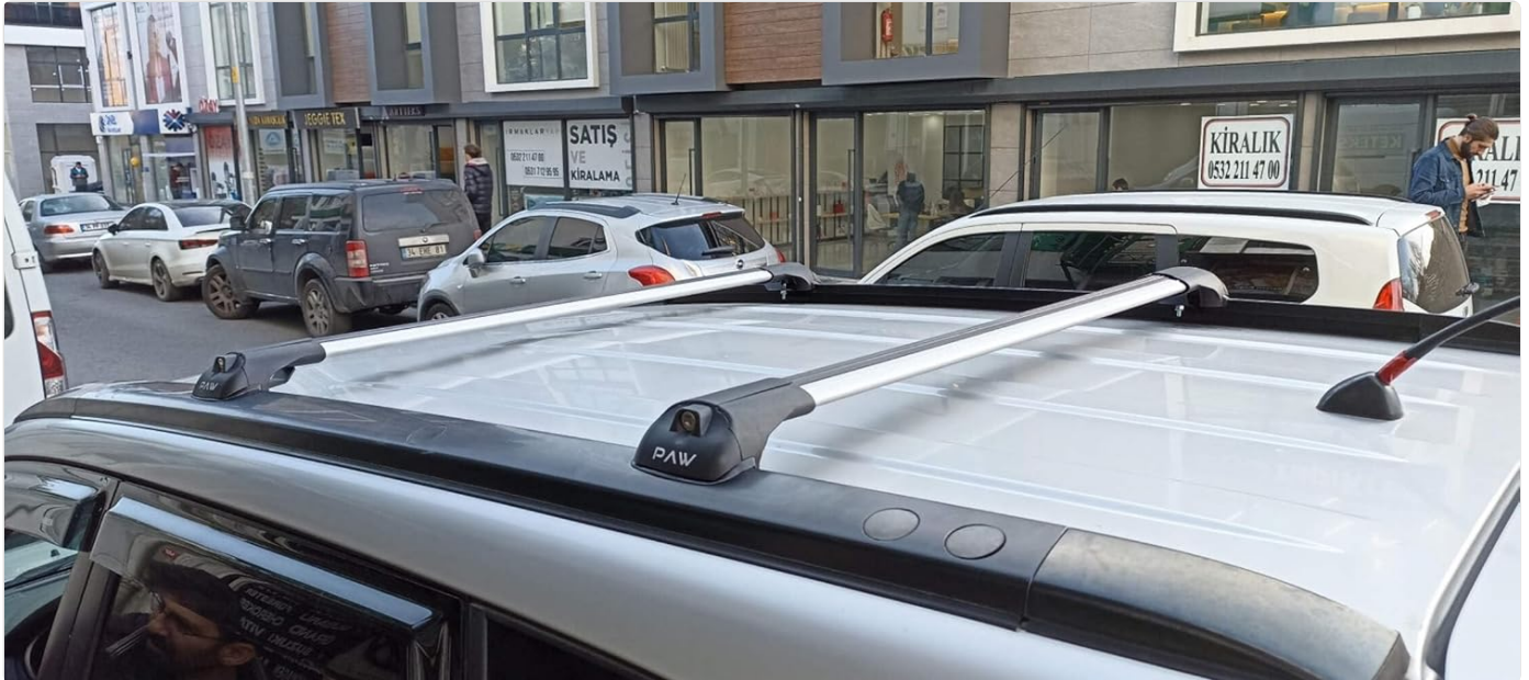
Image: The auto paw roof rack system securely installed on a vehicle's raised roof rails, viewed from above.