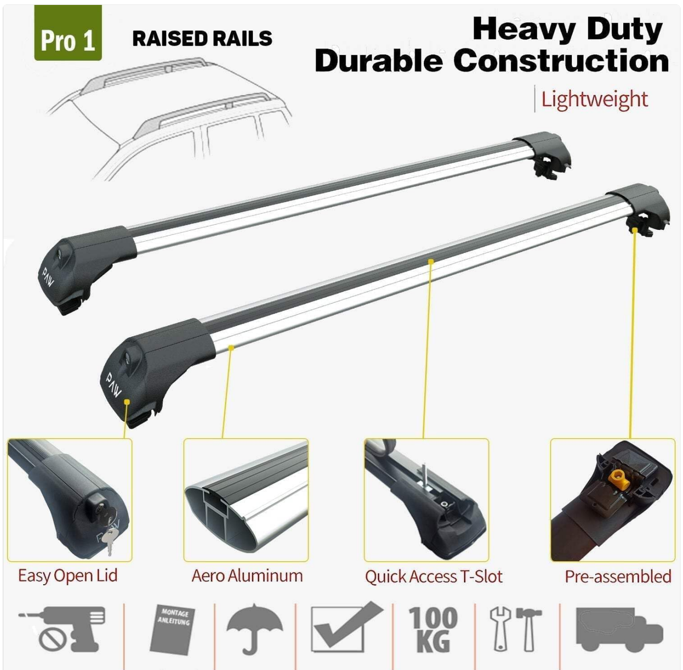
Image: Key features highlighting the pre-assembled nature, easy-open lid, and quick access T-slot for installation.