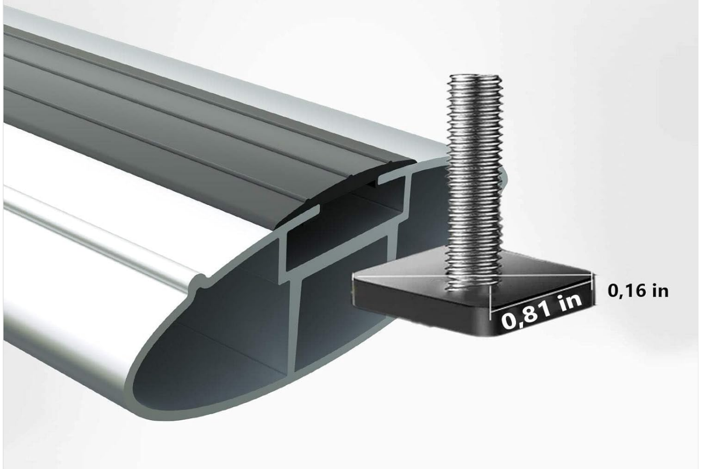
Image: A diagram illustrating the dimensions of the T-bolt slot (20mm / 0.81 inches) on the auto paw crossbars, confirming compatibility with standard T-track accessories.

Confirm the Dimension of the Crossbars T-track Before Purchase