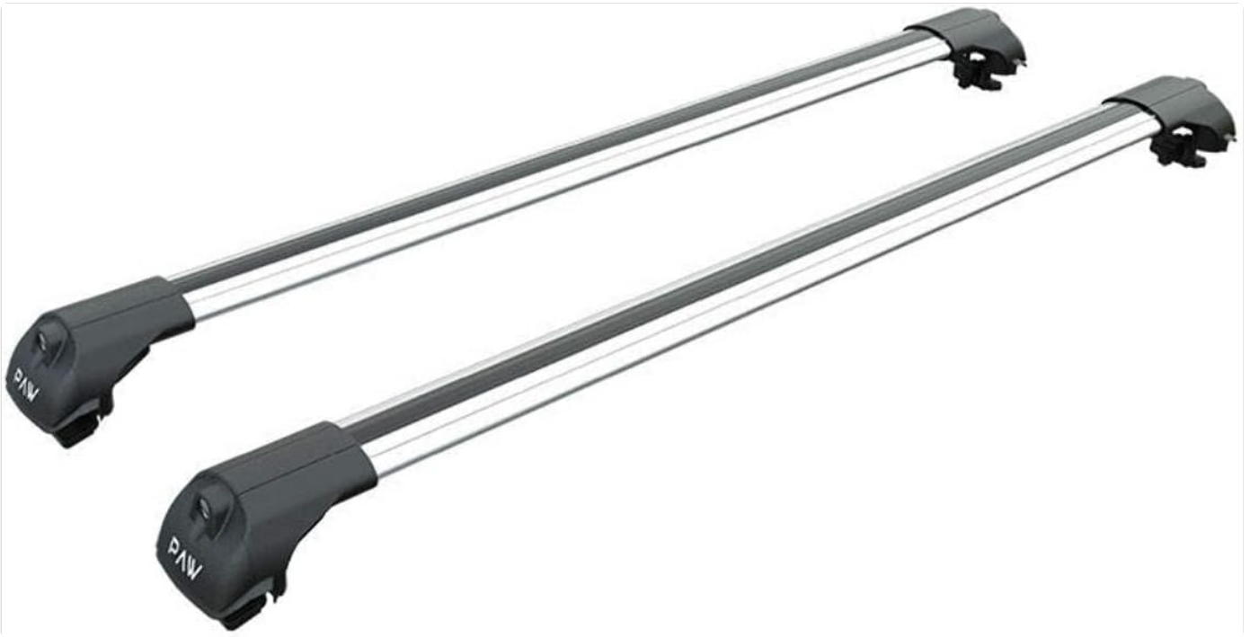
Image: The auto paw Pro 1 Series Roof Rack System, showcasing the two aluminum cross bars with black end caps.