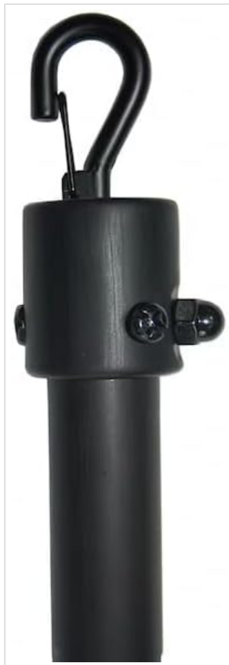
Close-up image of the fan's hanging hook and downrod connection point, showing the robust design.