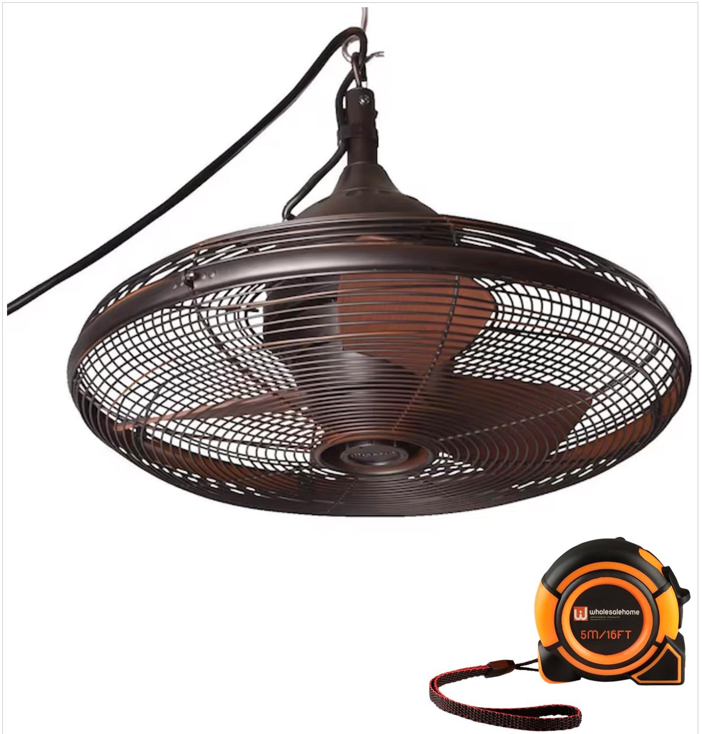
Image of the complete Harbor Breeze Valdosta ceiling fan with a tape measure for scale, showing its overall design and size.