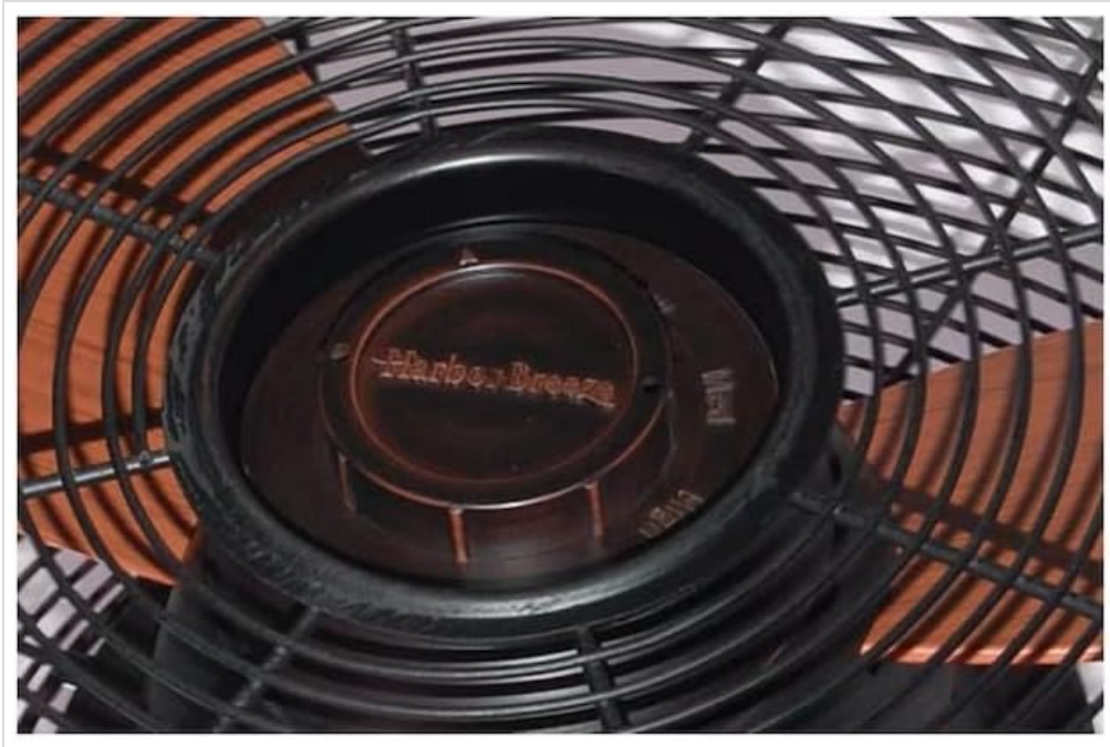
Close-up image of the fan's central hub, showing the 'Harbor Breeze' branding and clearly marked speed settings (Off, Low, Med, High) for manual adjustment if needed.

Point the remote control directly at the fan's receiver. Press the designated buttons for power on/off and speed adjustment. Ensure the remote has fresh batteries for optimal performance.