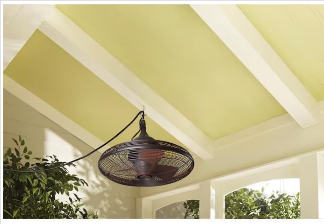
Image showing the Harbor Breeze Valdosta fan installed under a light-colored ceiling with exposed beams, demonstrating a typical ceiling mount.