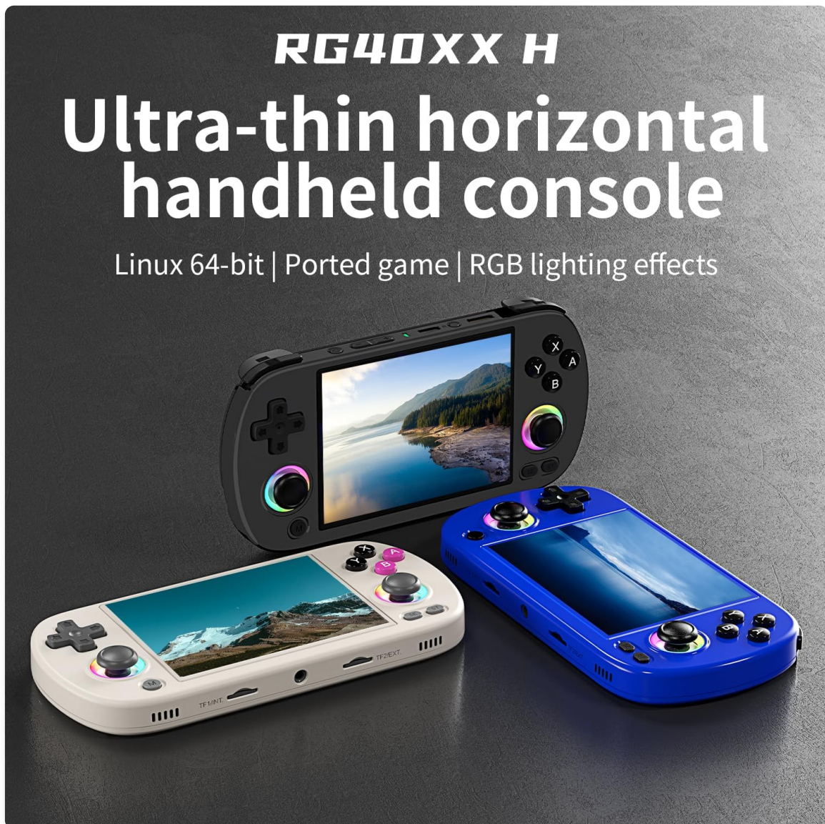
Image: The console's control layout, featuring the D-pad, action buttons, and illuminated joysticks.

The RG40XX H features a standard layout for portable gaming, including a D-pad, action buttons (A, B, X, Y), start, select, and dual analog joysticks. Familiarize yourself with the button layout for optimal gameplay.