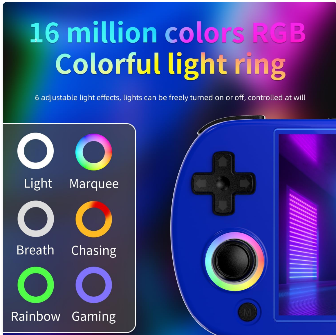
Image: Visual representation of the various RGB lighting modes available for the joysticks.

The joysticks feature customizable RGB lighting with 16 million colors. You can adjust the lighting effects to constant, breathing, rainbow, marquee, chasing, or gaming modes. Refer to the system settings for options to customize color and brightness.