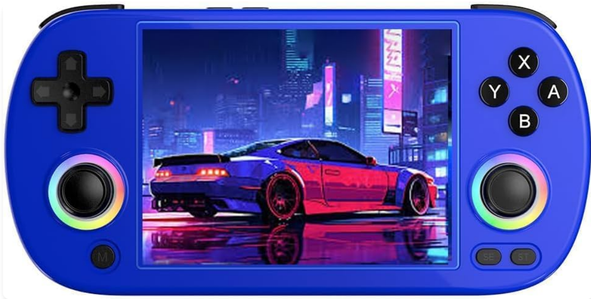
Image: The Astarama RG40XX H console, available in multiple colors, highlighting its compact design and illuminated joysticks.