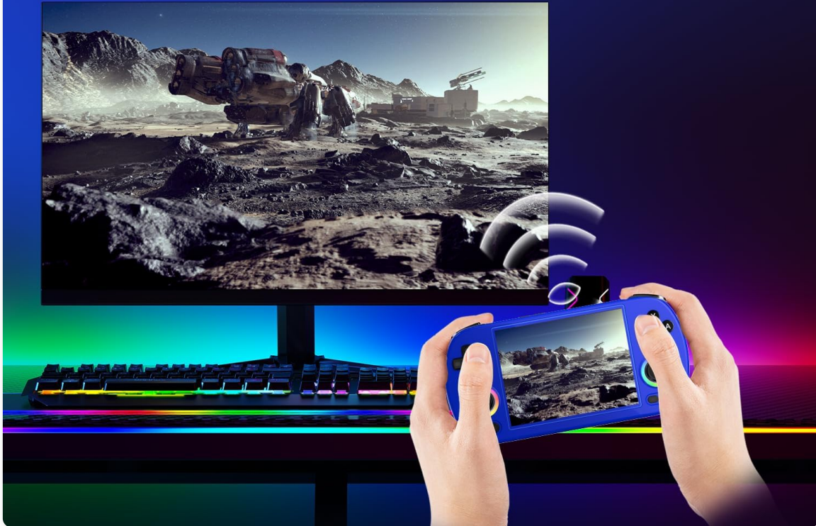
Image: The console demonstrating Moonlight Streaming functionality, allowing users to play PC games wirelessly.