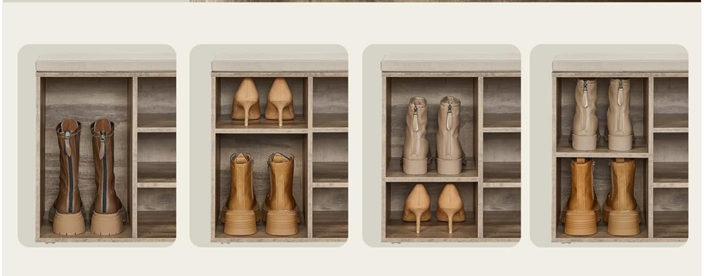
Image 5.2: Detail of the adjustable side shelves, illustrating their flexibility for various footwear sizes.