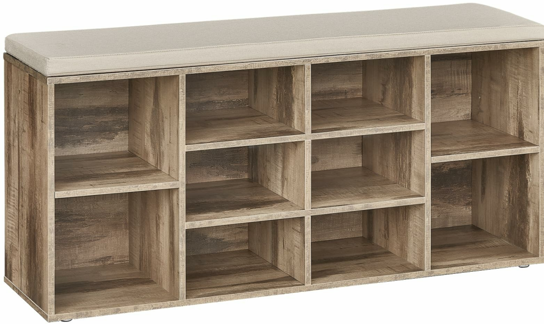
Image 1.1: The VASAGLE CUSTOS Collection Shoe Bench with 10 compartments and a padded seat.