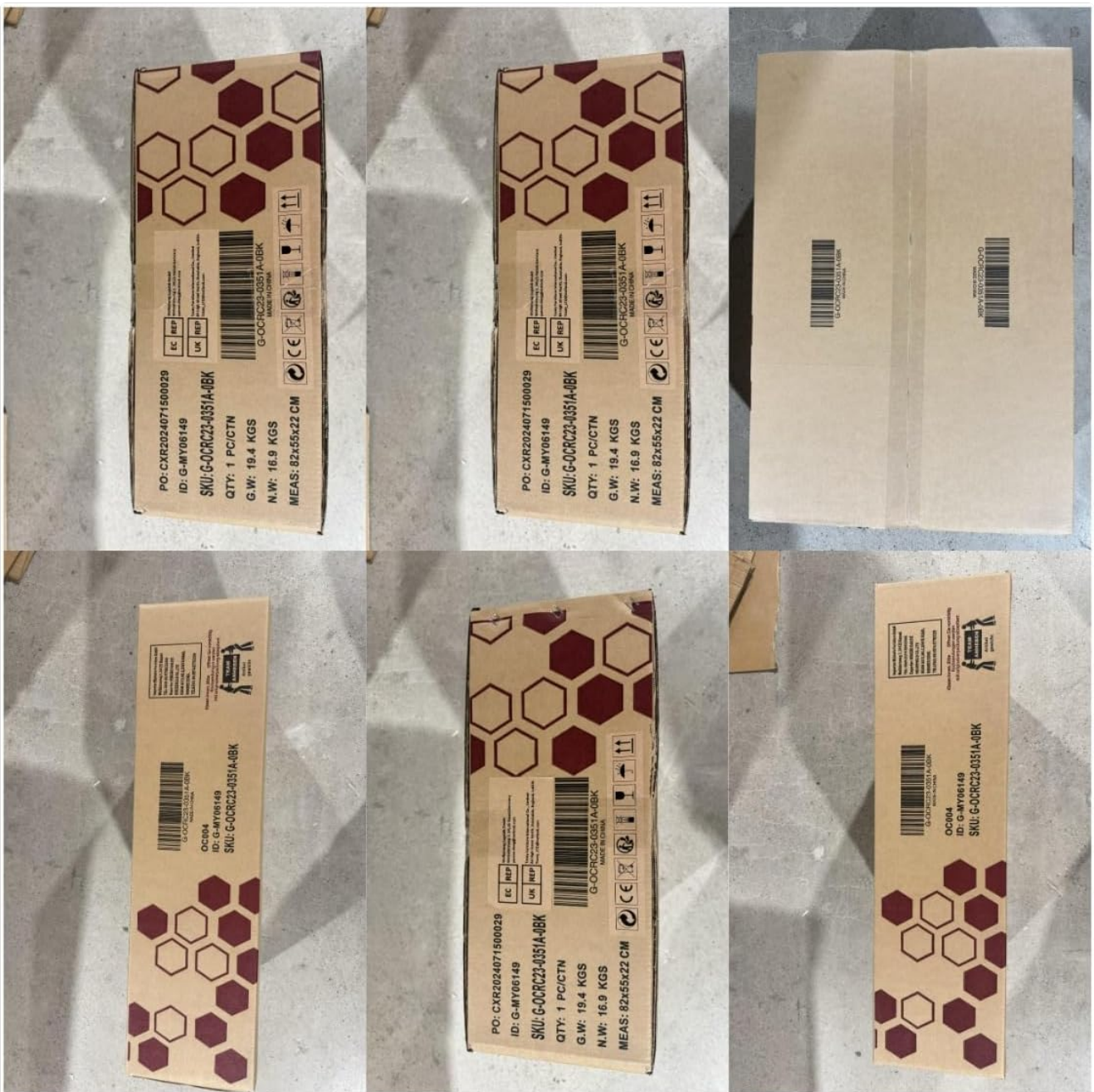
Image: Various packaging boxes containing the components of the Devoko Gaming Chair. Each box is labeled with SKU and weight information, indicating a complete set of parts for assembly.