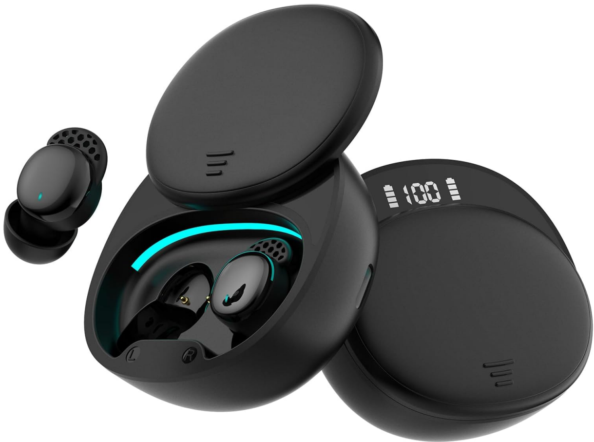
Image: The Ertuly LX410 Pro Sleep Earbuds shown in their open charging case, highlighting their compact design and LED power display.

The Ertuly LX410 Pro Sleep Earbuds are engineered for ultimate comfort and effective noise blocking, especially for side sleepers. Their ergonomic design and soft silicone ear caps ensure a snug fit without discomfort, allowing for a peaceful night's sleep or focused work sessions. These earbuds are also built for durability with IPX6 water and sweat resistance, making them versatile for various activities.