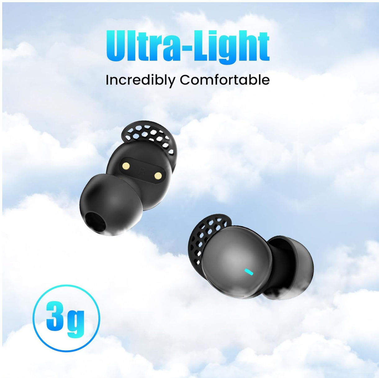
Image: Two Ertuly LX410 Pro Sleep Earbuds floating against a cloudy sky, emphasizing their ultra-lightweight design (3g).