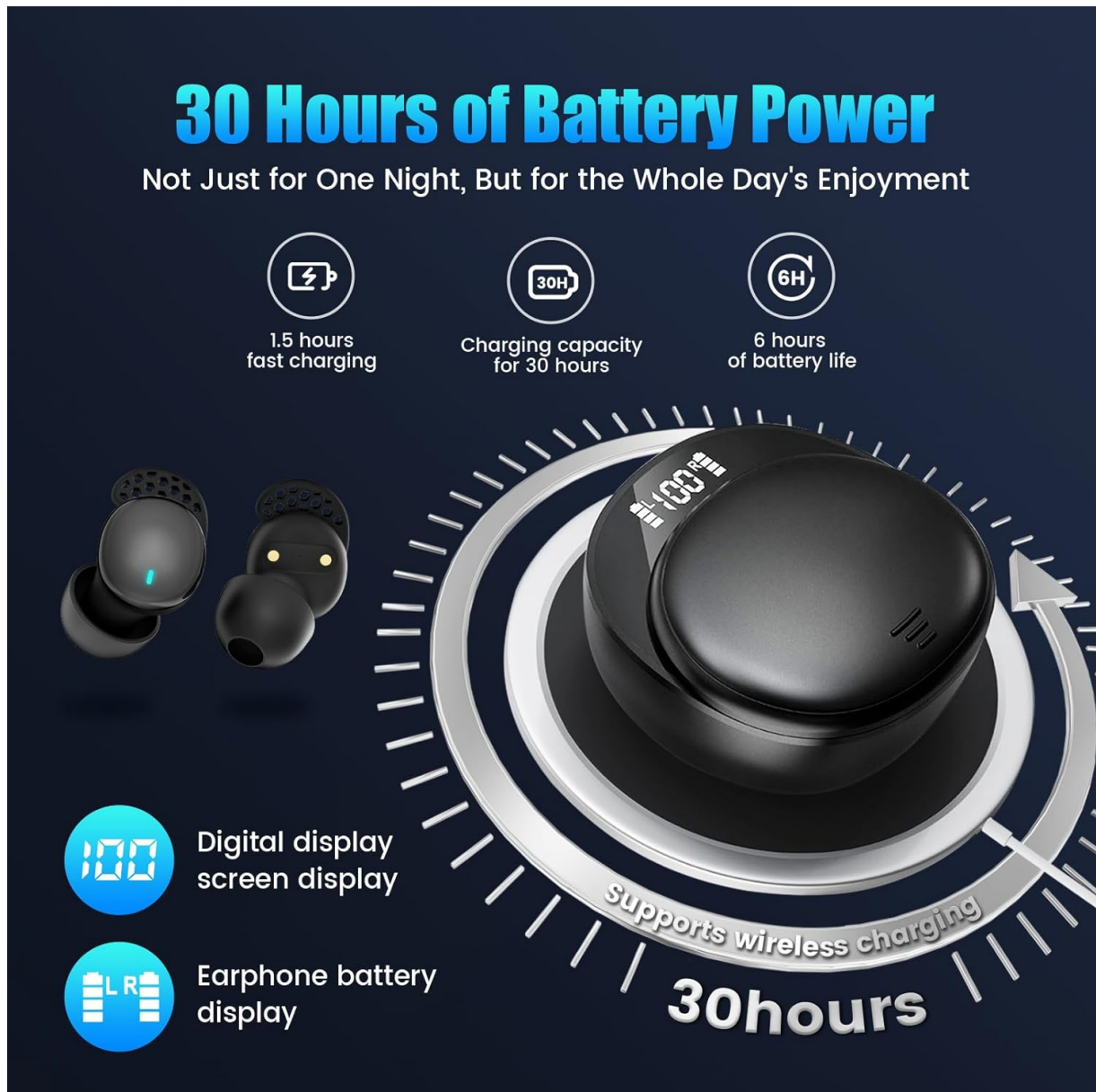
Image: Illustration detailing the 30 hours of battery power, 1.5 hours fast charging, and wireless charging support for the Ertuly LX410 Pro Sleep Earbuds.

Before first use, fully charge the earbuds and the charging case. The case supports both Type-C cable charging and wireless charging. A full charge typically takes about 1 hour.